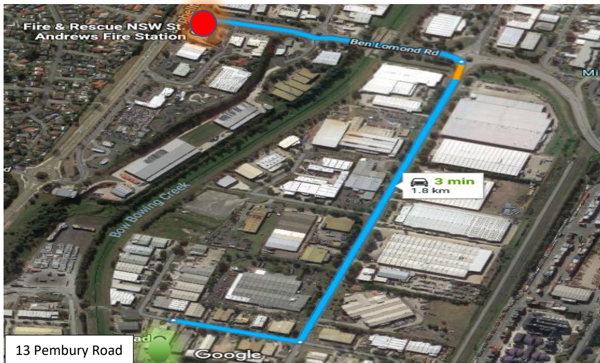
Nearest Fire Station 3min & 1.8km from subject building