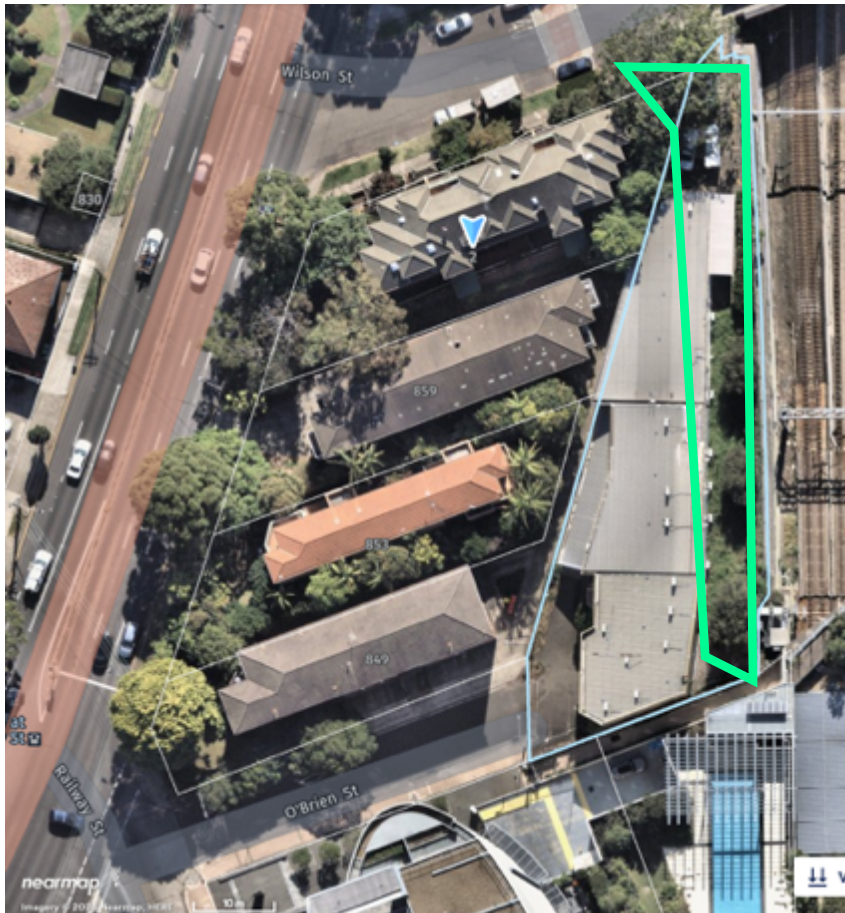
Figure 2 Aerial site map of Pacific Hwy between Wilson St & O'Brien St Chatswood. Relevant trees outlined in green.