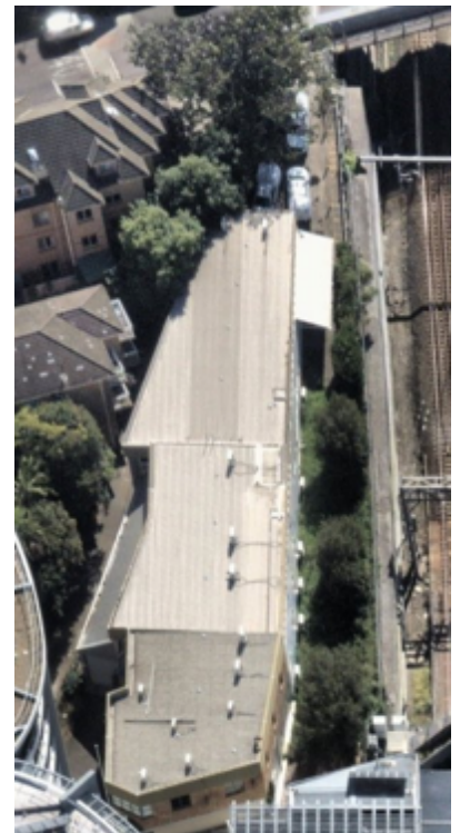
Figure 3. Panarama view of the corridor at between Wilson St & O'Brien St Chatswood.