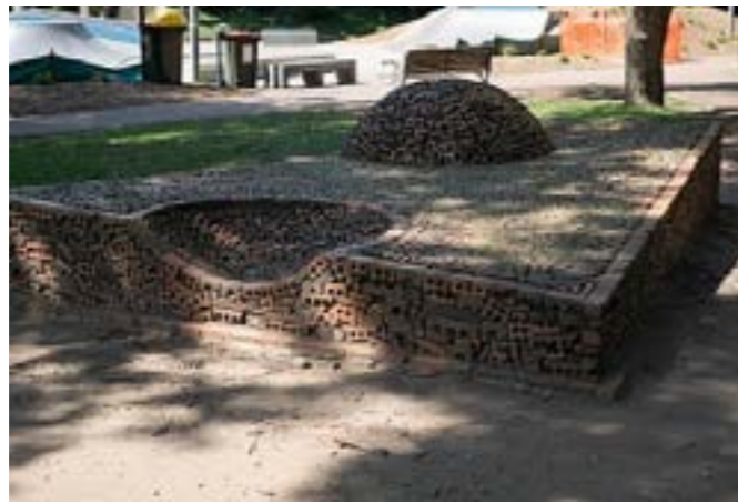
Kulla Moves out