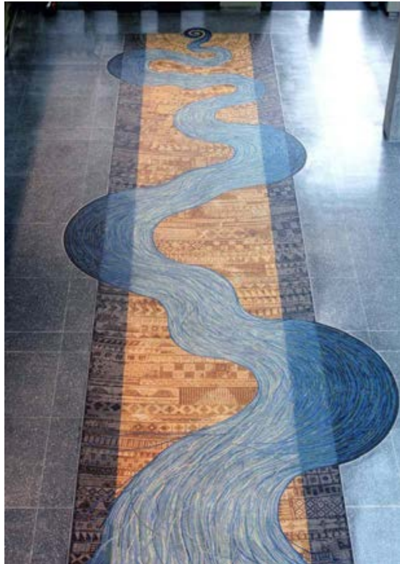
Example image of mosaic floor-art in forecourt area