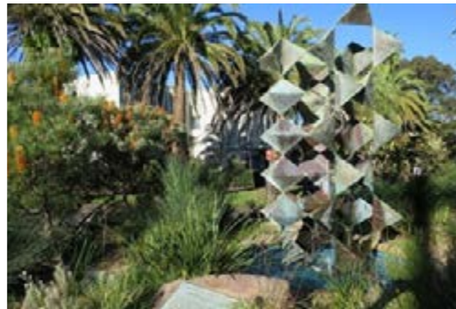
Griffin Memorial Fountain