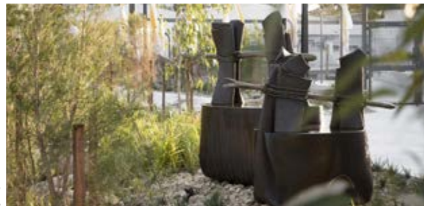
Example image of garden sculpture

Yulia Pinkusevich Stanford University, California