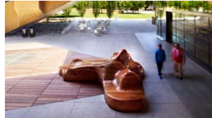
Example image of 3-dimensional sculpture