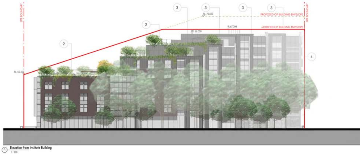
Elevation from Institute Building 1:200