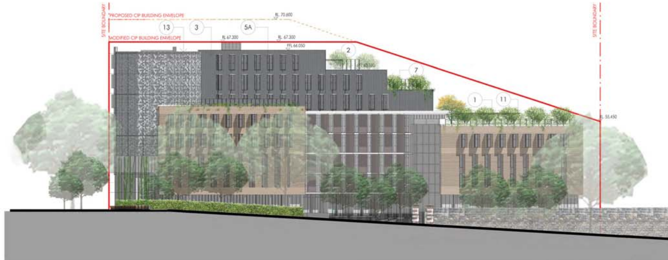
Elevation from junction of Darlington Road & City Road 1:200