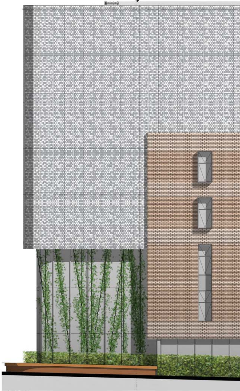
Detail D 1:50