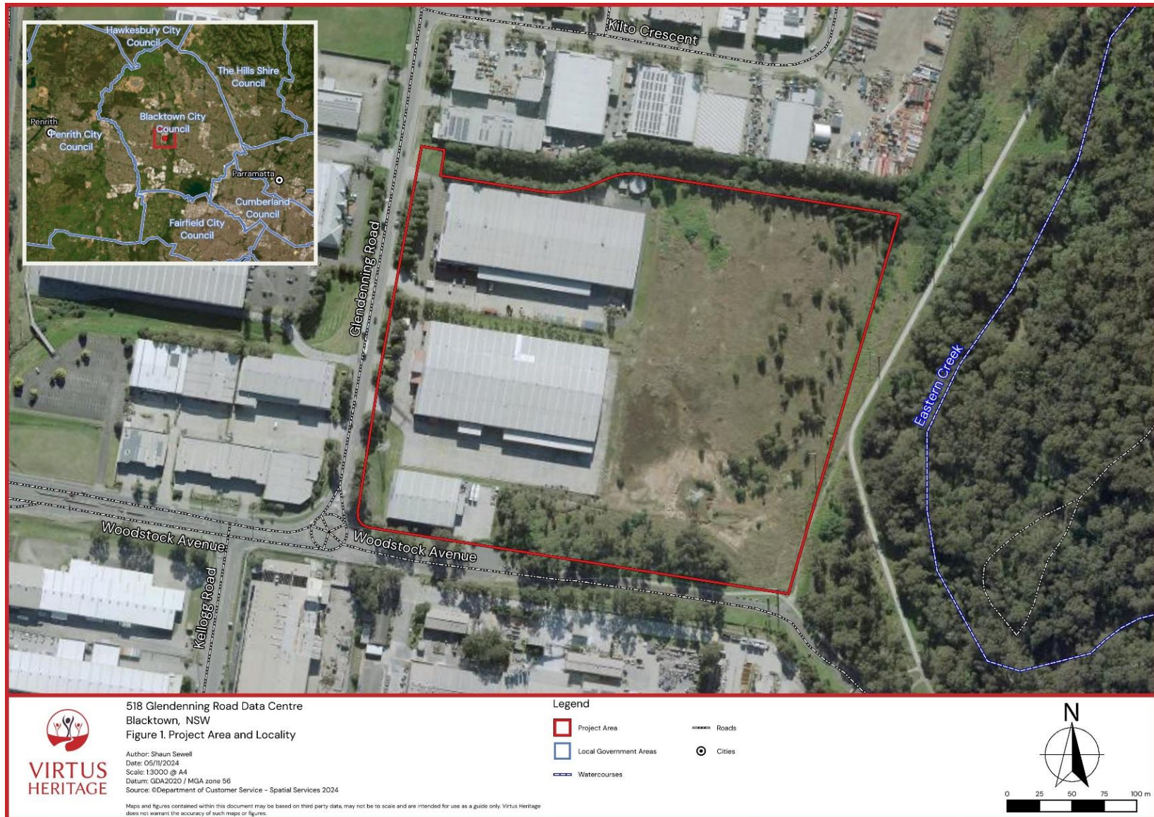
Figure 1. Project Area and Locality.