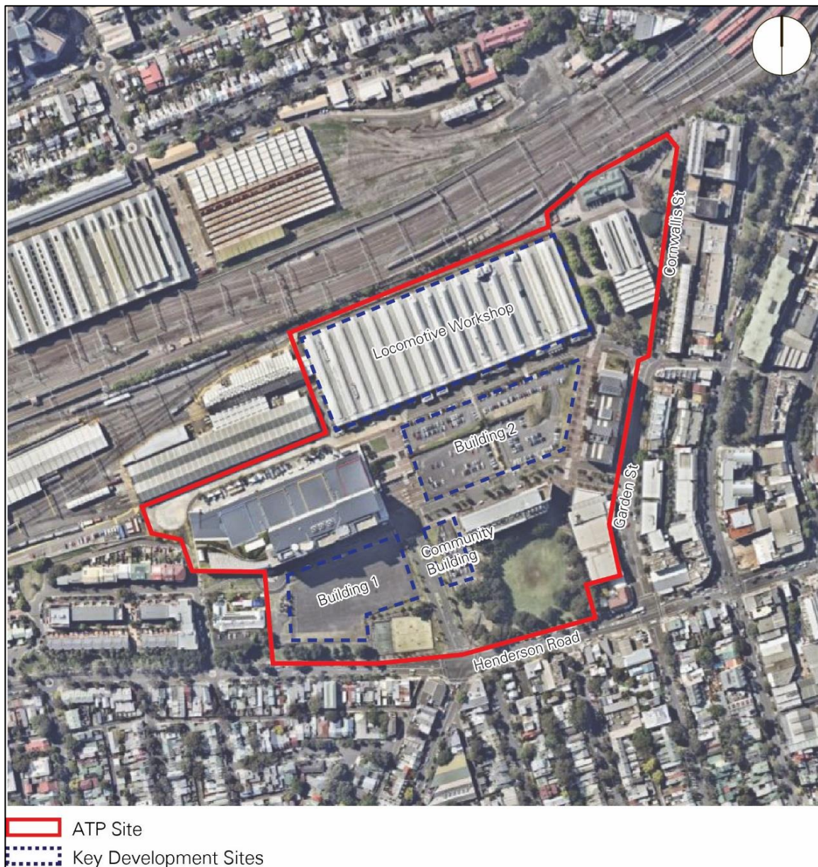
FIGURE 2: AERIAL VIEW OF THE SITE WITH KEY DEVELOPMENT SITES IDENTIFIED. COMMUNITY BUILDING (BUILDING 3) IS LOCATED APPROXIMATELY IN THE CENTRE OF THE SITE