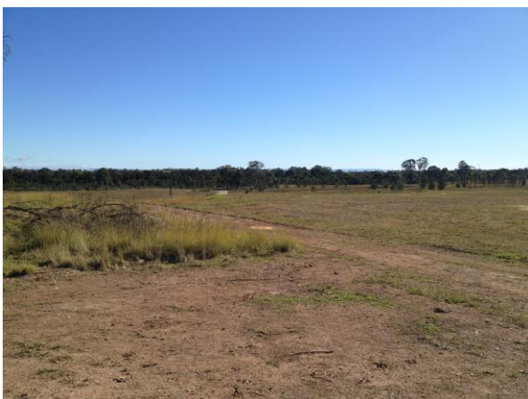
Plate 9: Site of the former OTC transmission station buildings (outside the study area)