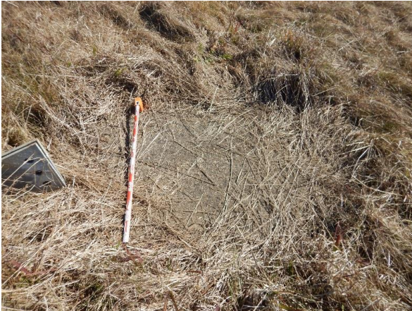
Plate 3: Concrete tower pad