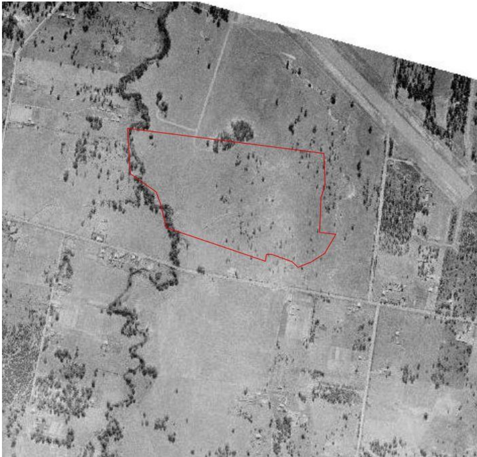
Figure 5: 1961 aerial with approximate study area location indicated in red