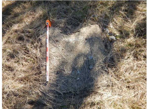
Plate 4: Concrete tower pad