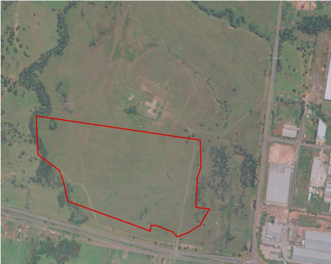
Figure 7: 2015 aerial with approximate study area location indicated in red