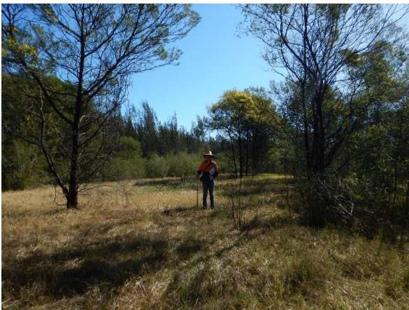
Plate 5: Revegetated area adjacent to Eastern Creek