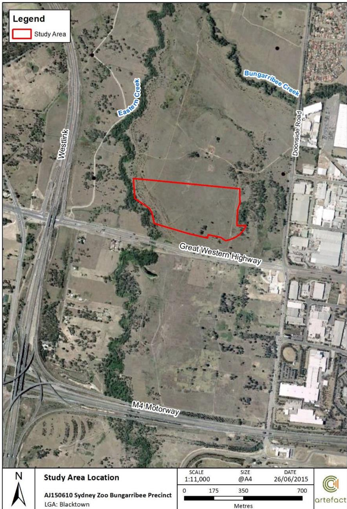
Figure 1: Location of the study area