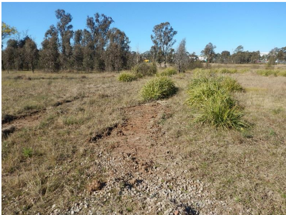
Plate 1: View east towards Doonside Road