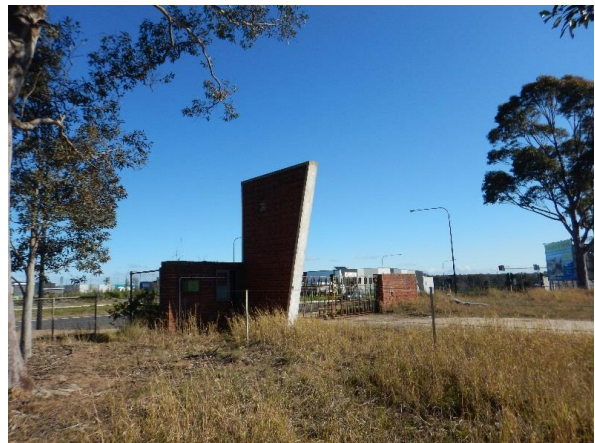
Plate 6: Former entrance to OTC transmission station (outside the study area)