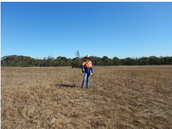
Plate 7: View west towards Eastern Creek