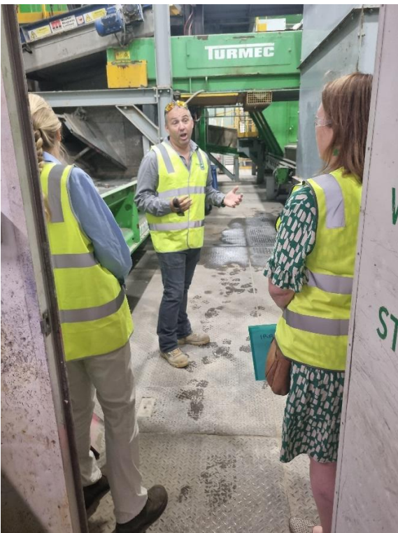
Explaining plant, insulation, dust & noise management