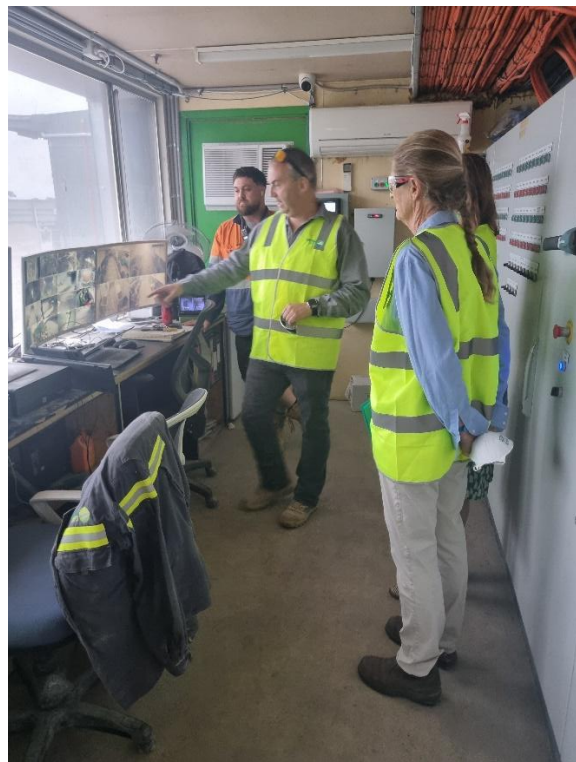
Overview of site surveillance and key operations, workforce management and site and worker safety measures