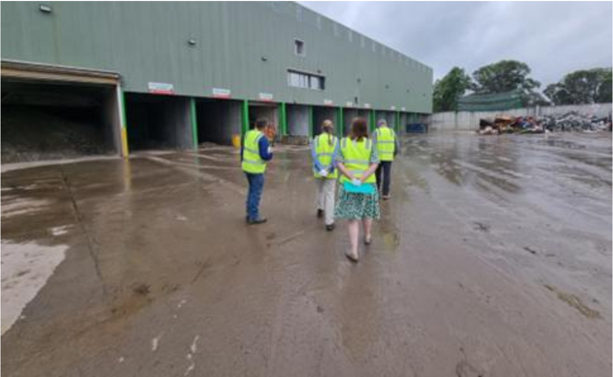
Explaining use of bays for separated materials

Site visit photos –9 December 2024 during requested site visit.