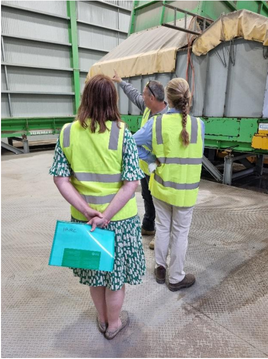
Explanation of plant capacity and resource recovery