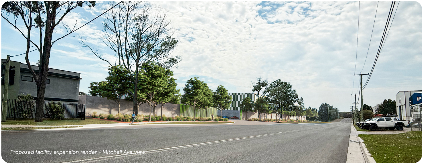
Proposed facility expansion render - Mitchell Ave view