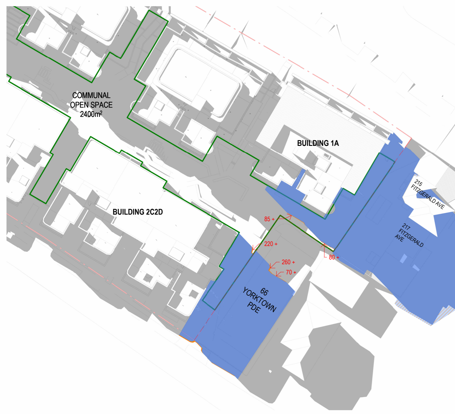
7 PLAN WINTER SHADOW DIAGRAM - 21 JUNE 3PM SCALE 1 : 600