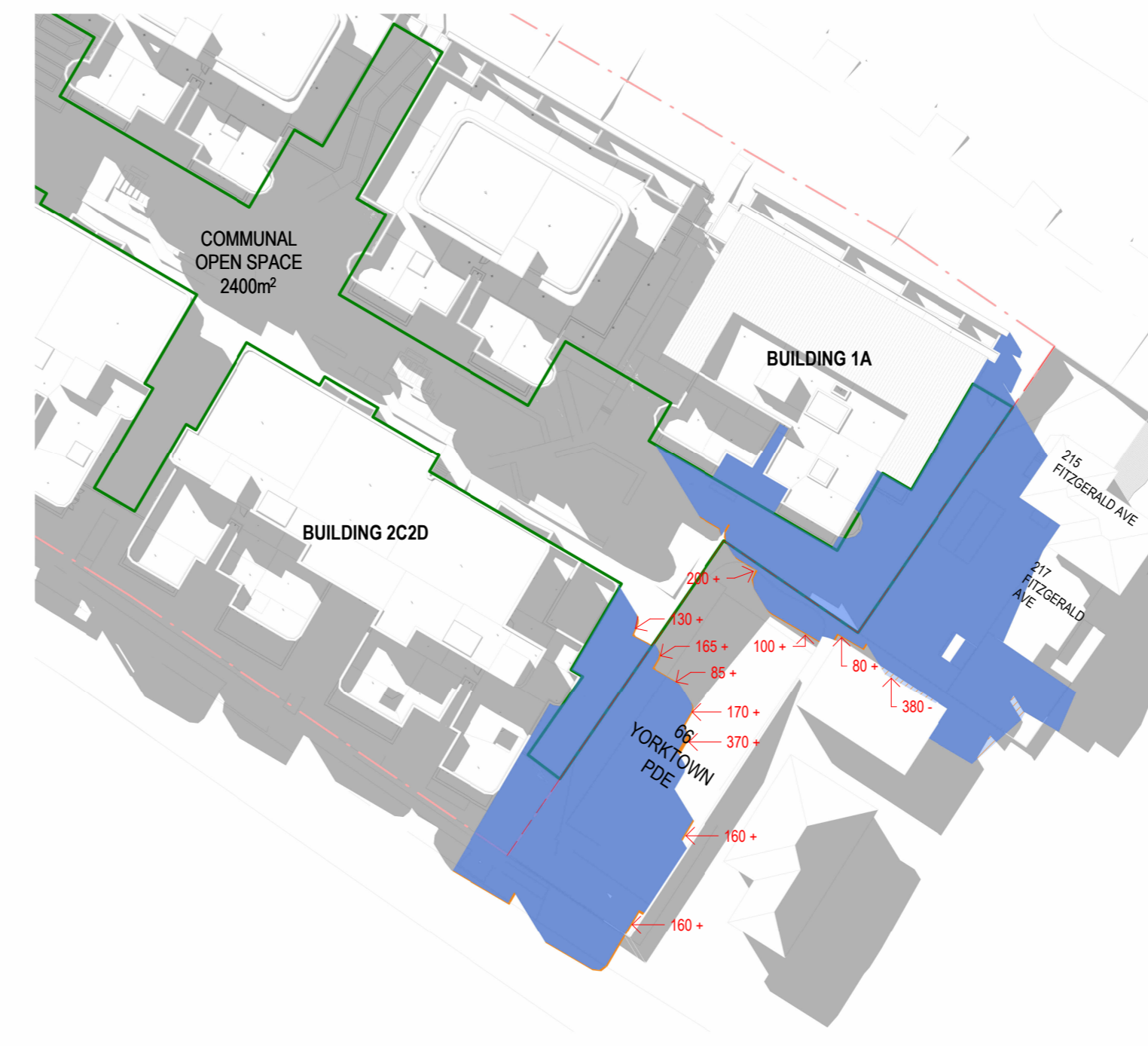
6 PLAN WINTER SHADOW DIAGRAM - 21 JUNE 2PM SCALE 1 : 600