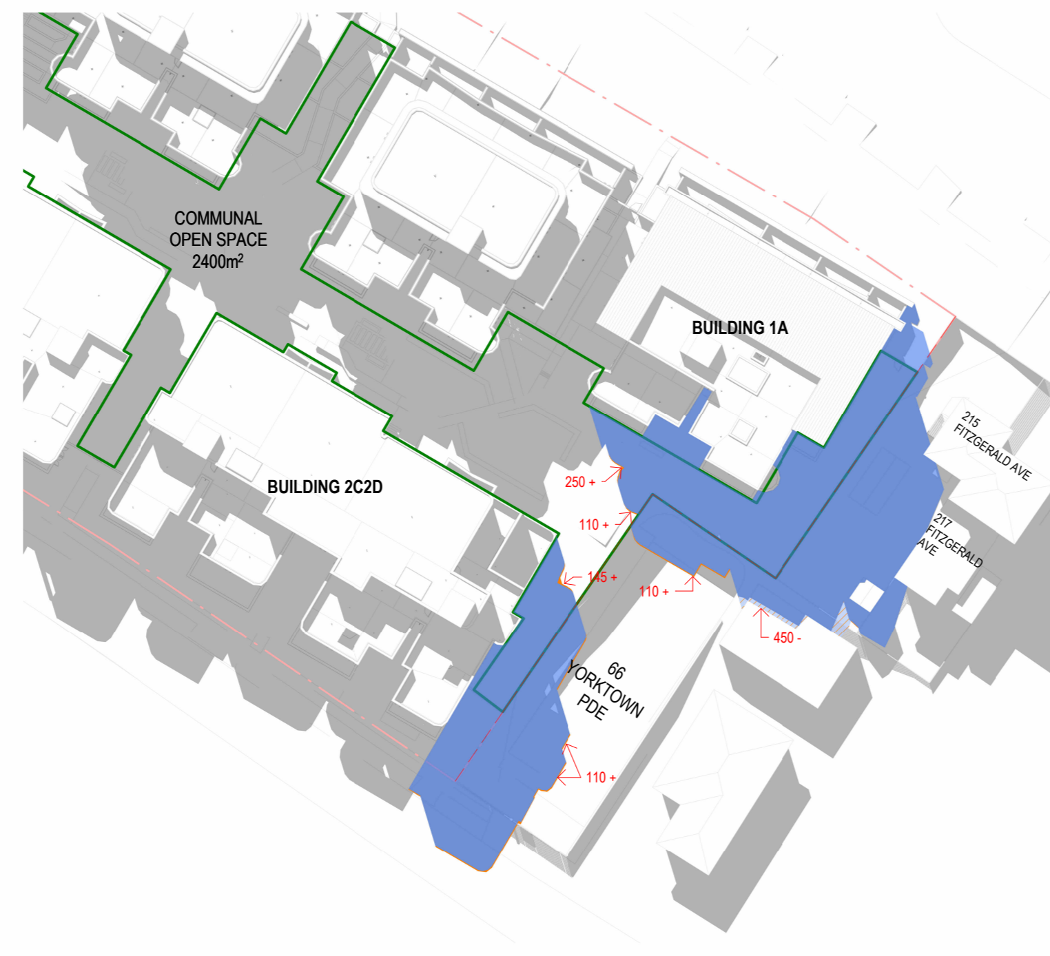
5 PLAN WINTER SHADOW DIAGRAM - 21 JUNE 1PM SCALE 1 : 600