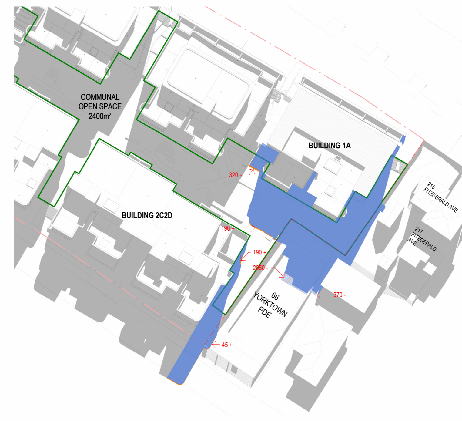
3 PLAN WINTER SHADOW DIAGRAM - 21 JUNE 11AM SCALE 1 : 600