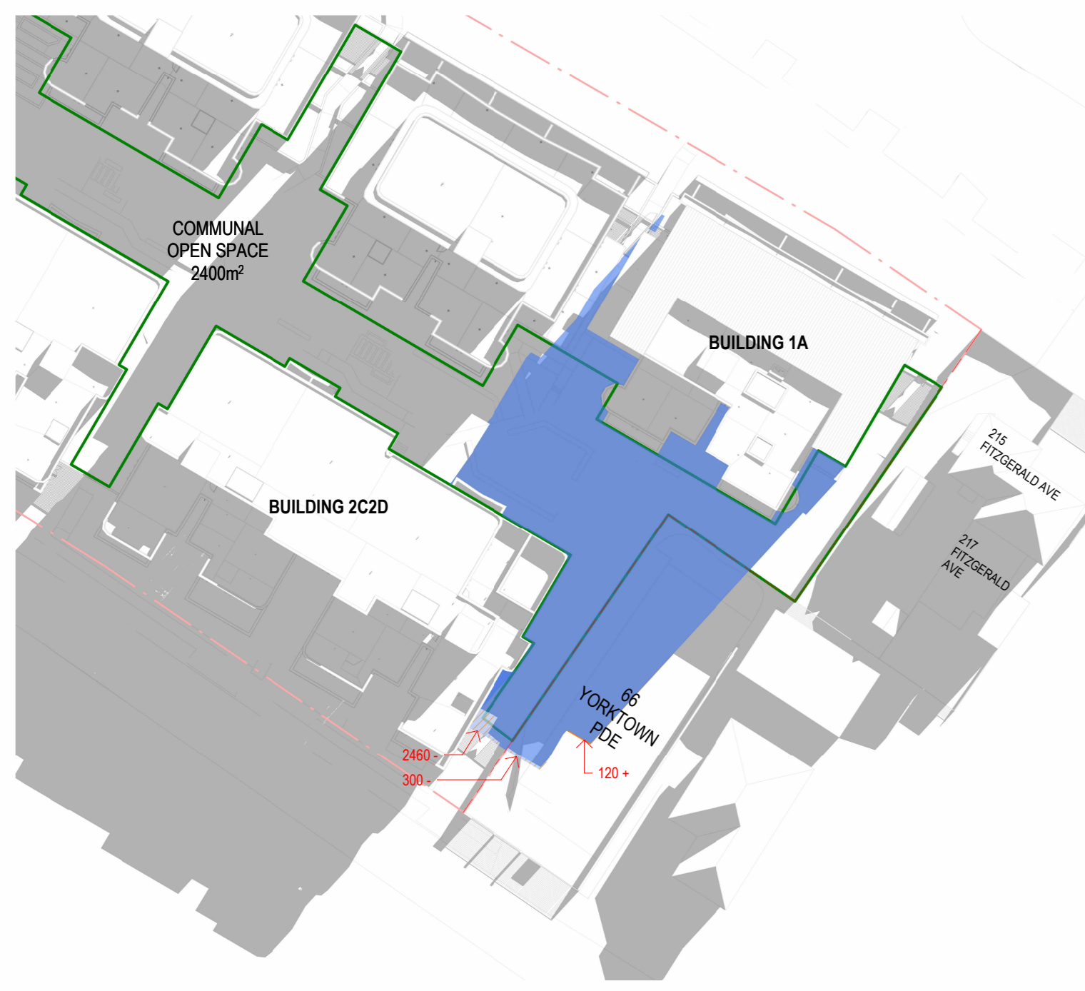
1 PLAN WINTER SHADOW DIAGRAM - 21 JUNE 9AM SCALE 1 : 600