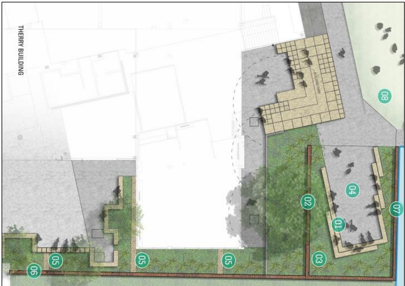
Figure 3. Proposed Landscape Plan (Arcadia, 2018)

As per the original approval, the proposed modifications will facilitate the development and use of the site for a school, with no other approved development particulars affected by the proposal.