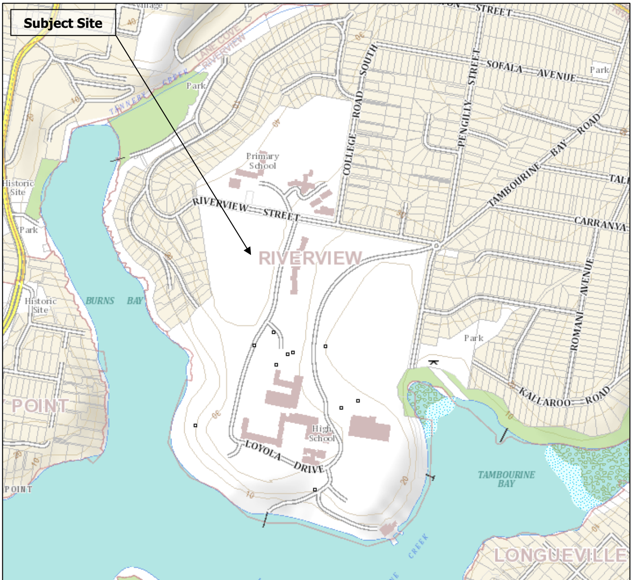
Figure 1. Cadastre Map (SIX Maps, 2017)

The subject site is identified as 2-60 Riverview Street and Tambourine Bay Road, Riverview, being legally described as Lot 10 in DP 11422773 ( Figure 1 ). Whilst the site address corresponds with the whole of St Ignatius College, the proposed modifications specifically relate to the site of the original handball courts ( Figure 2 ).