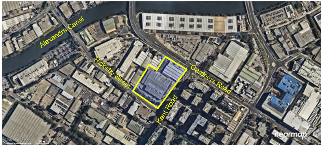
Figure 1 - Site Location

An aerial image of the site showing its location is shown in Figure 1 below.