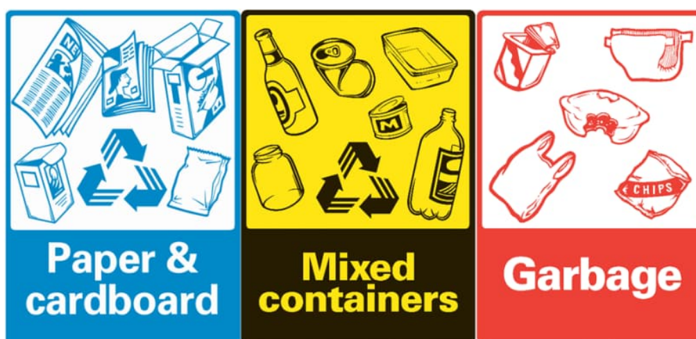
Figure 6 - Example NSW EPA labels for ongoing waste