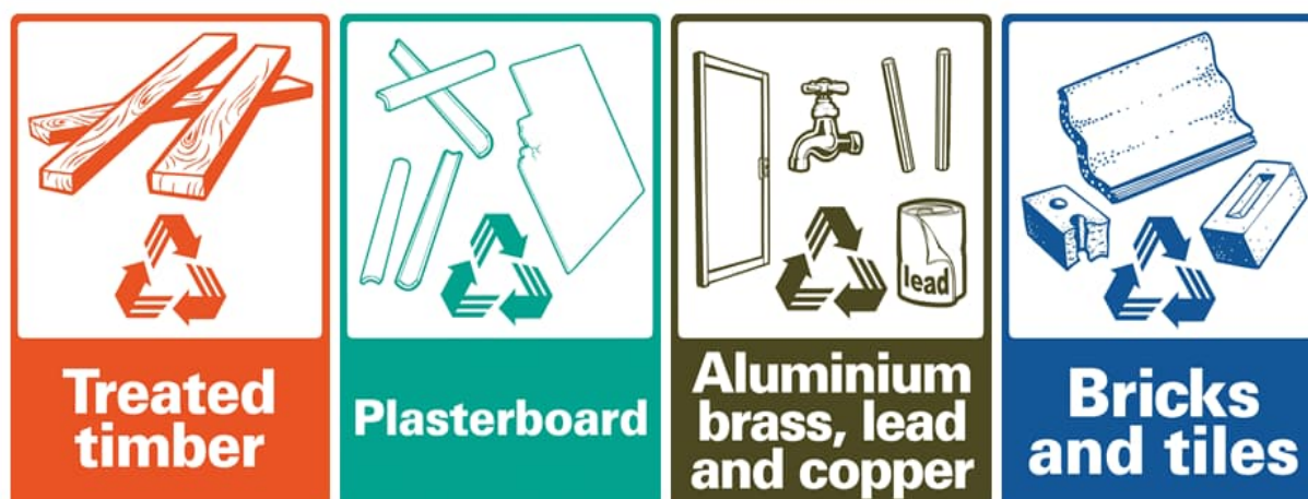
Figure 4 - Examples of NSW EPA labels for waste skips and bins