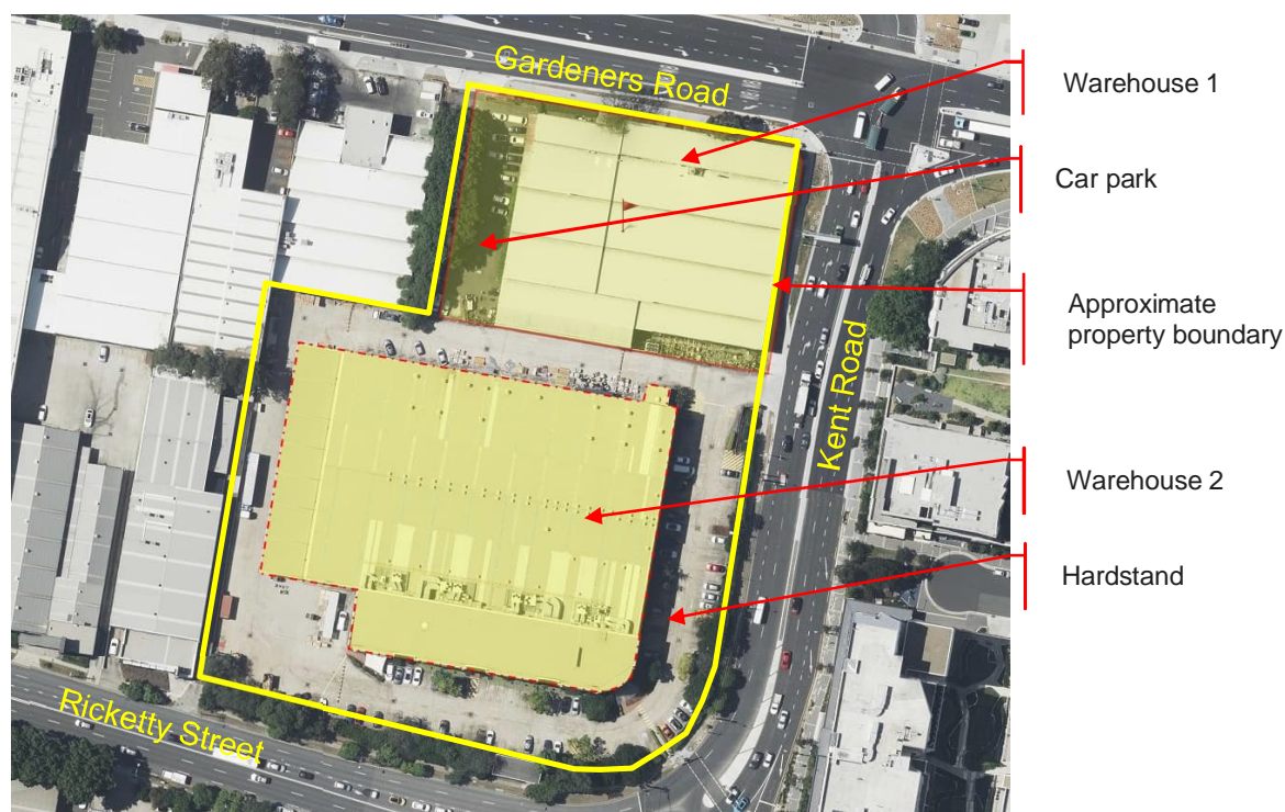
Figure 3 - Current site layout

Warehouse 1 is a two-storey brick building with a bonded metal roof. Warehouse 2 is a three-storey concrete panel building. The areas for demolition are shown in Table 6 along with estimates of the quantities of demolition waste that may be generated.