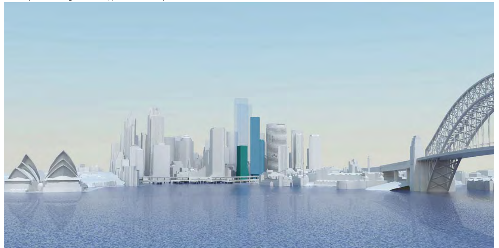
A1: Skyline looking South | Proposed Envelope