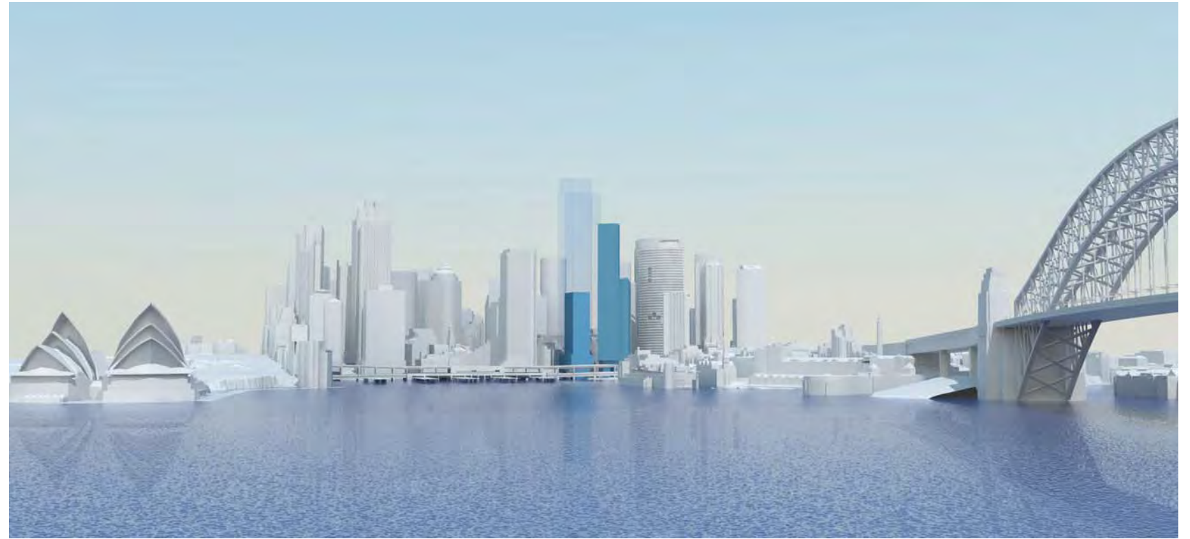
A1: Skyline looking South | Approved Envelope