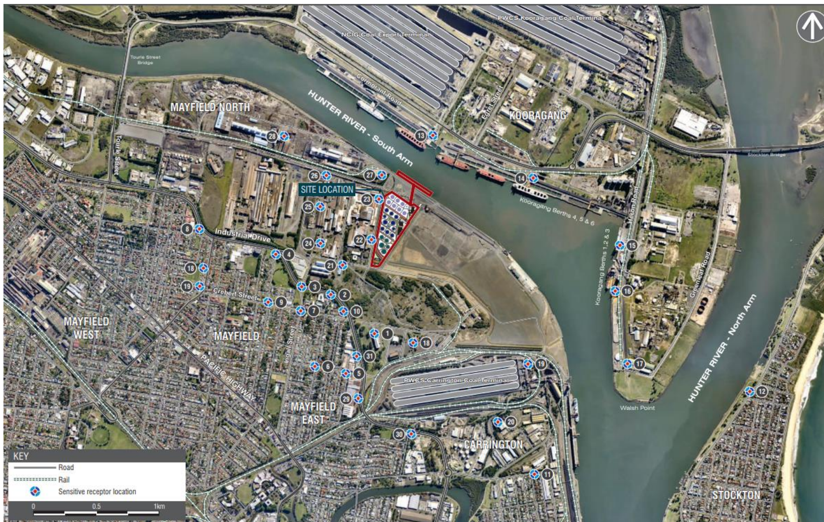
Figure 1 Site and Sensitive Receptor Locations