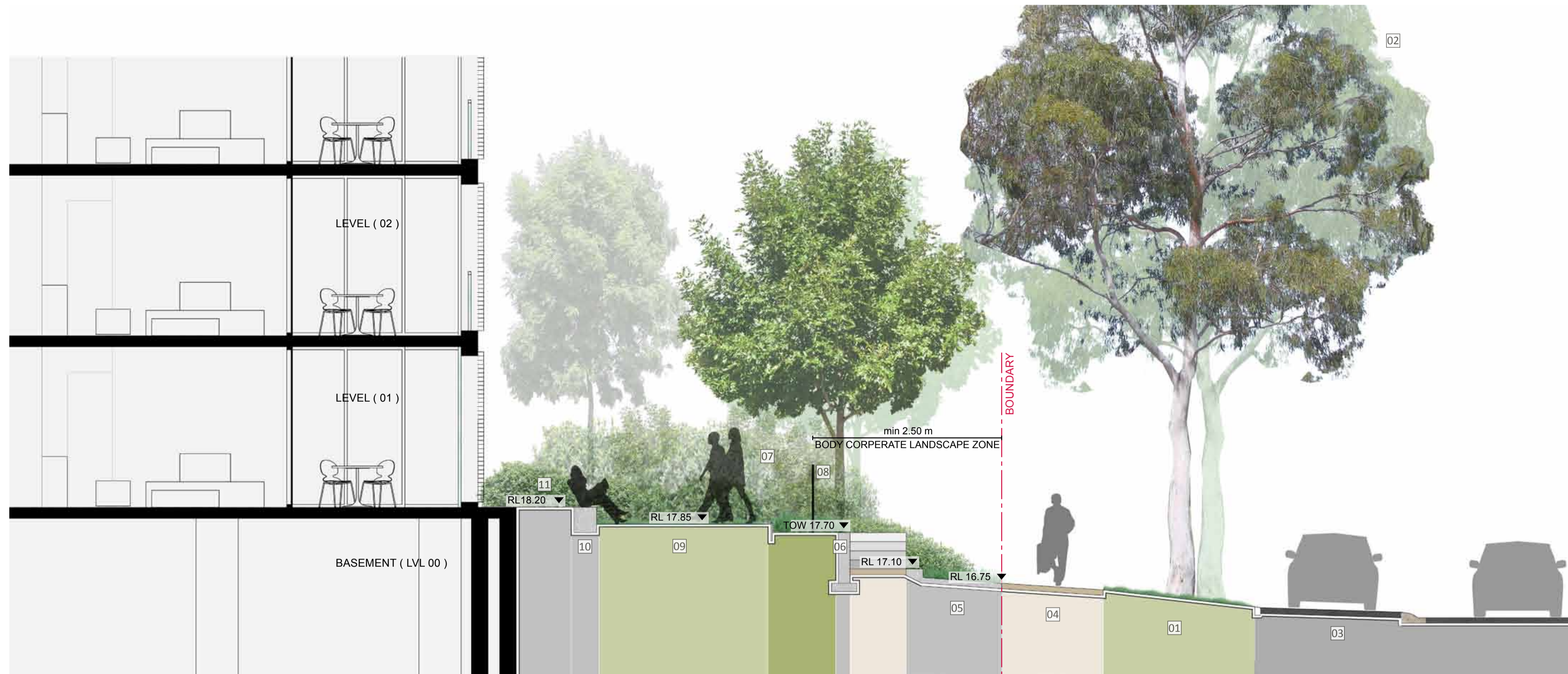
SECTION A A - BUILDING NORTH ( FIG TREE DRIVE )