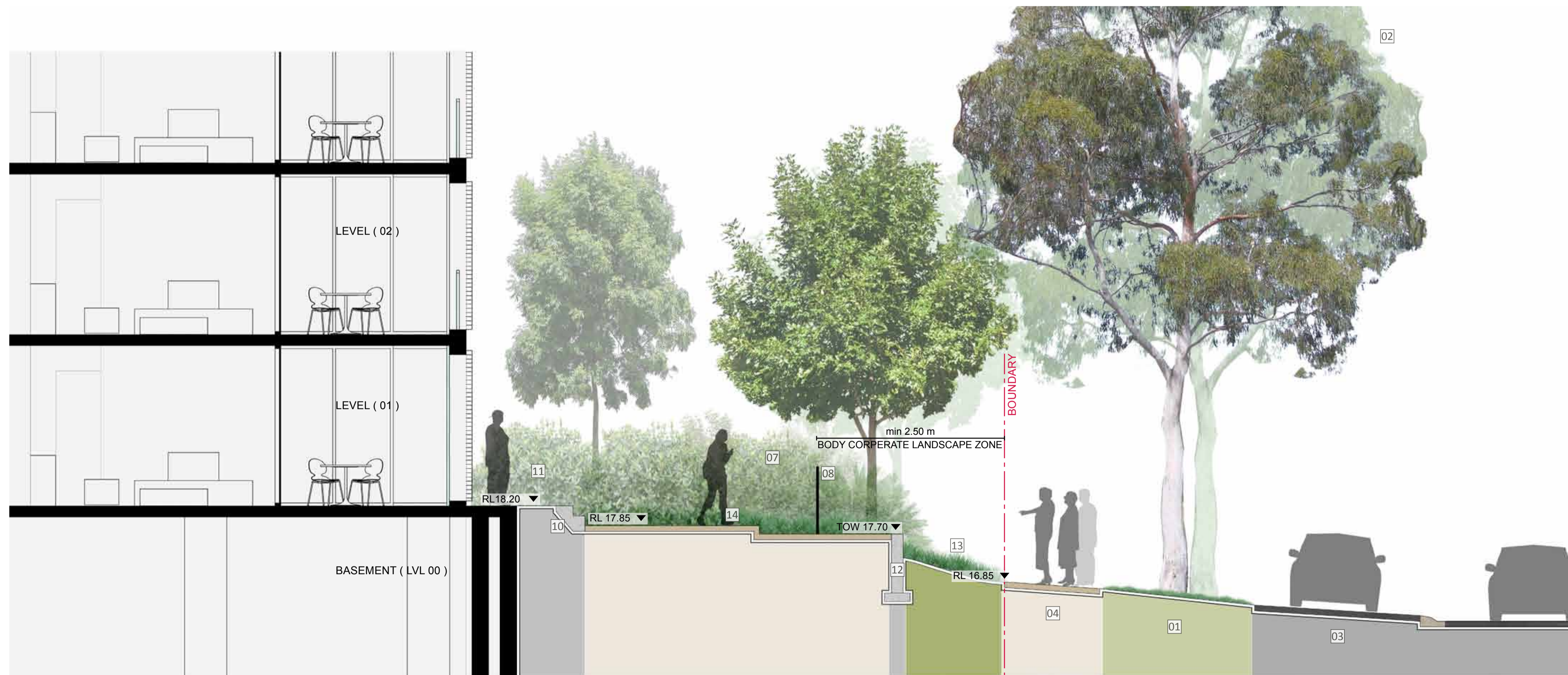
SECTION B B - BUILDING NORTH ( FIG TREE DRIVE )