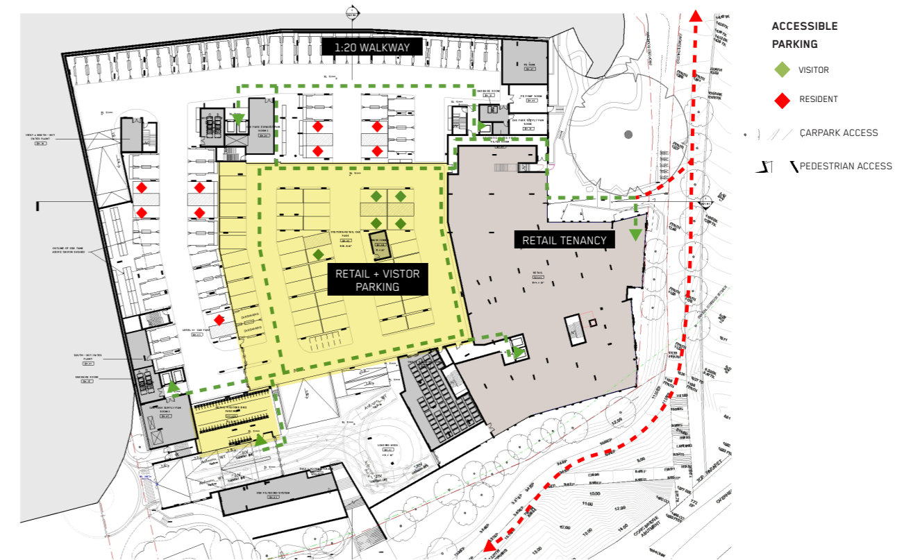
ACCESSIBLE CAR PARKING