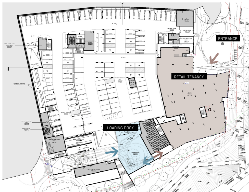
RETAIL AND LOADING BAY

Between the South and West buildings, living rooms and balconies do not directly overlook each other. Smaller window openings provide cross ventilation, and are staggered in location to ensure oblique views and minimal overlooking.