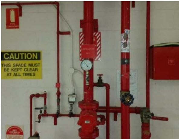
Photograph 4: Pipework without insulation lagging or identifiable fibrous gaskets. (Building 2 – Plant Room)