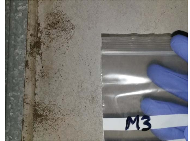
Photograph 3: Foam lagging of pipework in Plant Room. (Building 2- Plant Room)