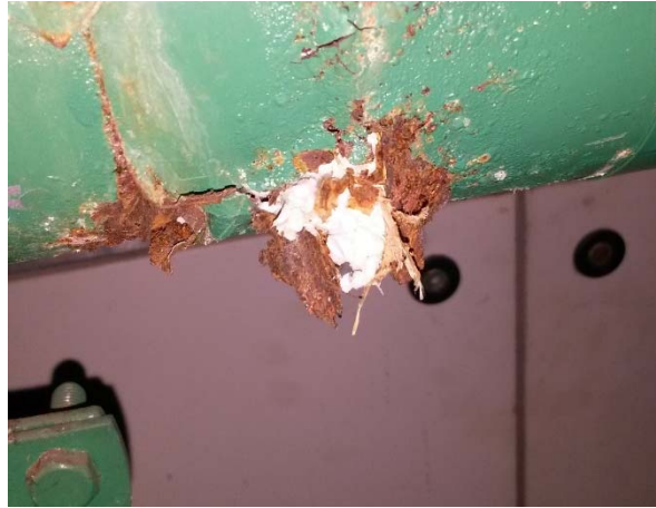
Photograph 2: Fibrous cement sheeting which does not contain asbestos (Building 2 – Cleaners Room)