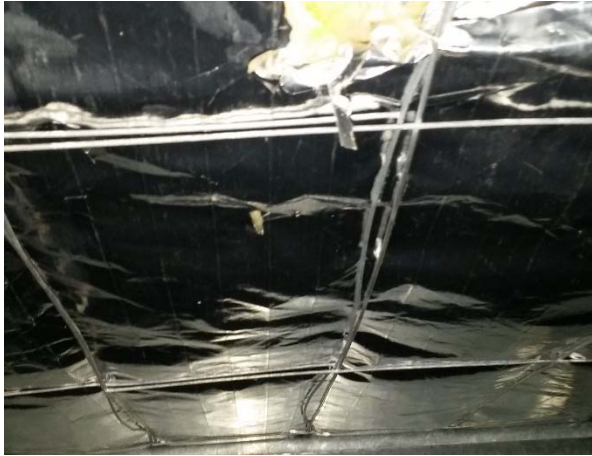
Photograph 1: Synthetic Mineral Fibre Insulation Located between sarking and wall cavity (Building 2)