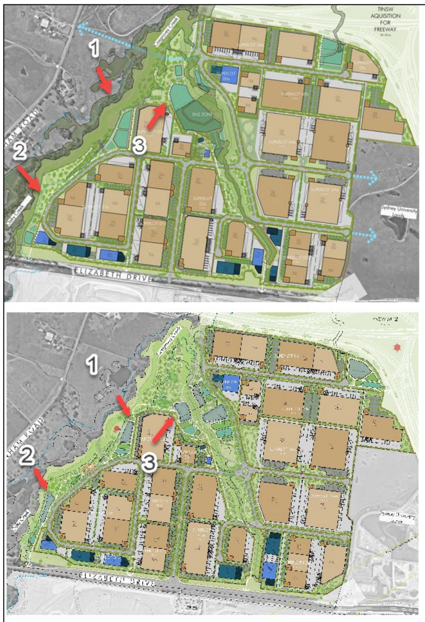
Figure 6. Detention basin changes 2024 to 2025 Development Concept Plans

A comparison of 2024 and 2025 Development Concept Plans reveals small changes in the placement of detention basins including limiting detention basin size near the Central Aboriginal Waterhole (Figure 6). The net result is an improvement in outcomes for the protection of Aboriginal heritage whereby the 2025 plan identifies the location of the waterhole for protection purposes.