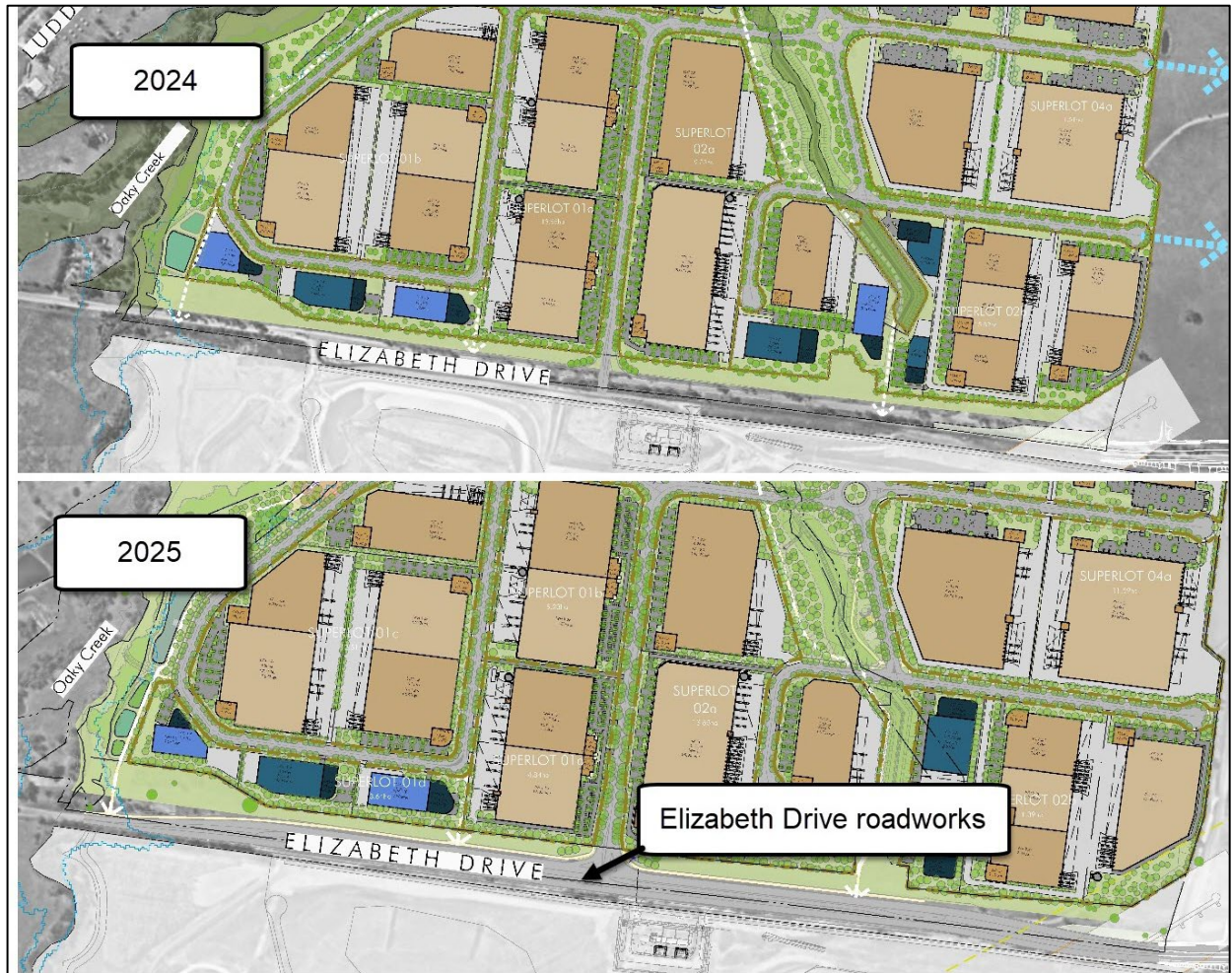
Figure 4. 2025 roadworks plan compared to 2024 plan