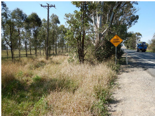
Photograph 1. Elizabeth Drive verge view east

Notwithstanding this patchy disturbance, the impact assessment expands the area of development impact by 0.2 hectares. This additional impact is readily mitigated by the proposed management measures in the ACHAR.