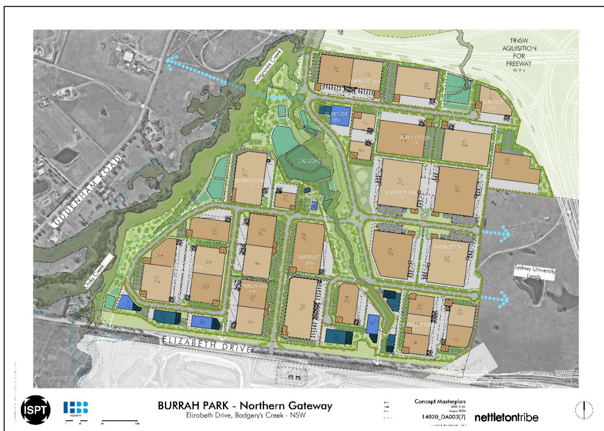
Figure 2. 2024 Development Concept Plan in original ACHAR

The 2025 plan includes road improvement works within the Elizabeth Drive road easement along the southern boundary of the development area (Figure 4). These works extend the length of the Oaky and Cosgrove creeks proximate area from 1,500 metres to 1,530 metres. It is the assessment of archaeological sensitivity within the additional road reserve area that is the subject of this addendum impact assessment.