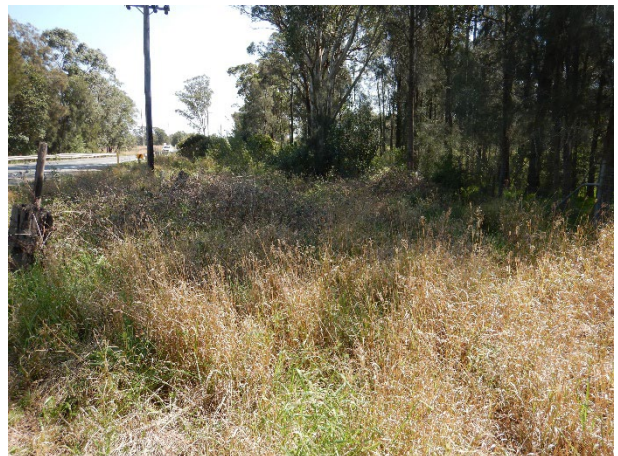
Photograph 2. View to Oaky Creek bridge view west