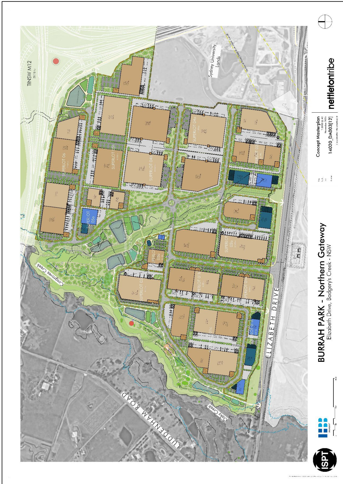
Figure 3. 2025 Development Concept Plan