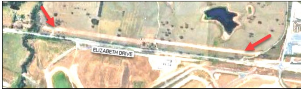
Figure 5. Sydney Water pipeline construction within Burrah Park land

The Elizabeth Drive roadworks extend beyond the Lot 1 southern boundary over a width of approximately 30 metres. Of these 30 metres a 10 metre wide area next to the old Lot 1 chain link fence is relatively undisturbed and the remaining 20 metres comprised modified land surface including road tarmac and road verge. It follows that the Aboriginal heritage impact assessment must consider a 10 metre wide strip. Following the model of archaeological distribution presented in Figure 1 and confirmed through test excavation documented in the ACHAR, a 200 metre length of the 10 metre wide strip falls within site 45-5-4641 (site OKC). Observation of this strip in early September 2025 found this strip to be heavily grassed and includes patches of dumped spoil.