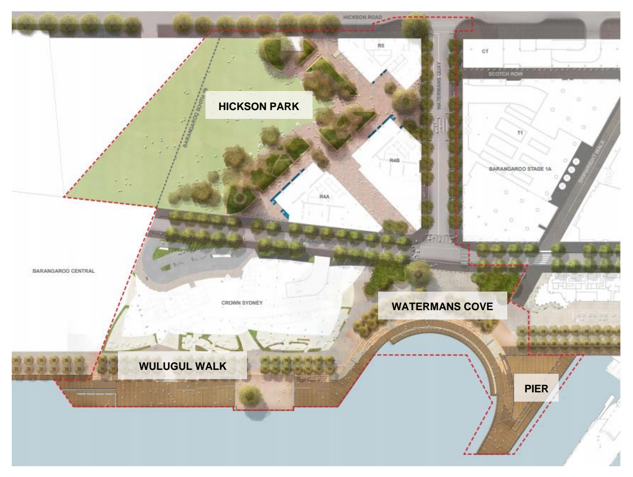
Figure 2 Overview of public domain works

This modification application (SSD 6957 MOD 5) does not propose to alter the timing of delivery of any other areas of public domain, apart from Hickson Park. Condition B12 of the Concept Plan approval will therefore continue to be satisfied.