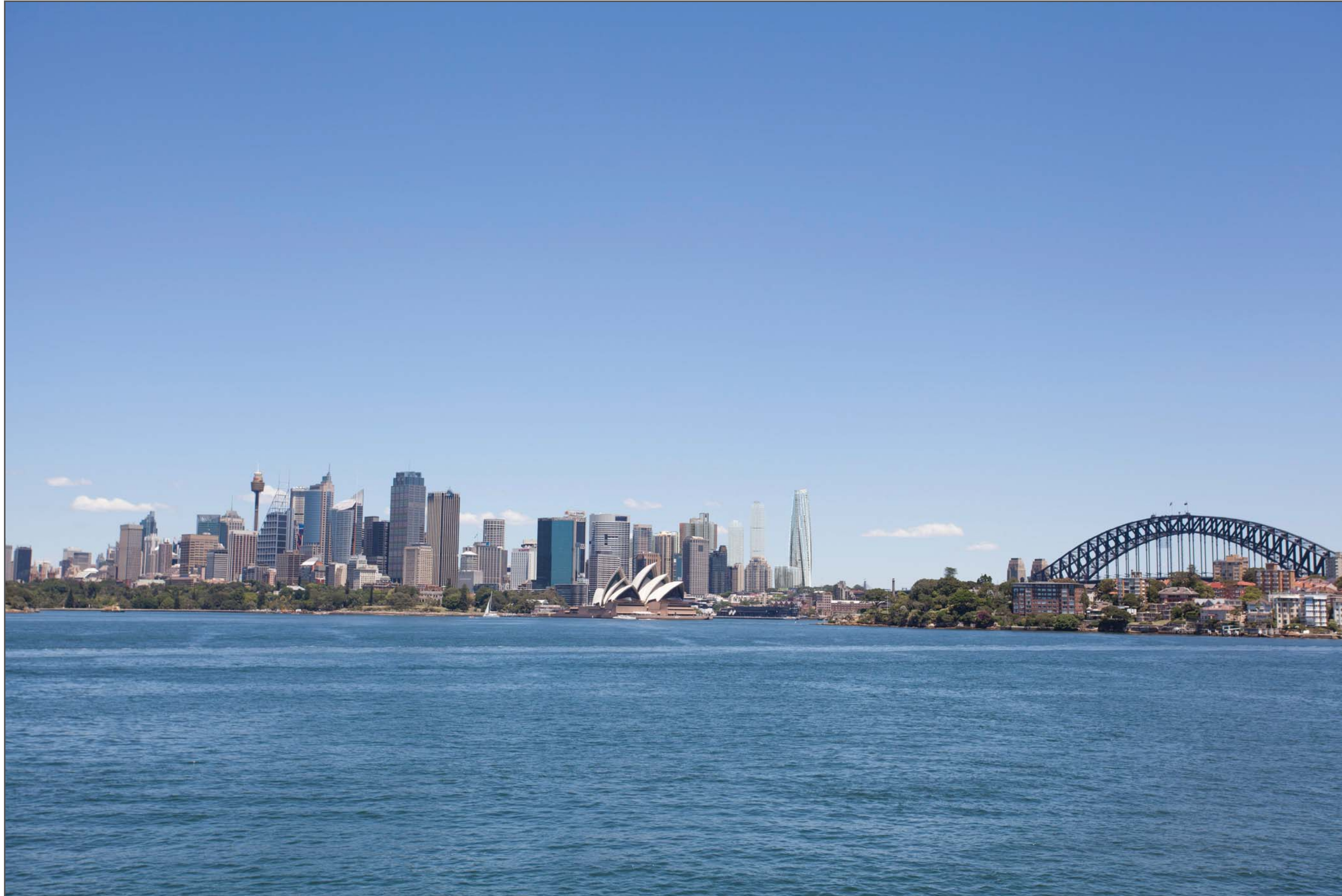
Image showing massing of the Proposed Crown Sydney Hotel Resort Application with indicative design.