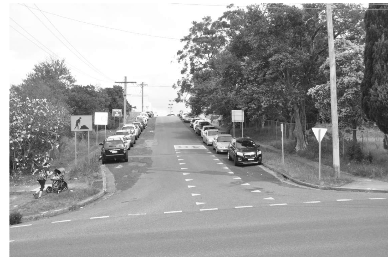
Site Photo: Highlighting the existing condition of Beane Street

Context map: Highlighting the existing form in relation to the key landscape features; President's Hill, Rumbalara Reserve and Brisbane Waters.