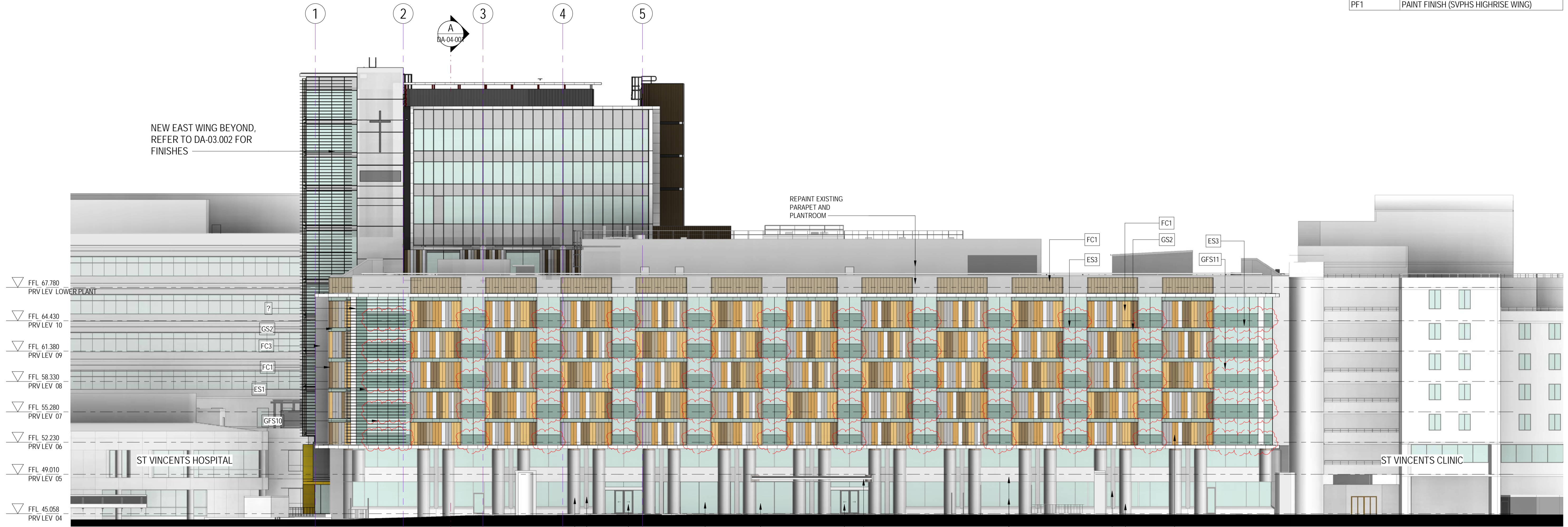
1 VICTORIA STREET ELEVATION 1:200