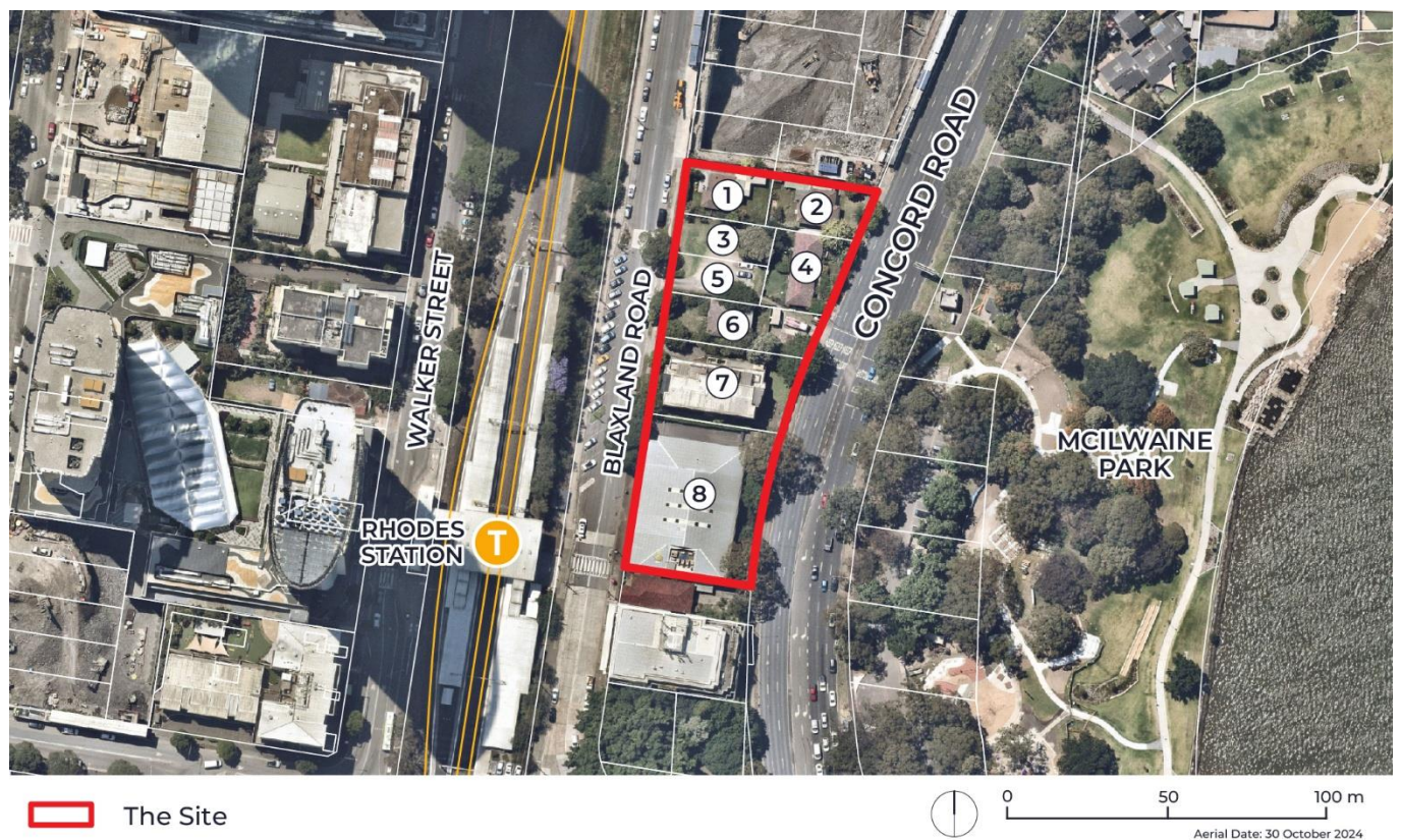
Figure 2 Updated Site Aerial Map