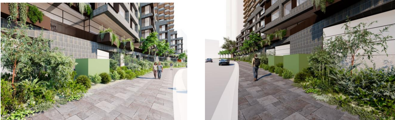
Figure 4 Artist Impression of the Padmount Kiosk Type Substation Installation

The design team has considered a number of options for substation location and have developed the Padmount Kiosk type substation strategy along Concord Road (refer to Figure 4 below).