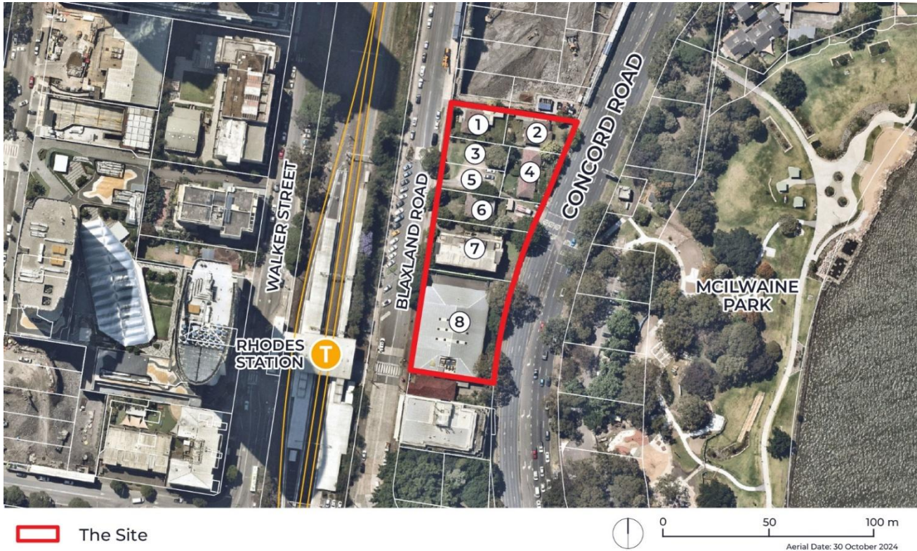
Figure 1 Site Aerial Map