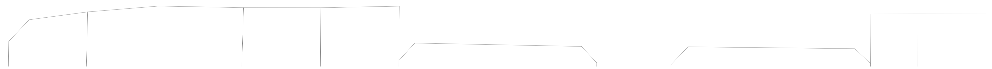
1 Site Plan