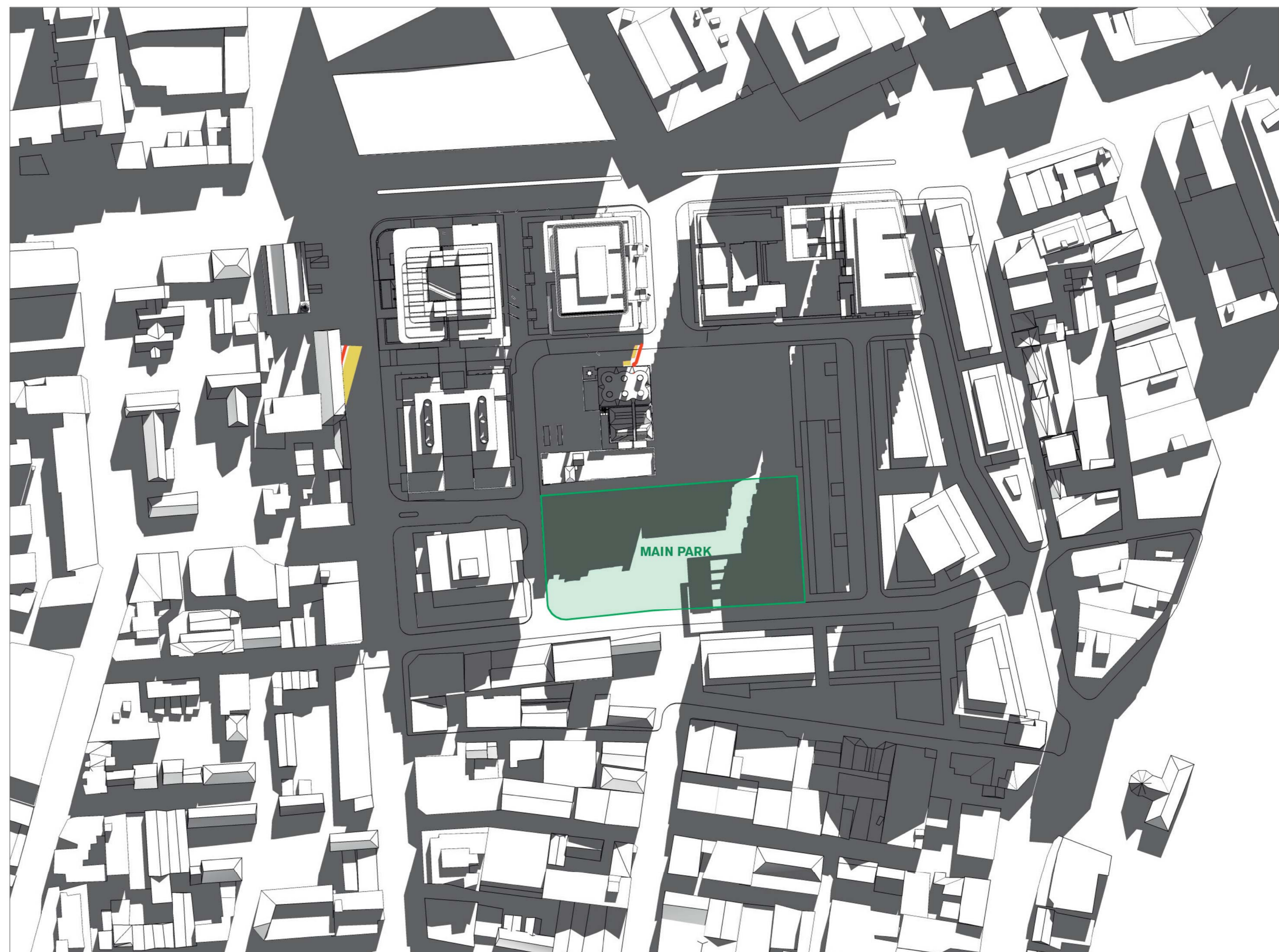
04 21 June 11:00 AM