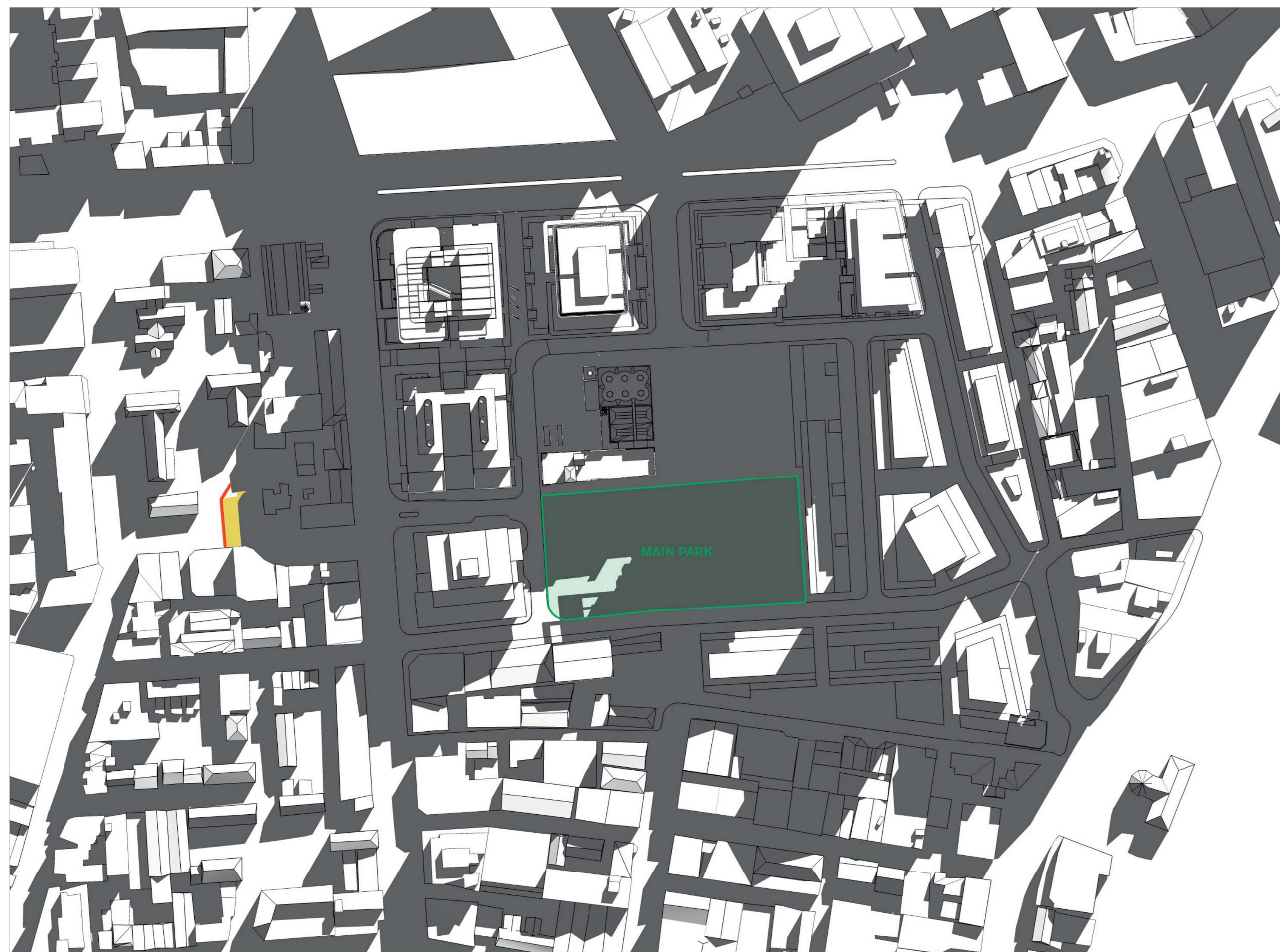
03 21 June 10:00 AM