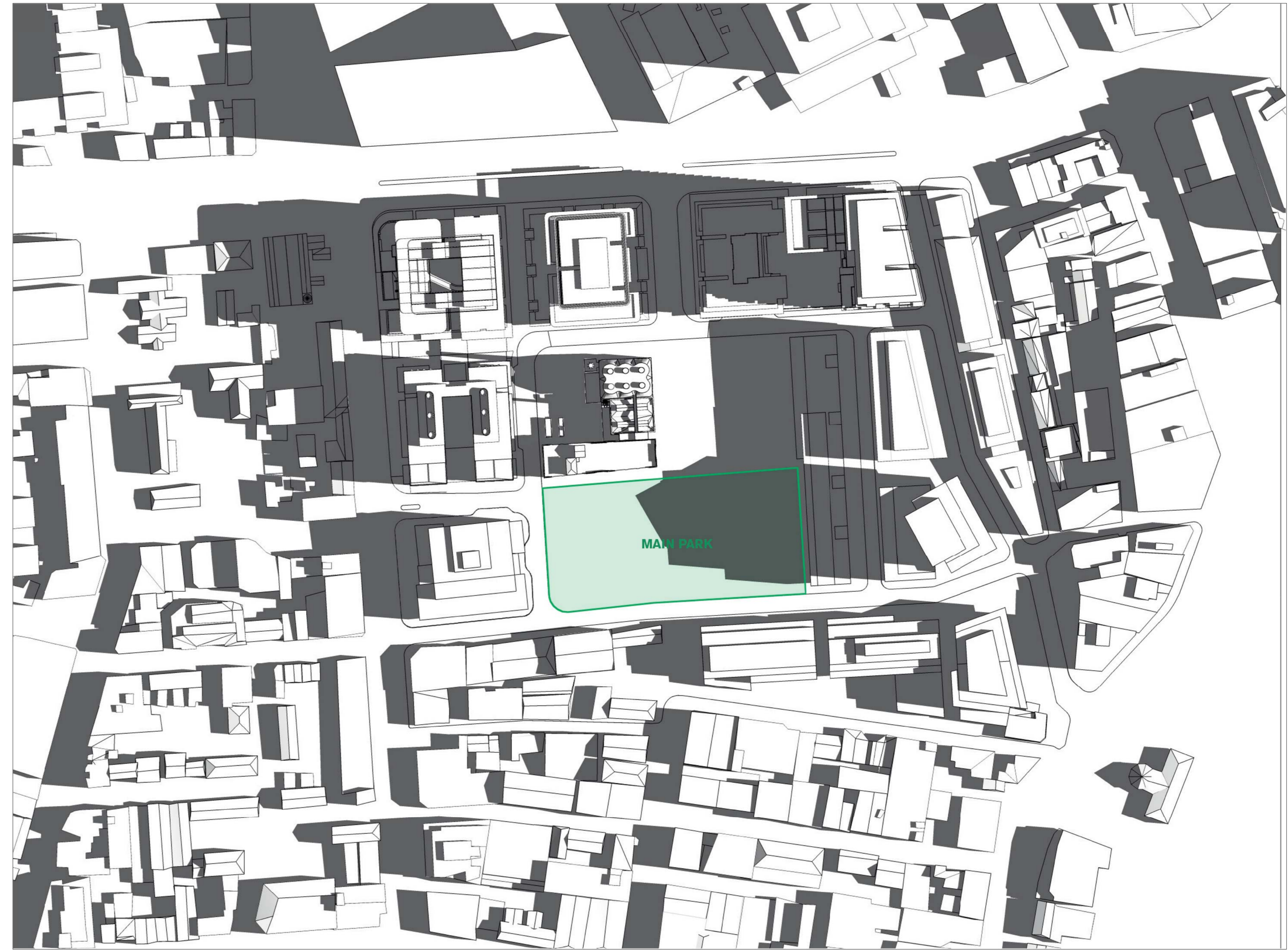
02 21 December 08:00 AM