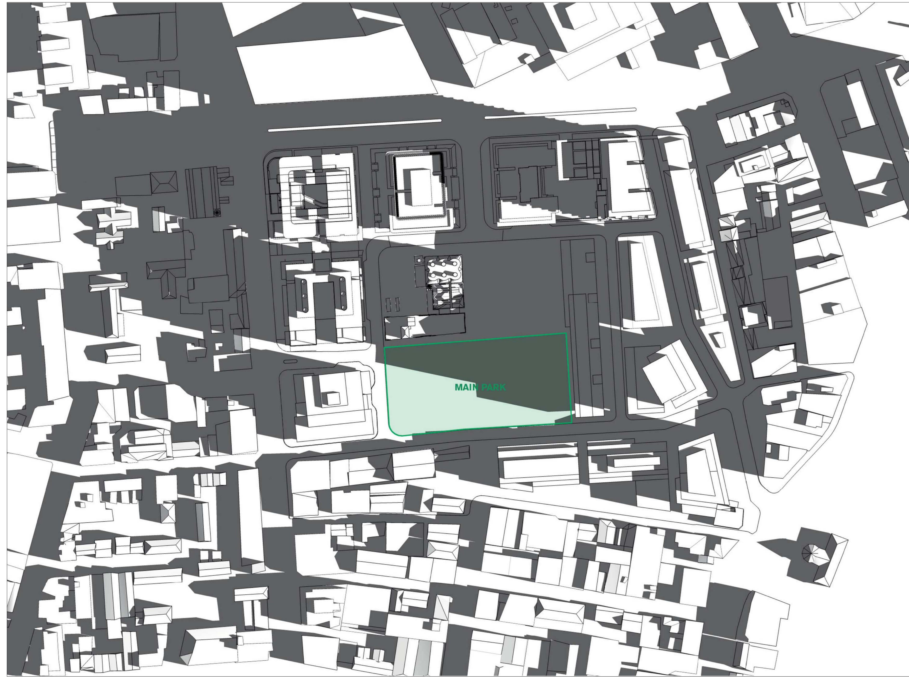
01 21 December 07:00 AM