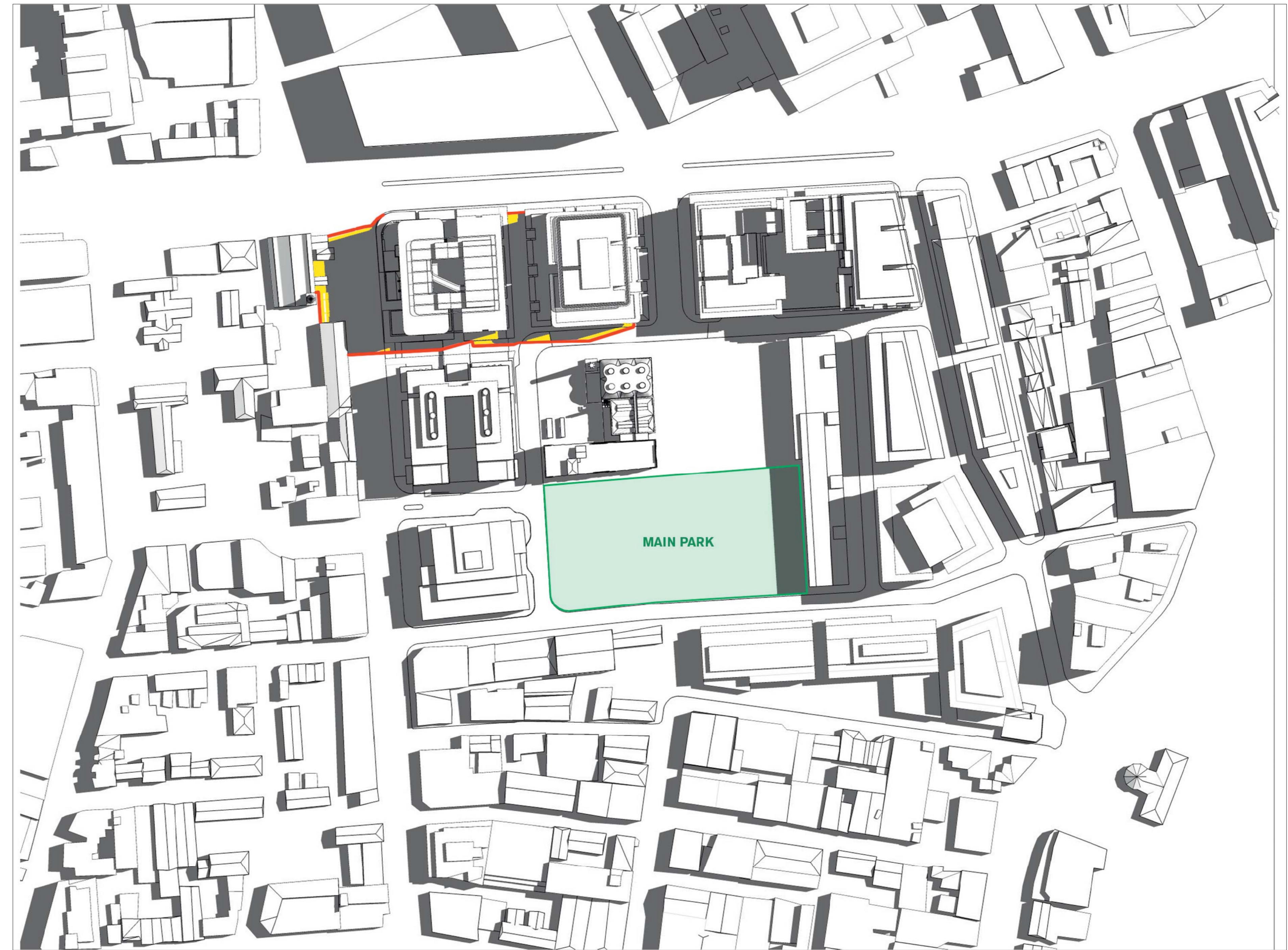
04 21 December 10:00 AM