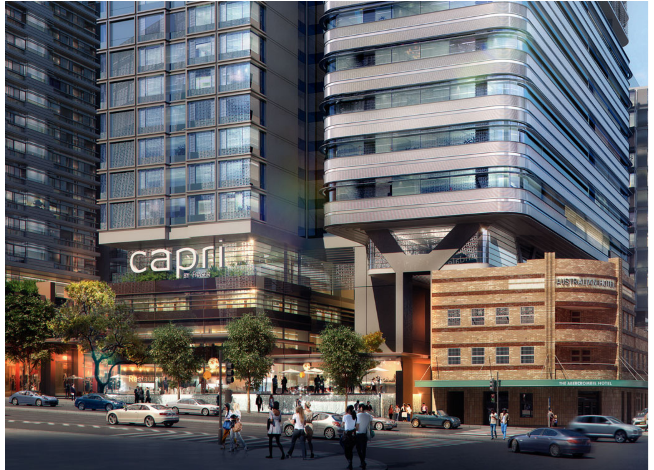
North West Corner Podium Façade - with Commercial Entrance on Broadway

The podium elevations are articulated up with strong horizontal lines formed by deep lateral fins that echo the horizontal emphasis of the Australian Hotel facades.