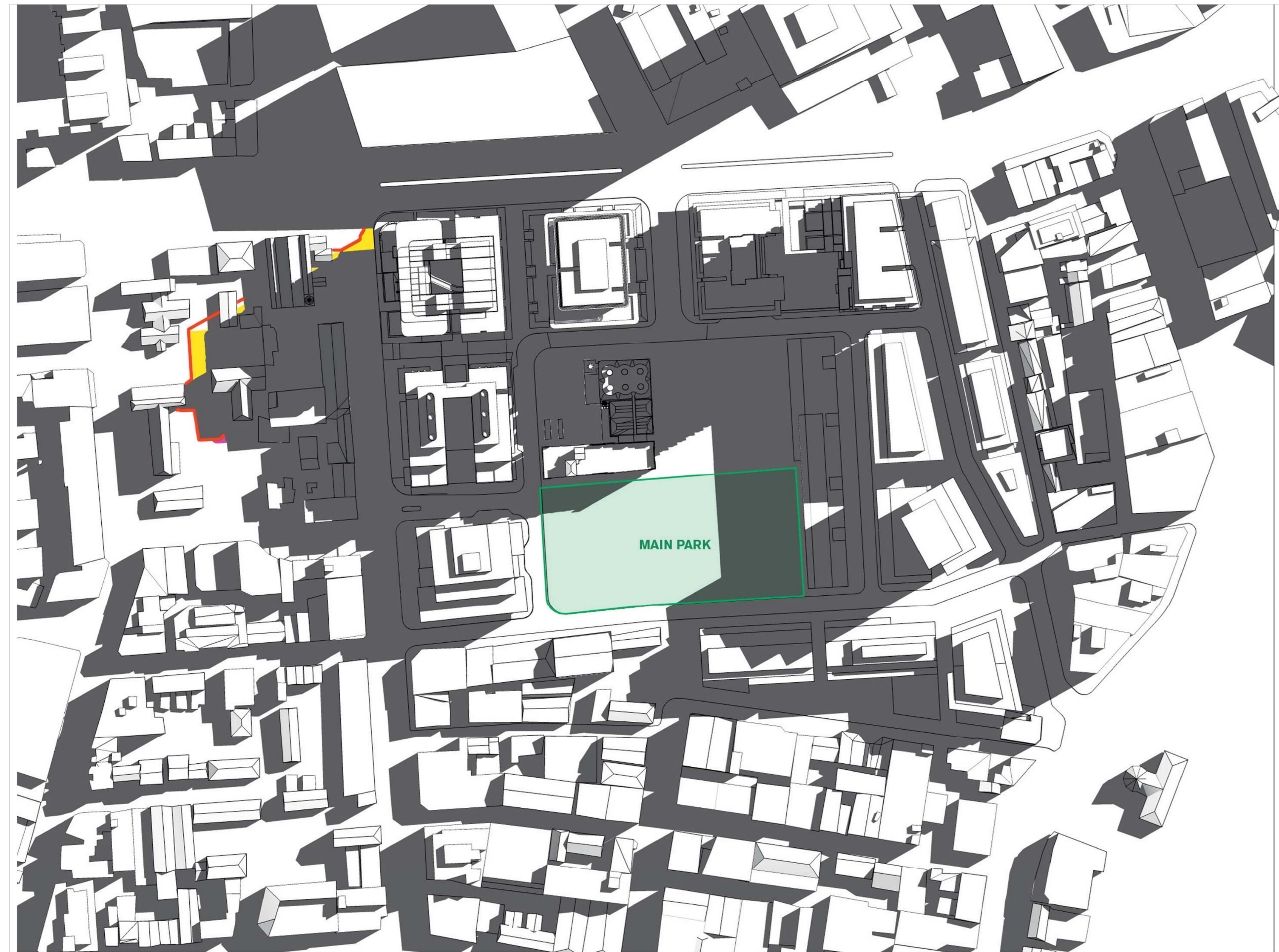
03 22 March 9:00 AM