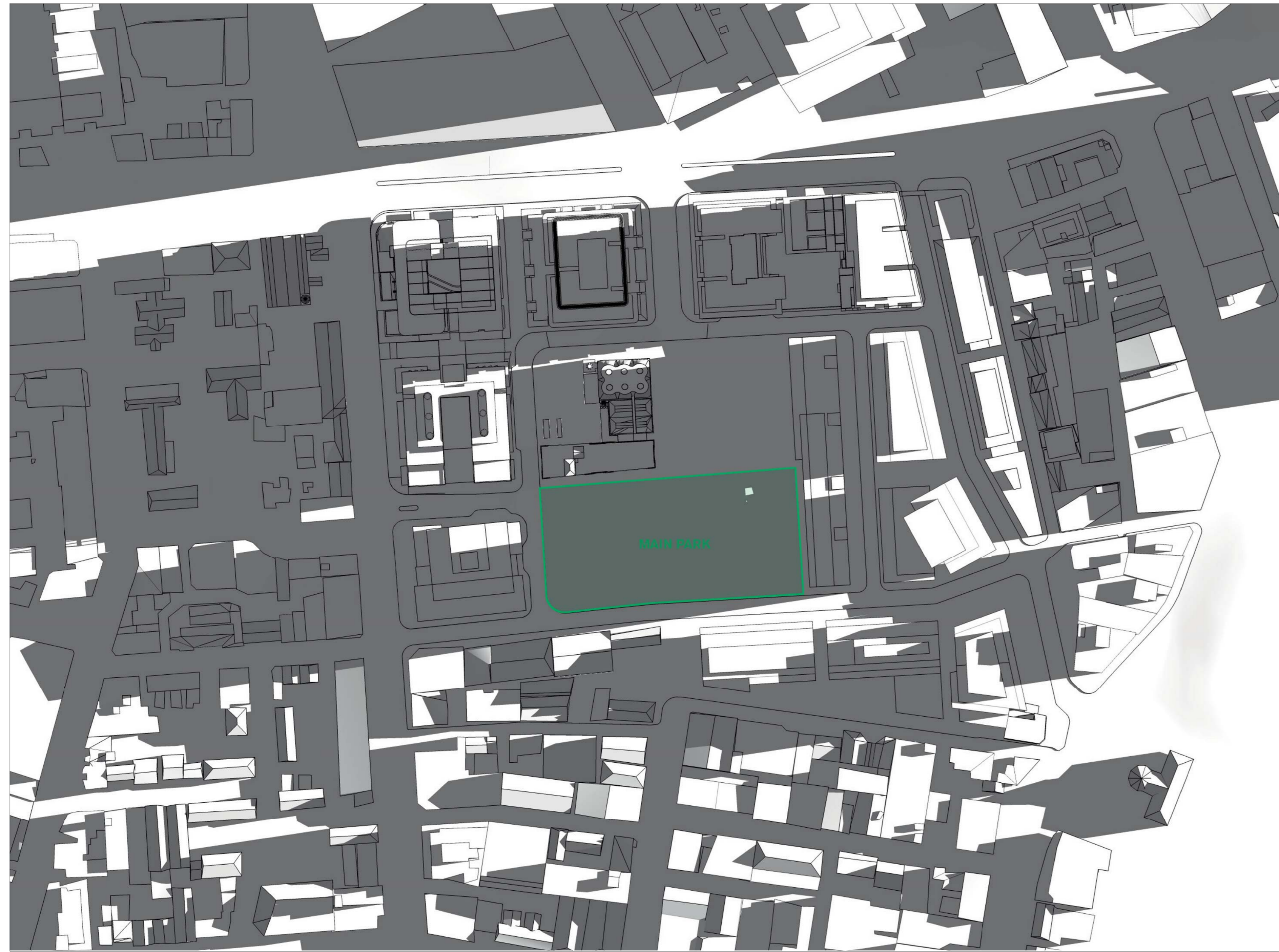
01 22 March 07:00 AM