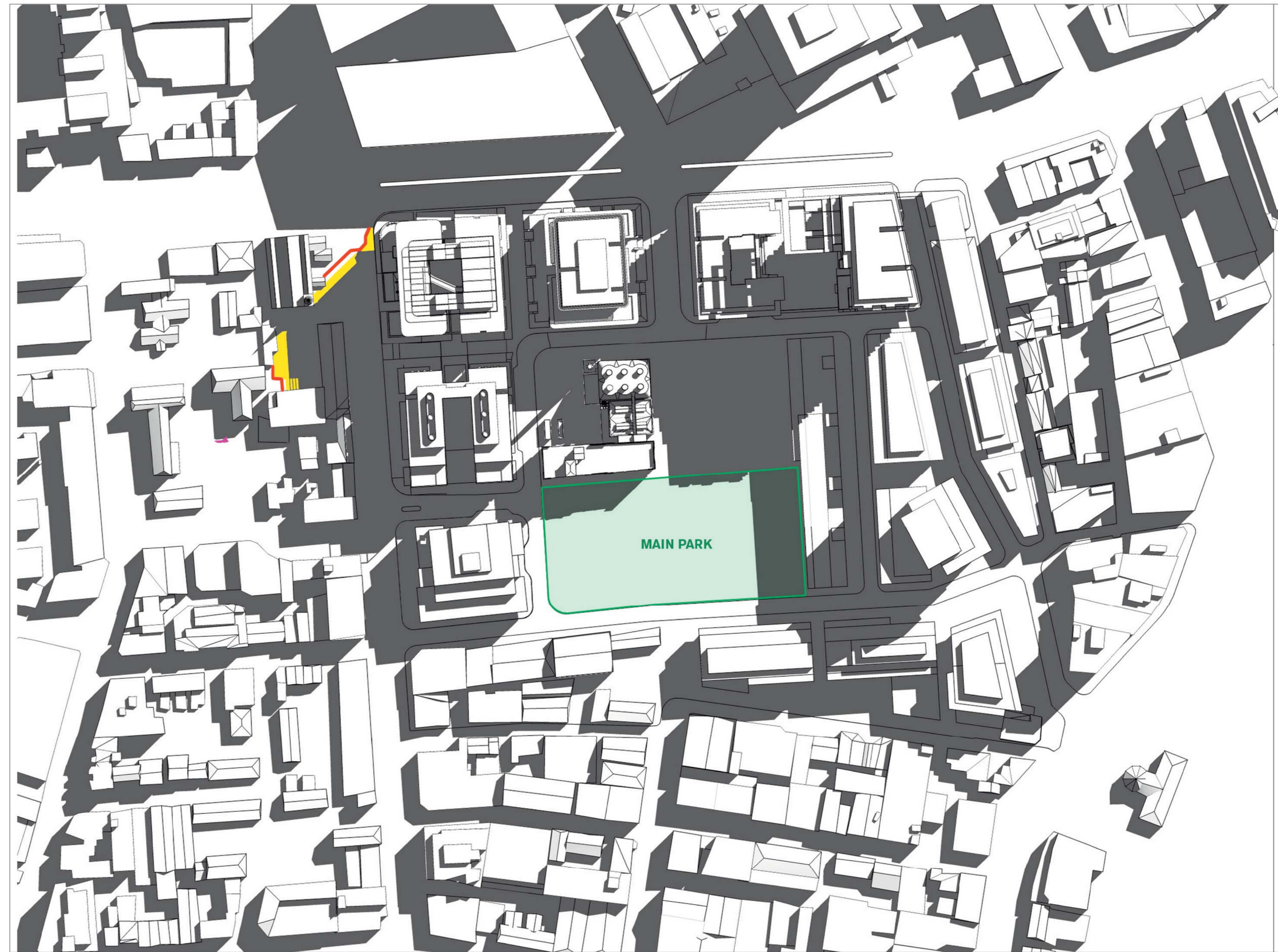
04 22 March 10:00 AM