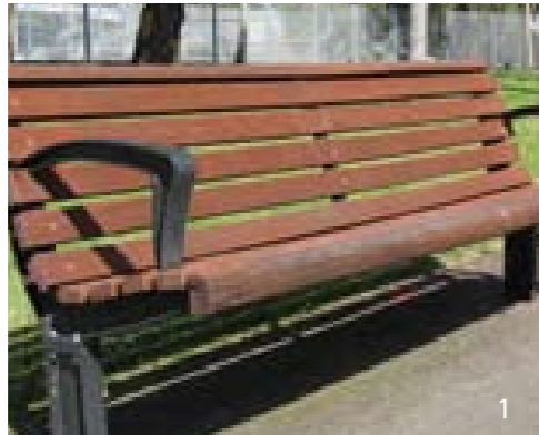
UDEM Free standing bench seat with armrest 2000mm x 450mm Cast aluminium frame and armrest as raw finish with recycled hardwood or plantation timber