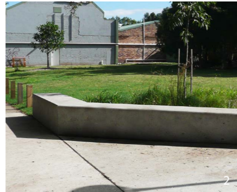
Concrete bench seat