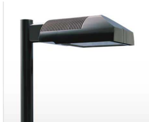
UDEM Light type L8d with luminaire type Le Kim pedestrian light