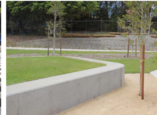
Concrete retaining wall & Decomposed granite gravel