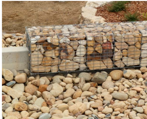
Gabion Clad Wall