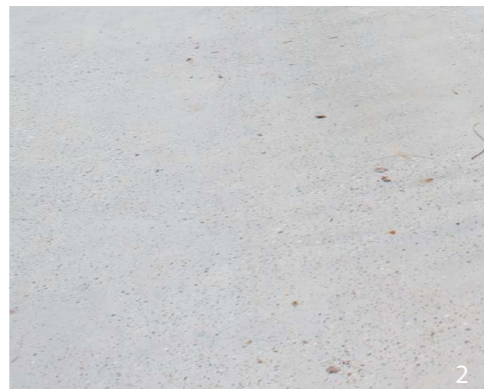
Insitu Concrete Pavement Surface Finished: Light washed exposed aggregate