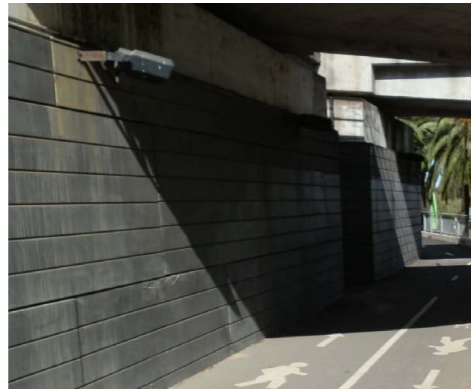
Precast concrete cladding to match existing