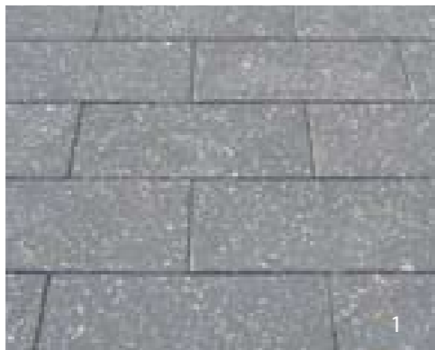
Havenslab 60mm Size: 400x200x60mm: Ebony Golden Glaze aggregate, honed: