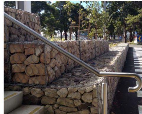
Standard Gabion Wall