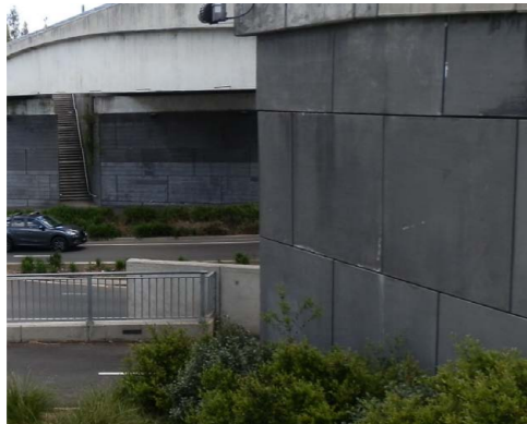
Precast concrete cladding coloured grey to match existing