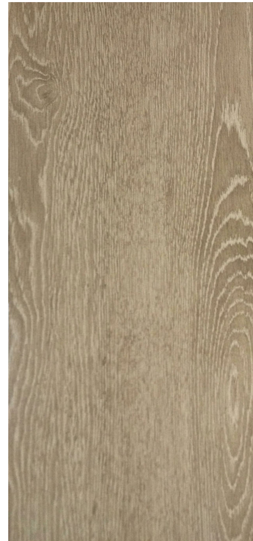
CD:01 PREFINISHED TILE