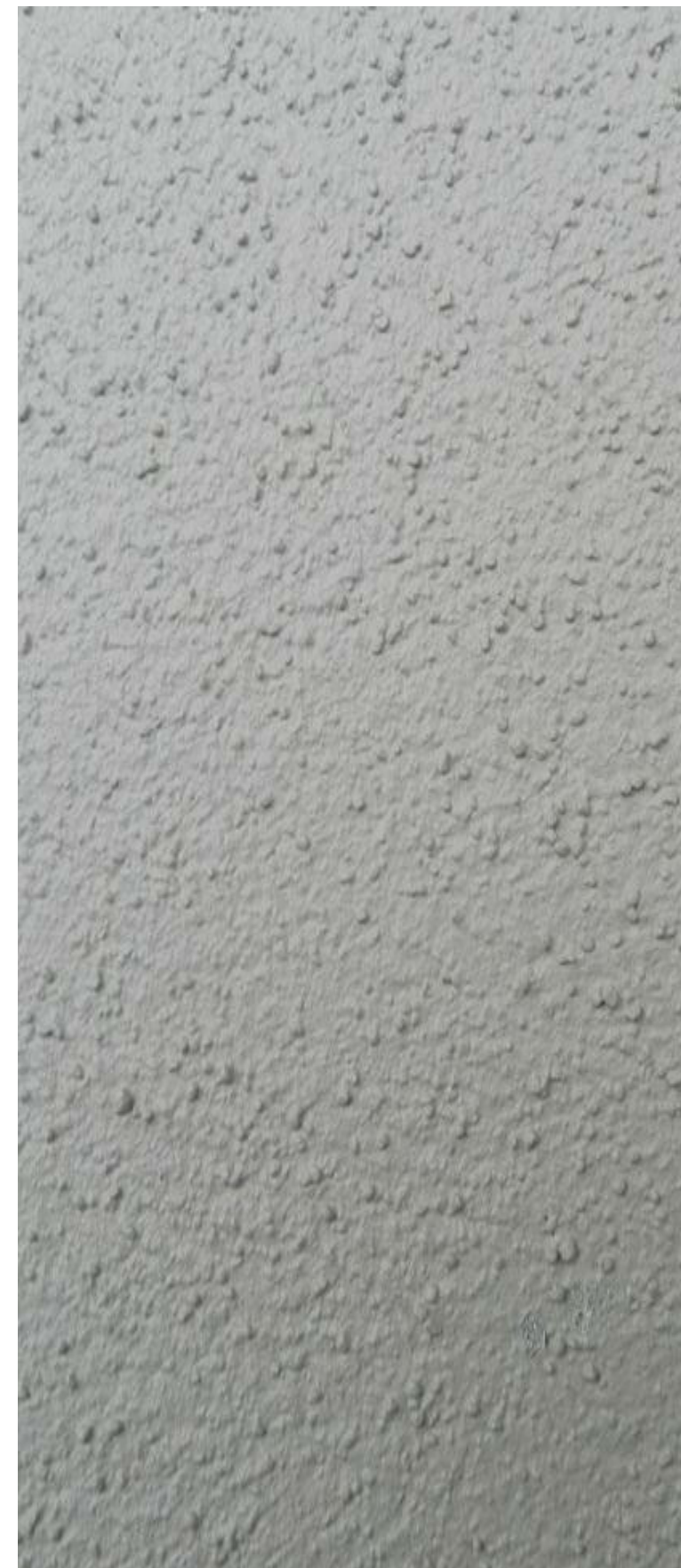
BK:01 RENDERED BLOCKWORK