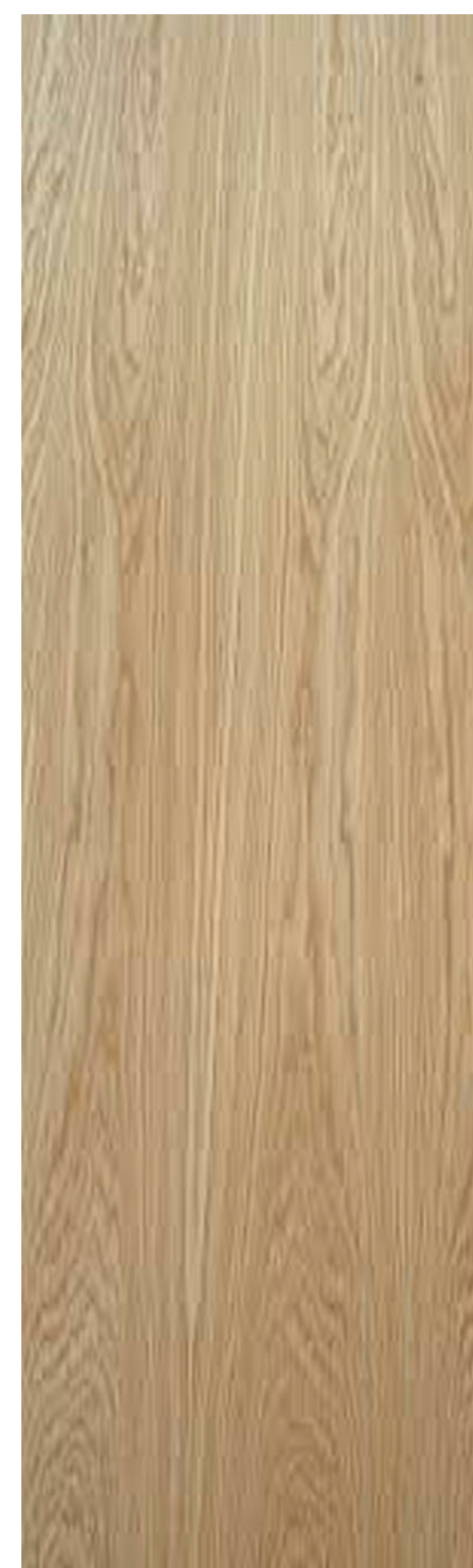
TE:01 TIMBER 'LOOK' ALUMINIUM FEATURE SCREEN