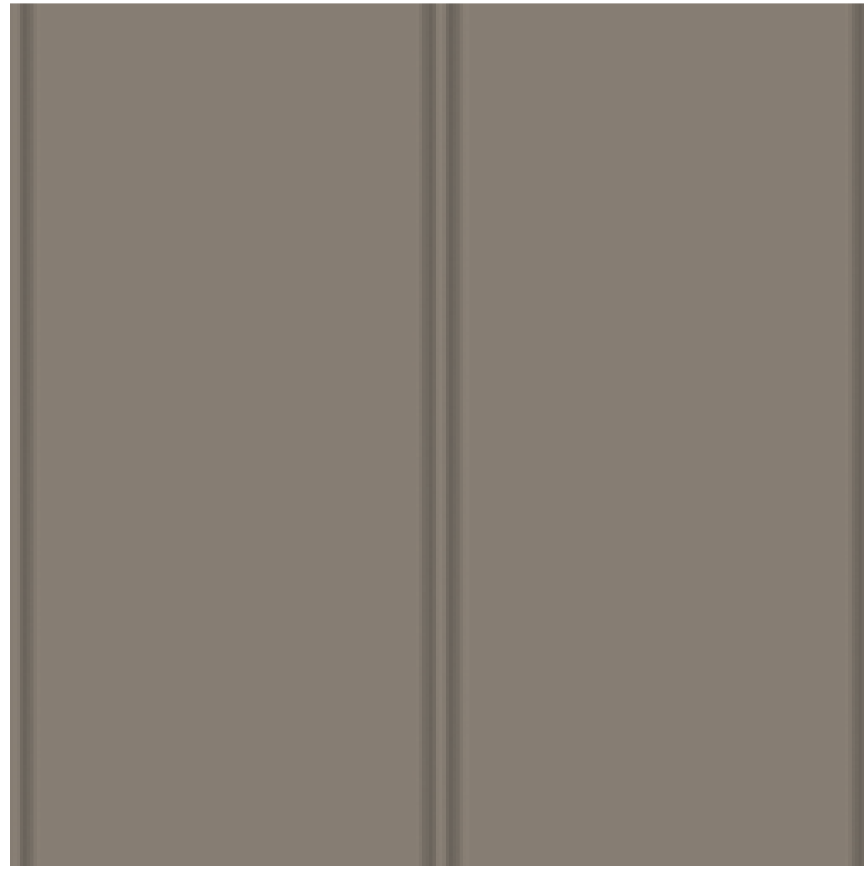
CD:02 PROFILED ROOF SHEET