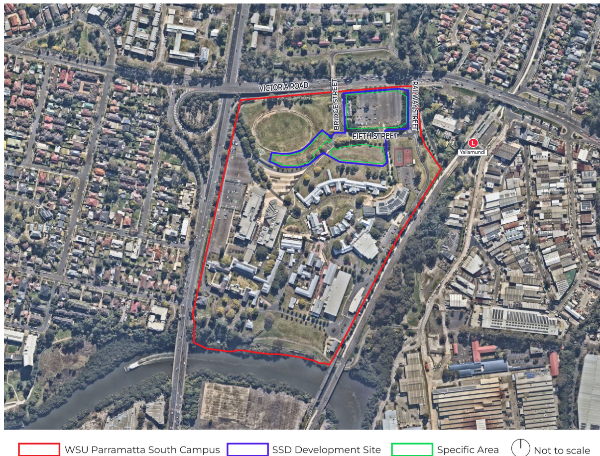
Figure 1 Western Sydney University Parramatta South Campus locational context

The site location and project boundary is identified in Figure 1 .