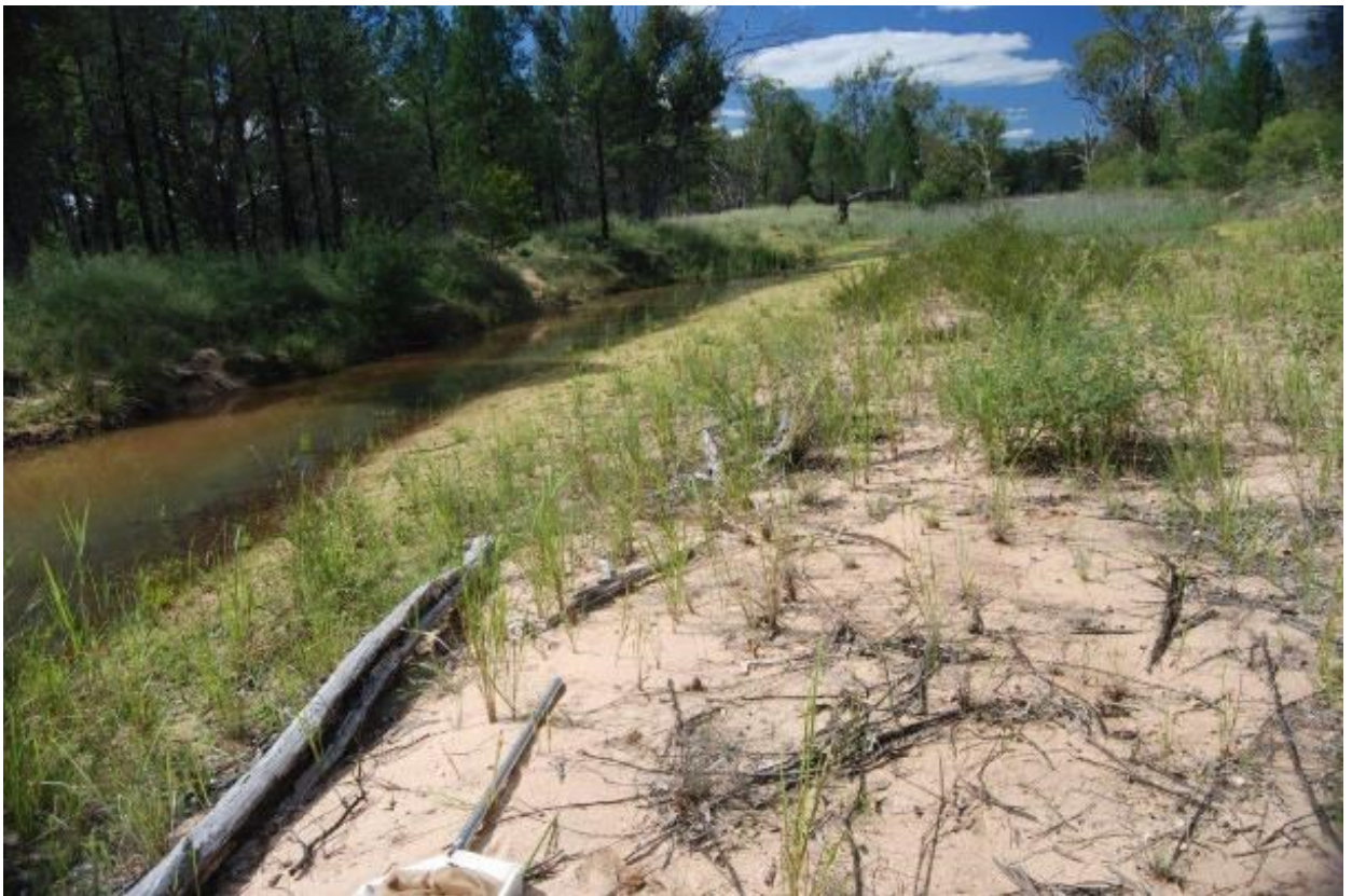
Figure 16-2 Bohena Creek downstream of the proposed release site – view looking downstream in autumn

Bohena Creek is a sand-bed ephemeral watercourse that flows north through the eastern Pilliga (refer to Figure 12-6 and Figure 12-7 in Chapter 12 – Surface water quality), and is the major watercourse within the project area. Bohena Creek is dry for extended periods of time although there are deeper intermittent pools that contain permanent water (refer to Figure 16-2).