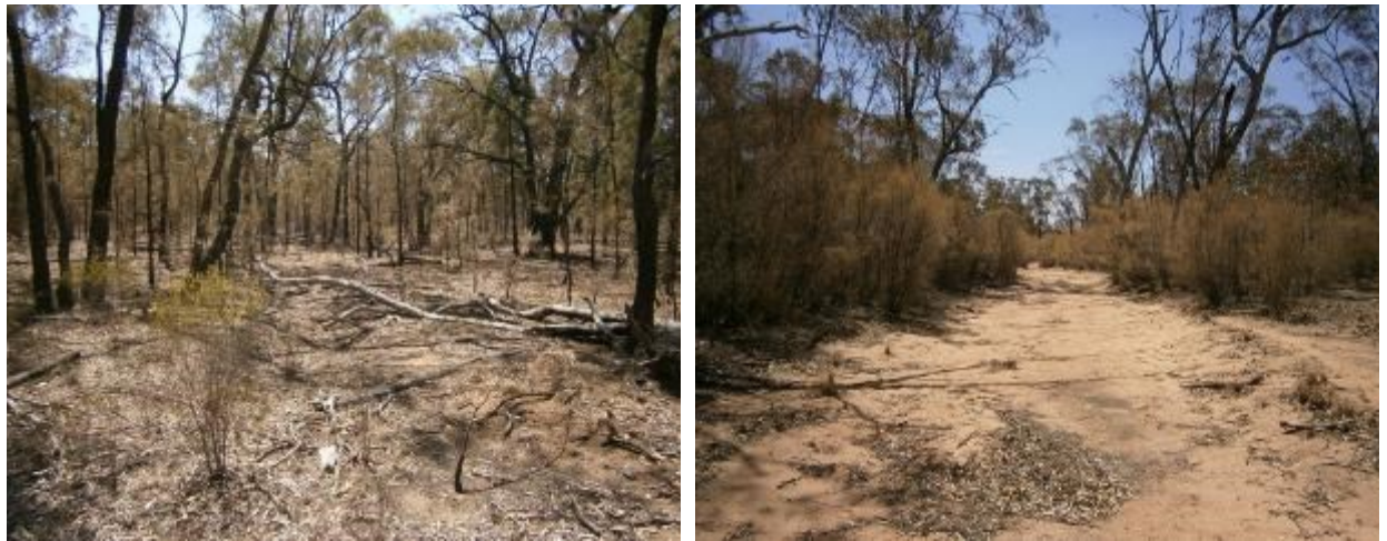
Figure 16-4 Examples of typical first (left) and third (right) order watercourses in the project area

Examples of first and third order watercourses in the project area are shown in Figure 16-4. Further details are provided in Chapter 13 and Appendix G1.