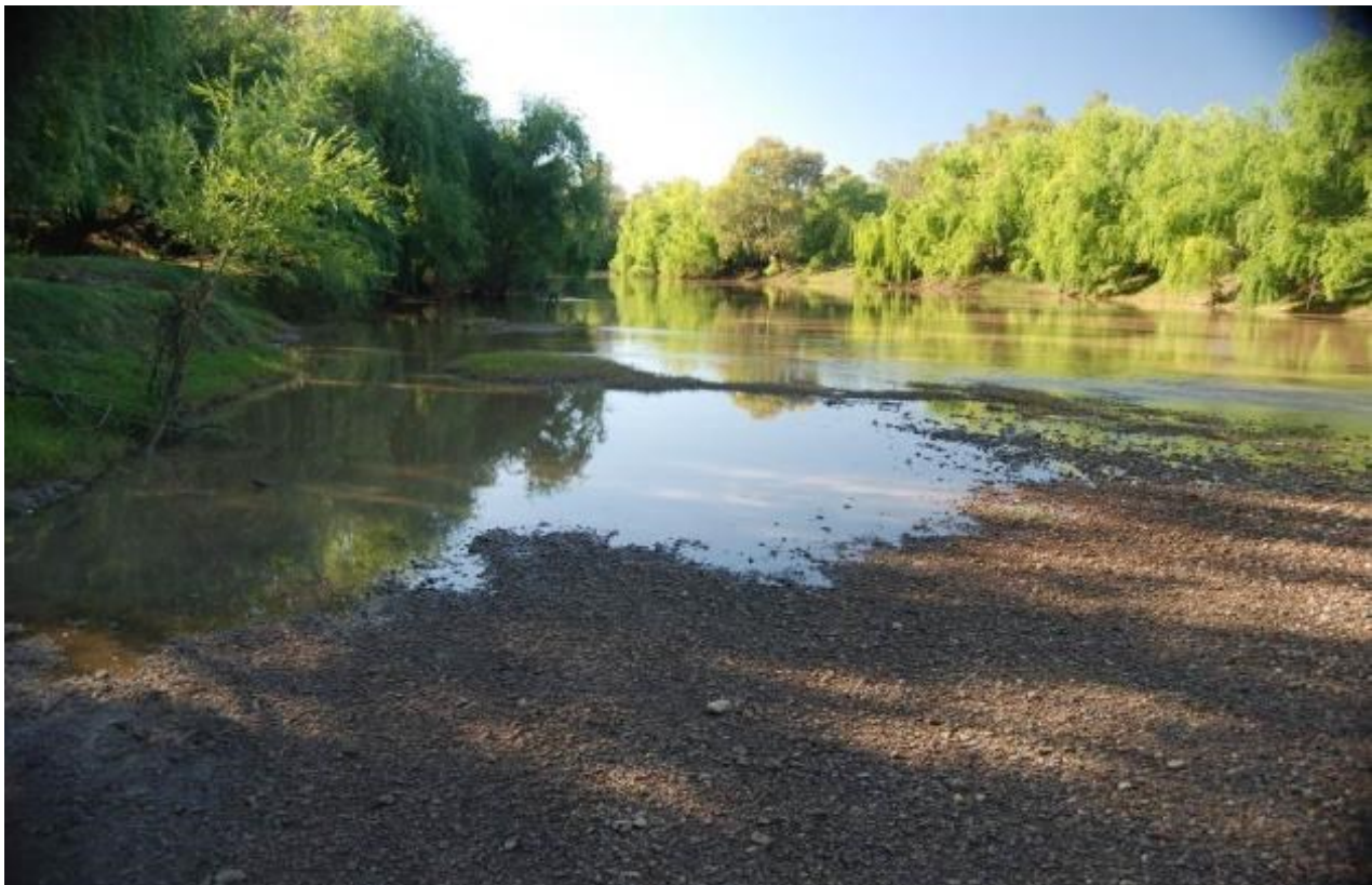
Figure 16-3 The Namoi River, downstream of Mollee Weir – view looking upstream in spring

The Namoi River and Narrabri Creek were once likely ephemeral and experienced periods of no flow. However, both now flow permanently due to regulated water releases from Keepit Dam located upstream (refer to Figure 16-3). Major tributaries in the study area include Bohena Creek, Bullawa Creek, Nuable Creek, Illaroo Creek, Pian Creek, Werah Creek, Brigalow Creek, Coxs Creek, Middle Creek, Sandy Creek, and Spring Creek. All of these are ephemeral watercourses that require significant rainfall to flow.