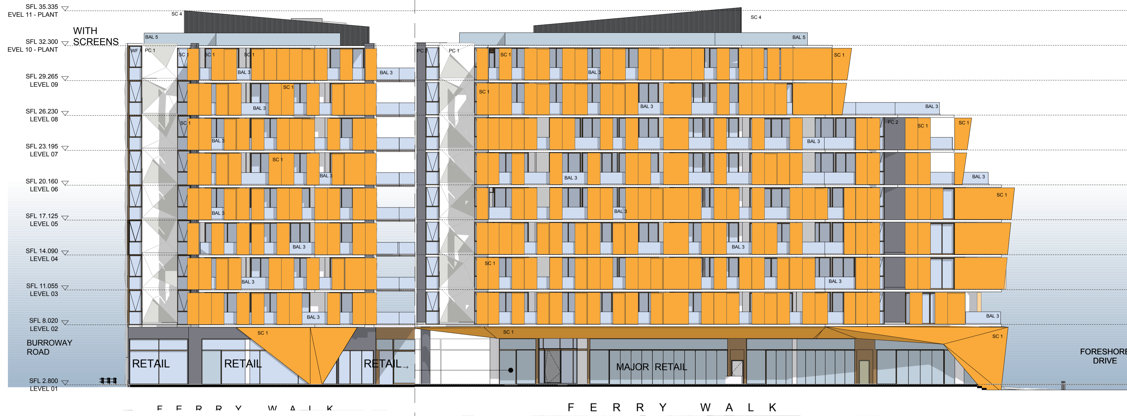
1 ELEVATION B1 - EAST ELEVATION 1:200