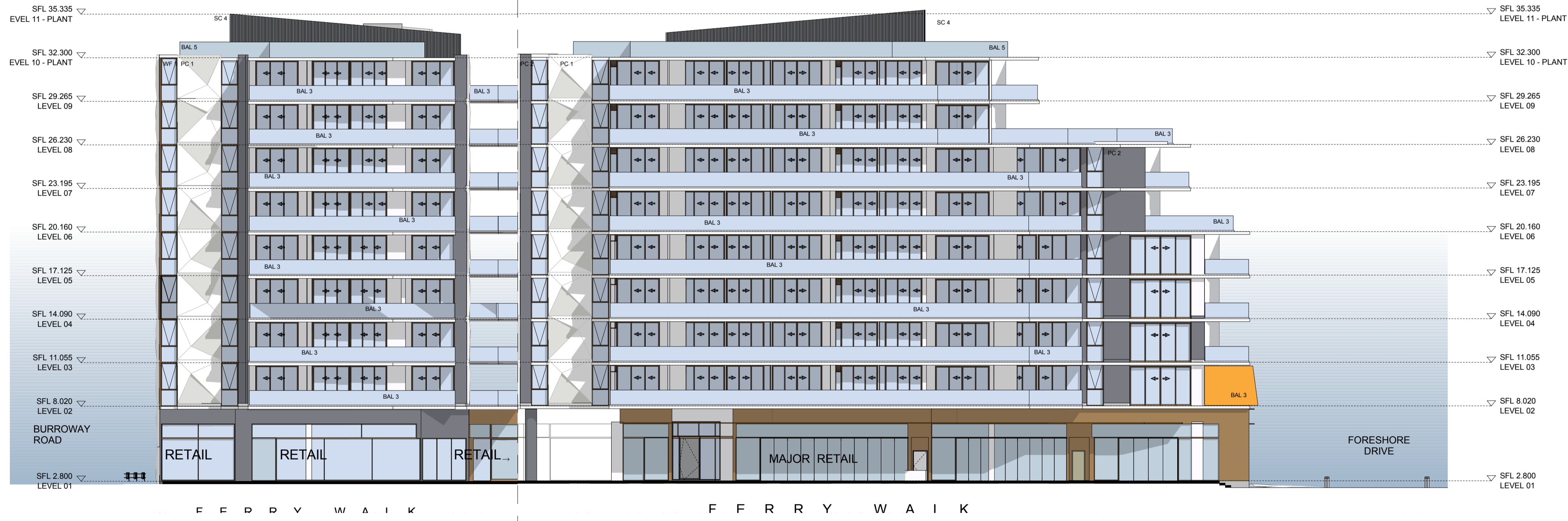
4 ELEVATION B1 - EAST ELEVATION 1:200