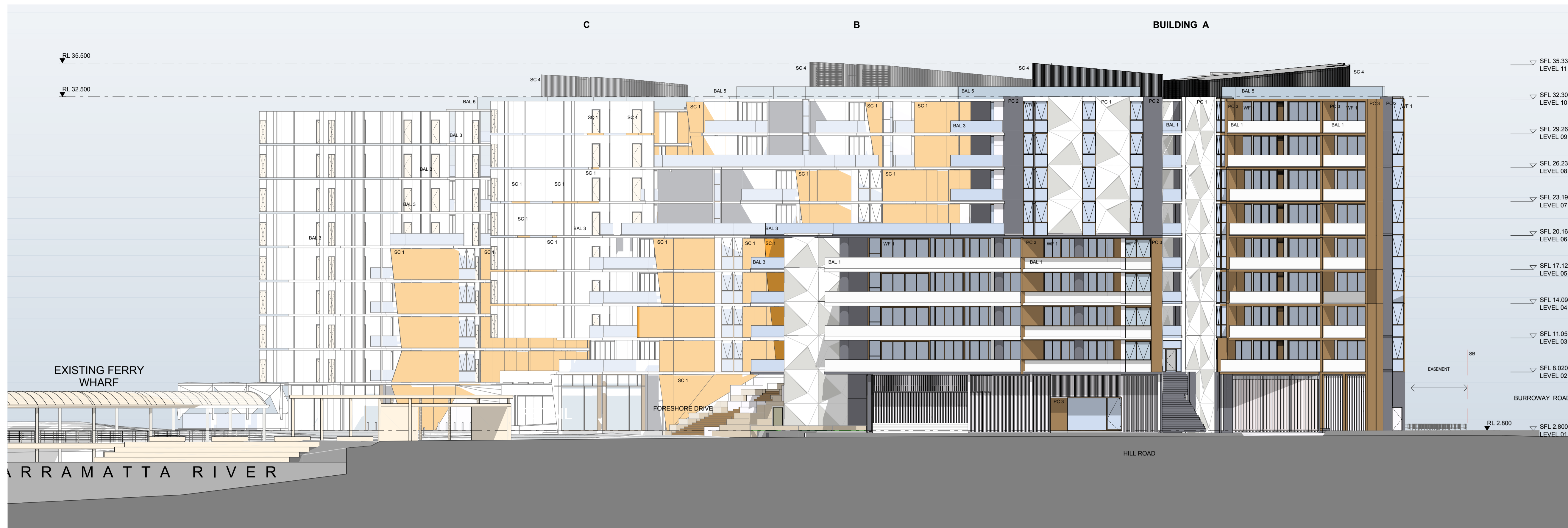
1 ELEVATION B-A WEST ELEVATION 1:200