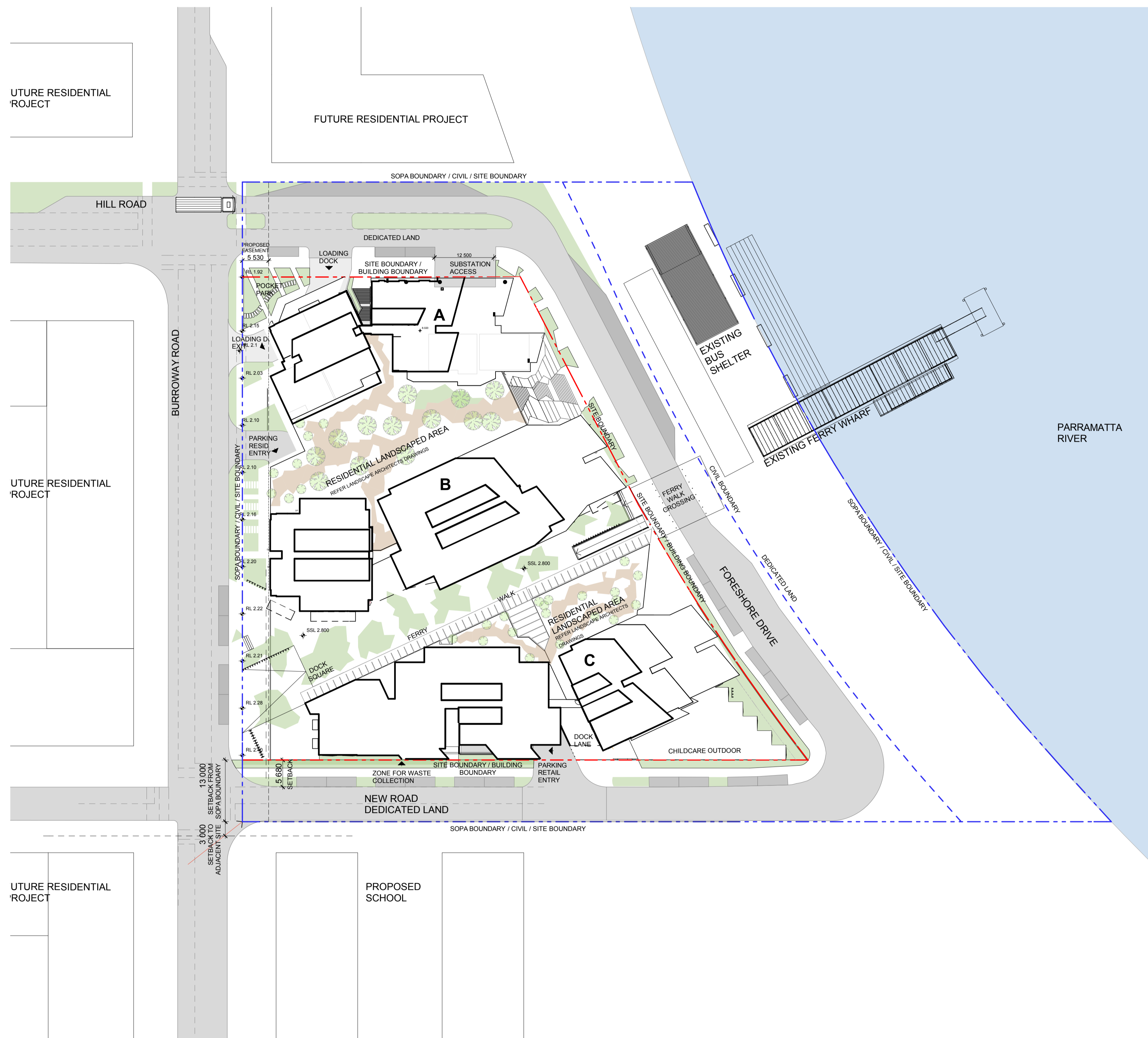
1 PLAN LEVEL 01 SITE PLAN 1:500