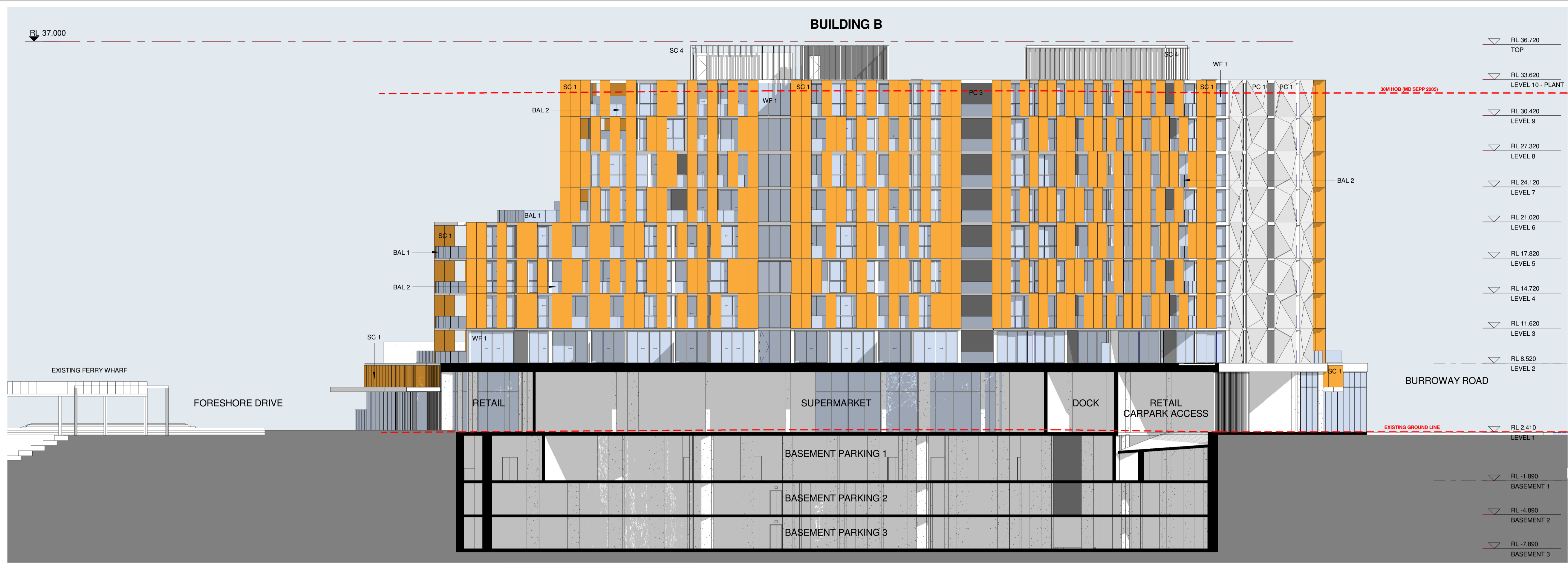
1 ELEVATION B1-B2 WEST ELEVATION 1 : 200