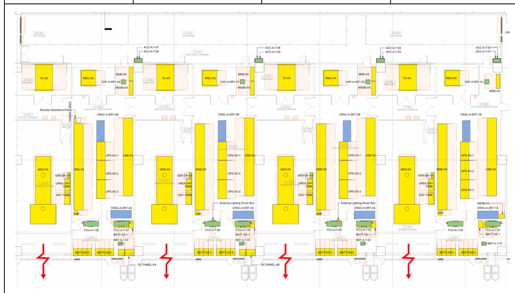
Figure 2 Typical Electrical Plantroom Arrangements