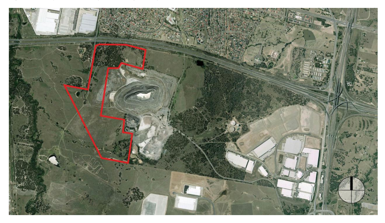
Figure 1.2 Aerial photograph of the study area.