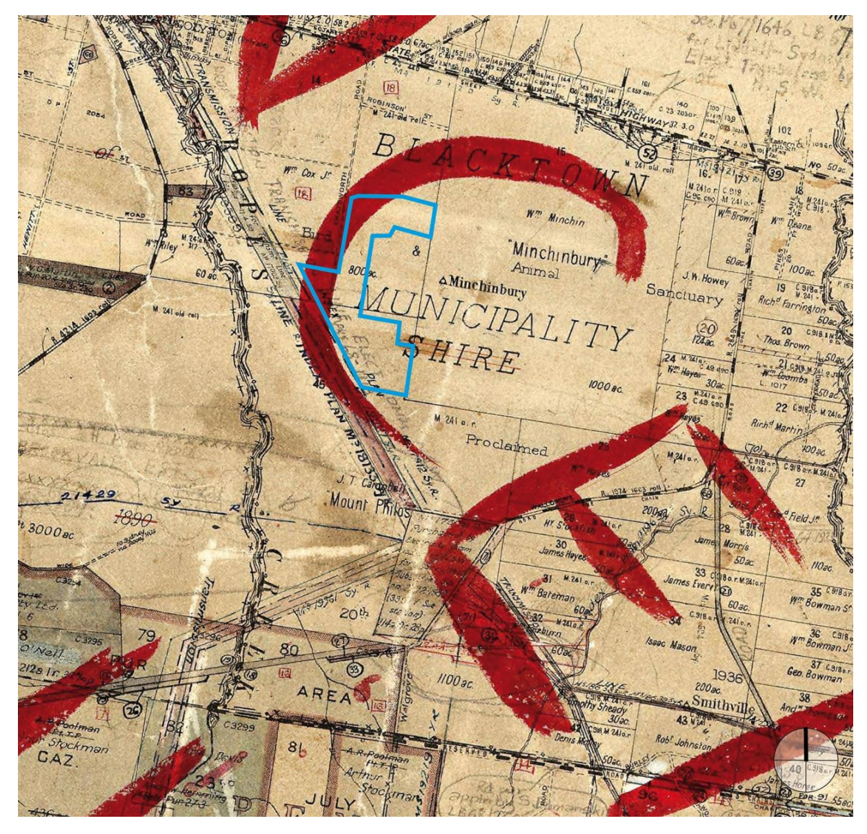
Figure 2.3 1938 Melville Parish Map showing the location of the study area in relation to later easements and developments.