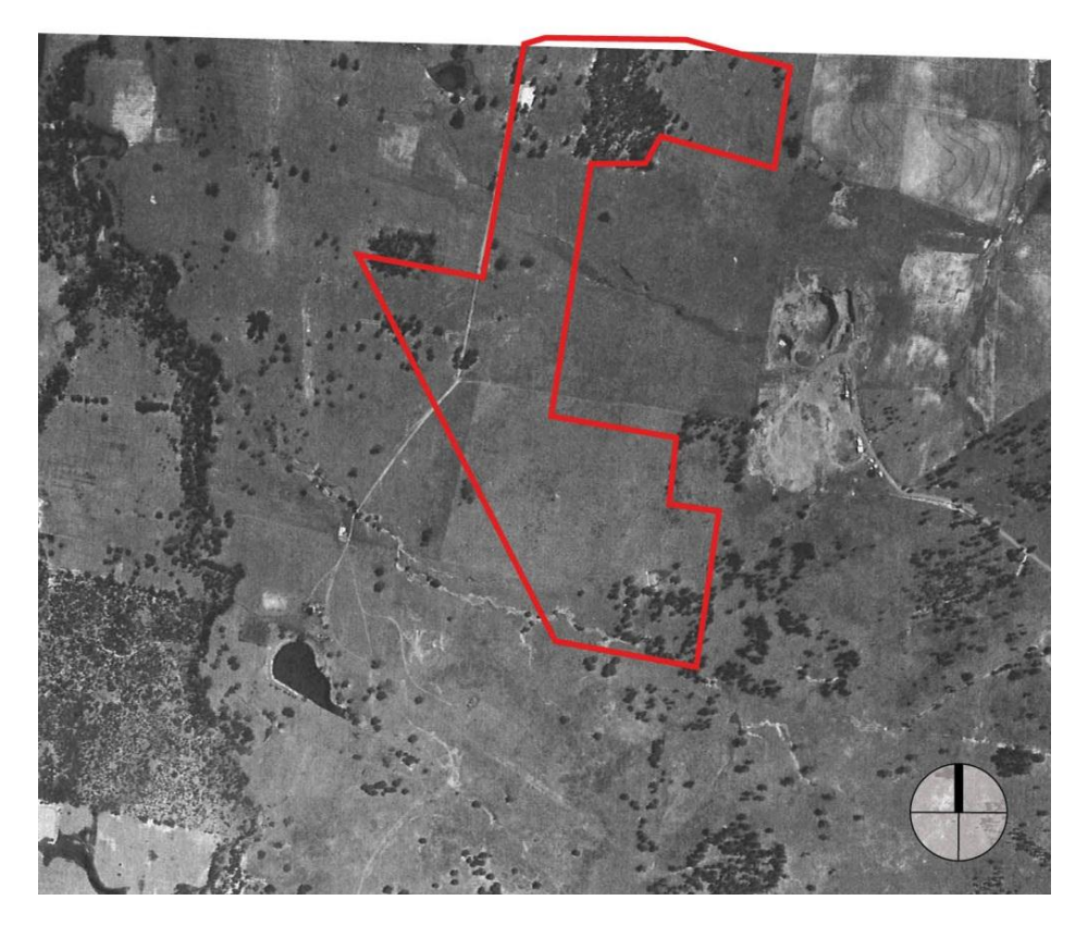
Figure 2.5 Aerial photograph of the study area in 1956.