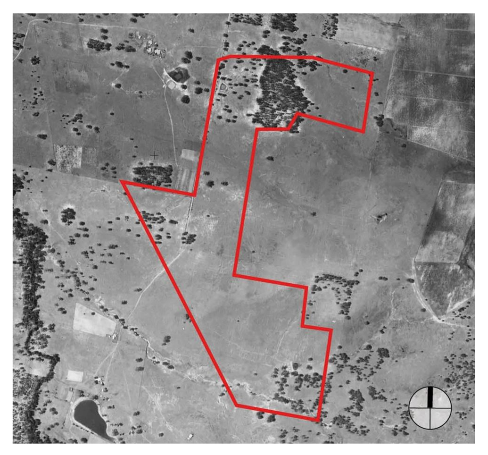
Figure 2.4 Aerial photograph of the study area in 1947.