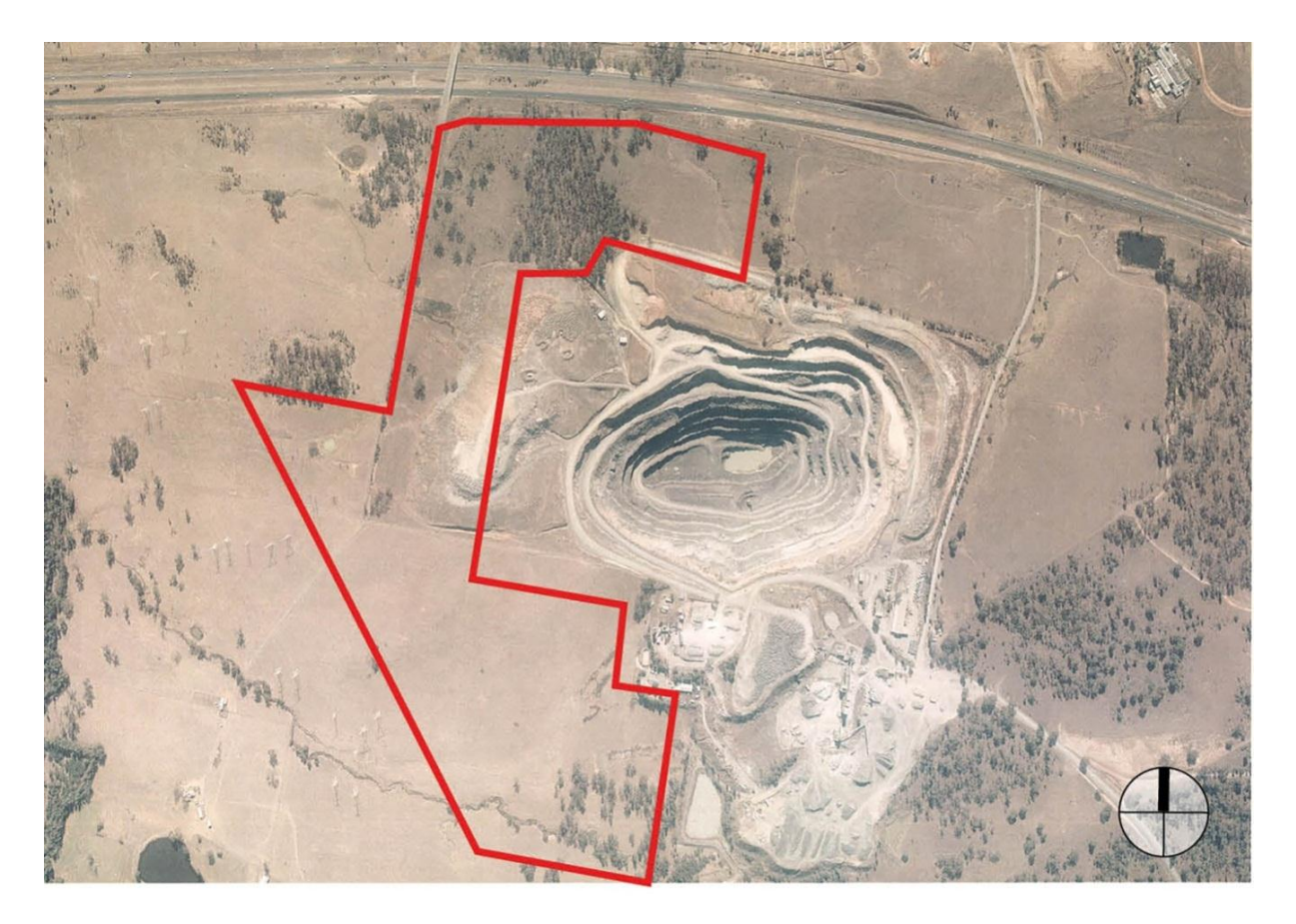
Figure 2.7 Aerial photograph of the study area in 1986.