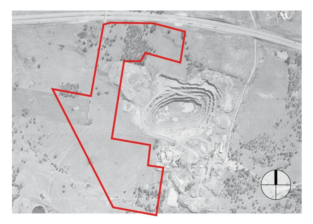
Figure 2.6 Aerial photograph of the study area in 1978.