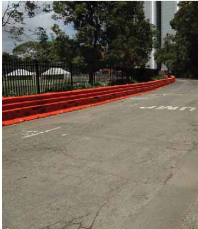
Photo 15 - Road running in front of JD Stewart Building