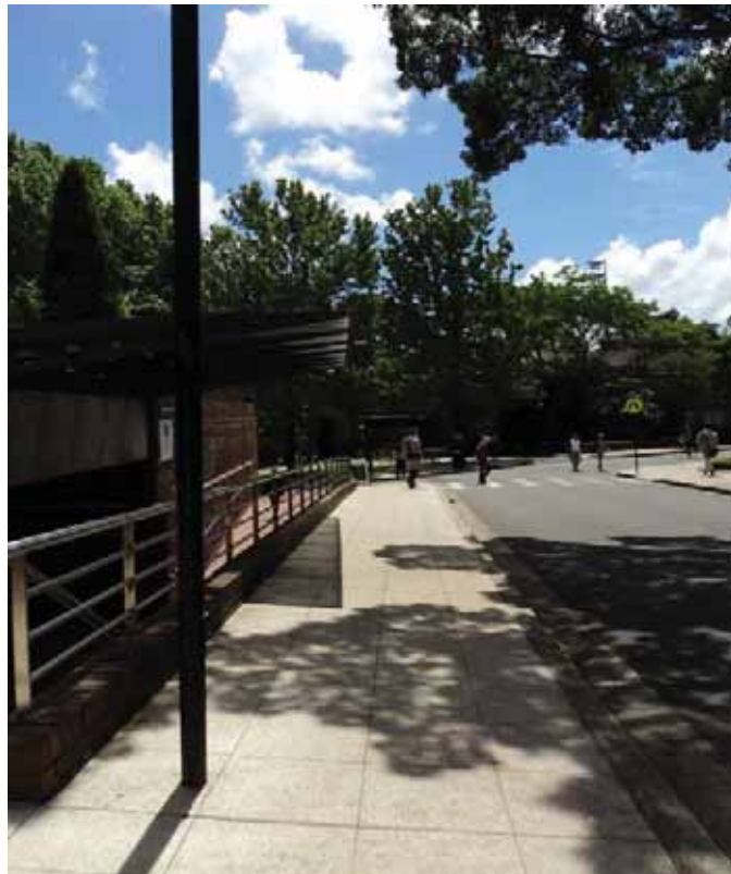
Photo 14 - Front of Bosch Building