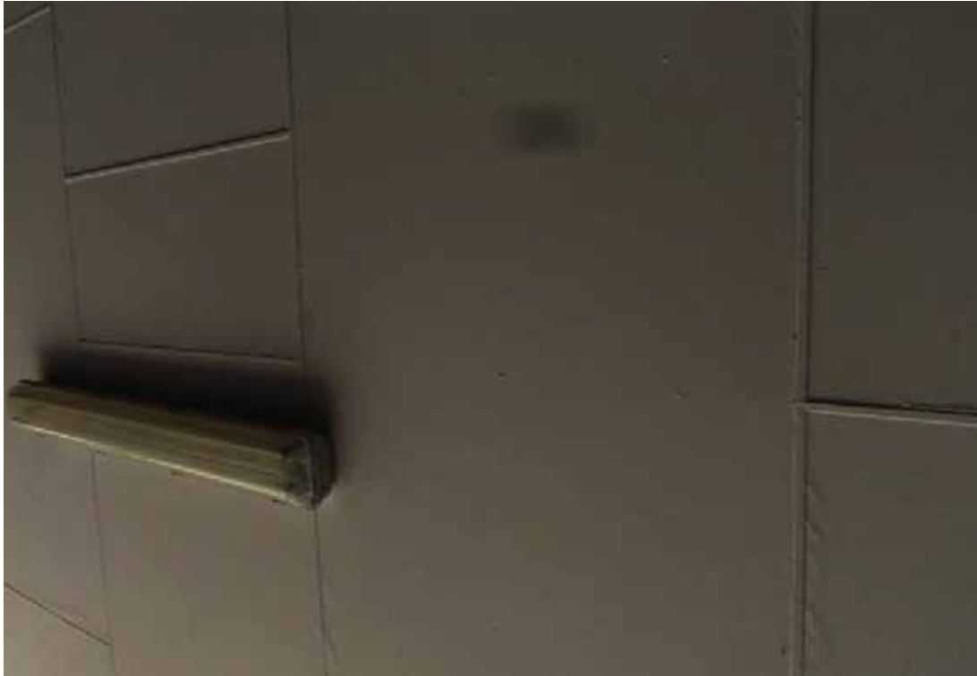
Photo 3 - Ceiling in Merewether Building