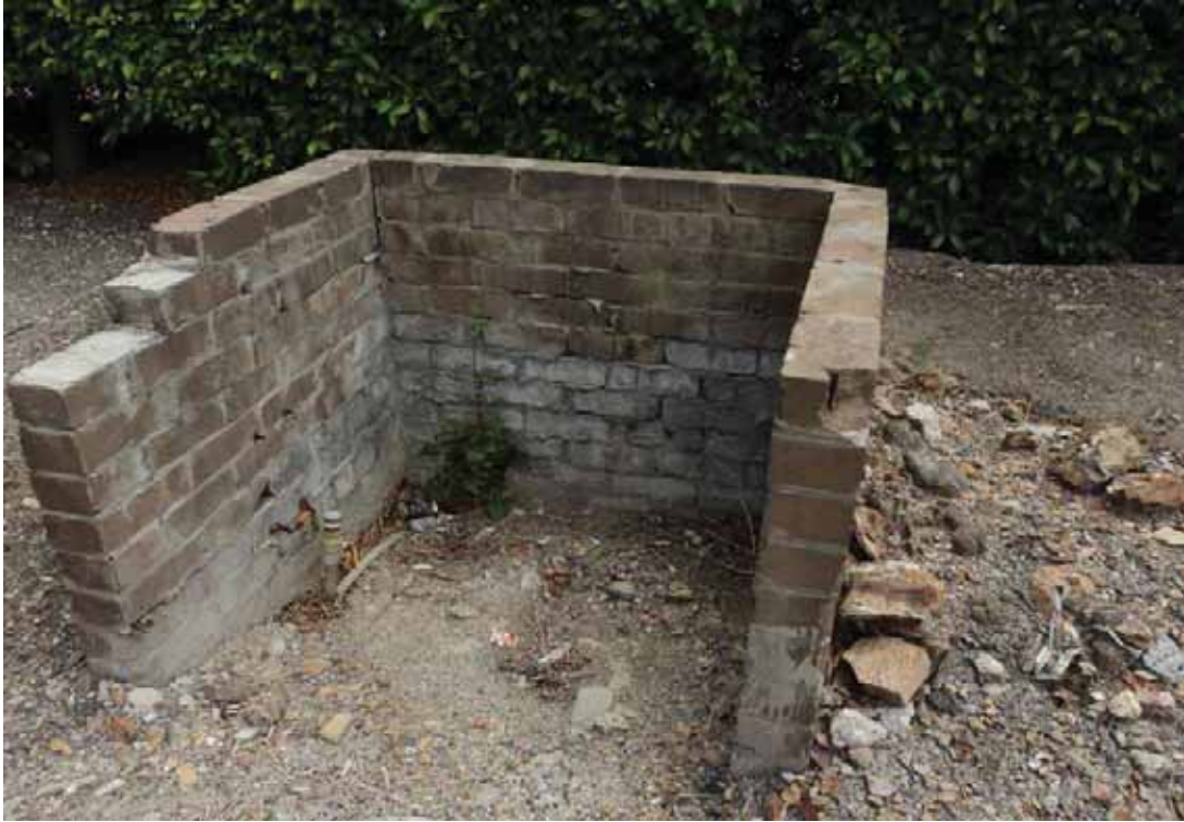
Photo 19 - Fill behind demountable buildings