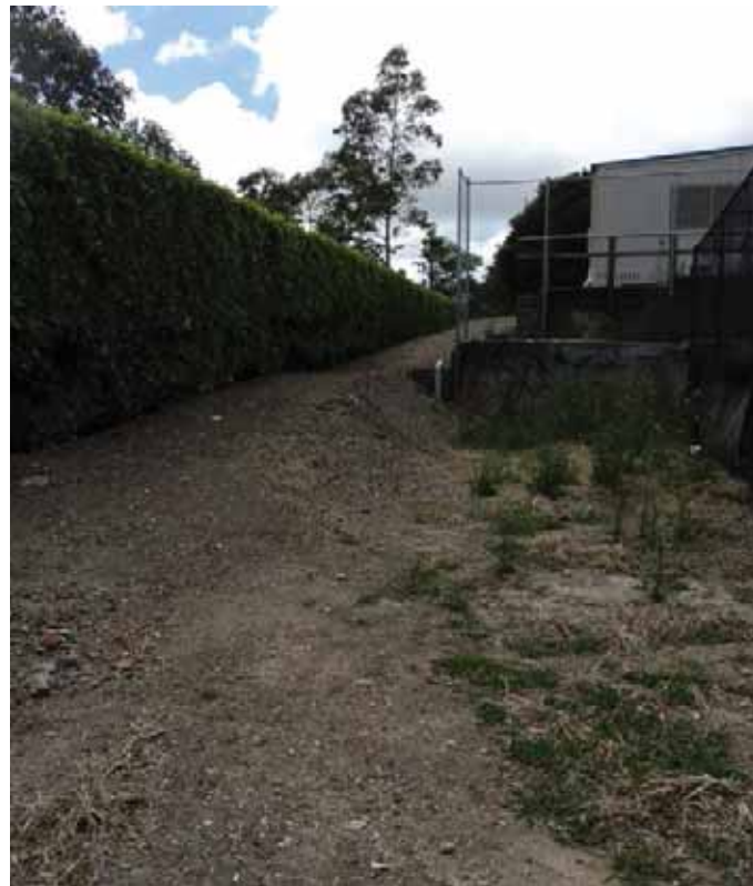
Photo 18 - Fill behind demountable Buildings