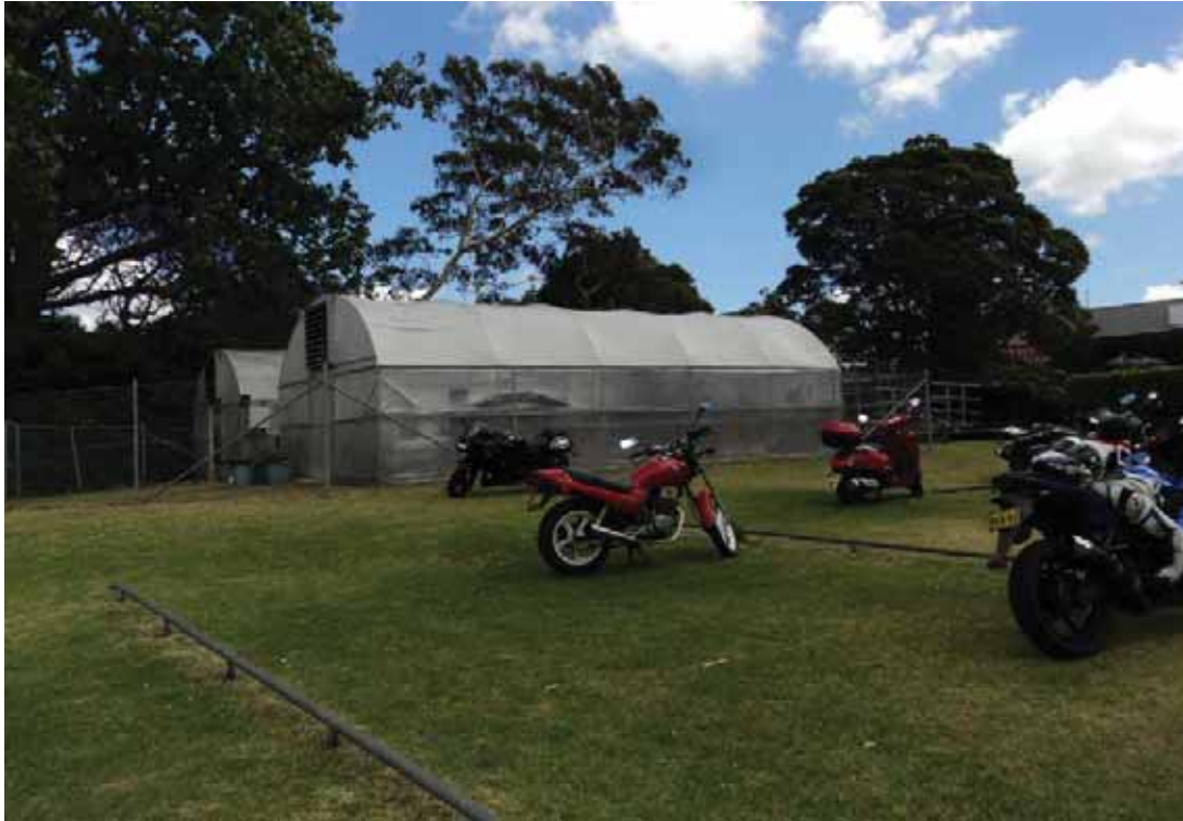
Photo 17 - Glass houses near Parramatta Road