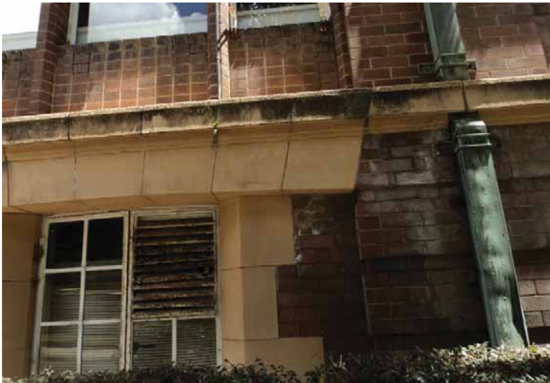
Photo 12 - External Facade Blackburn Building