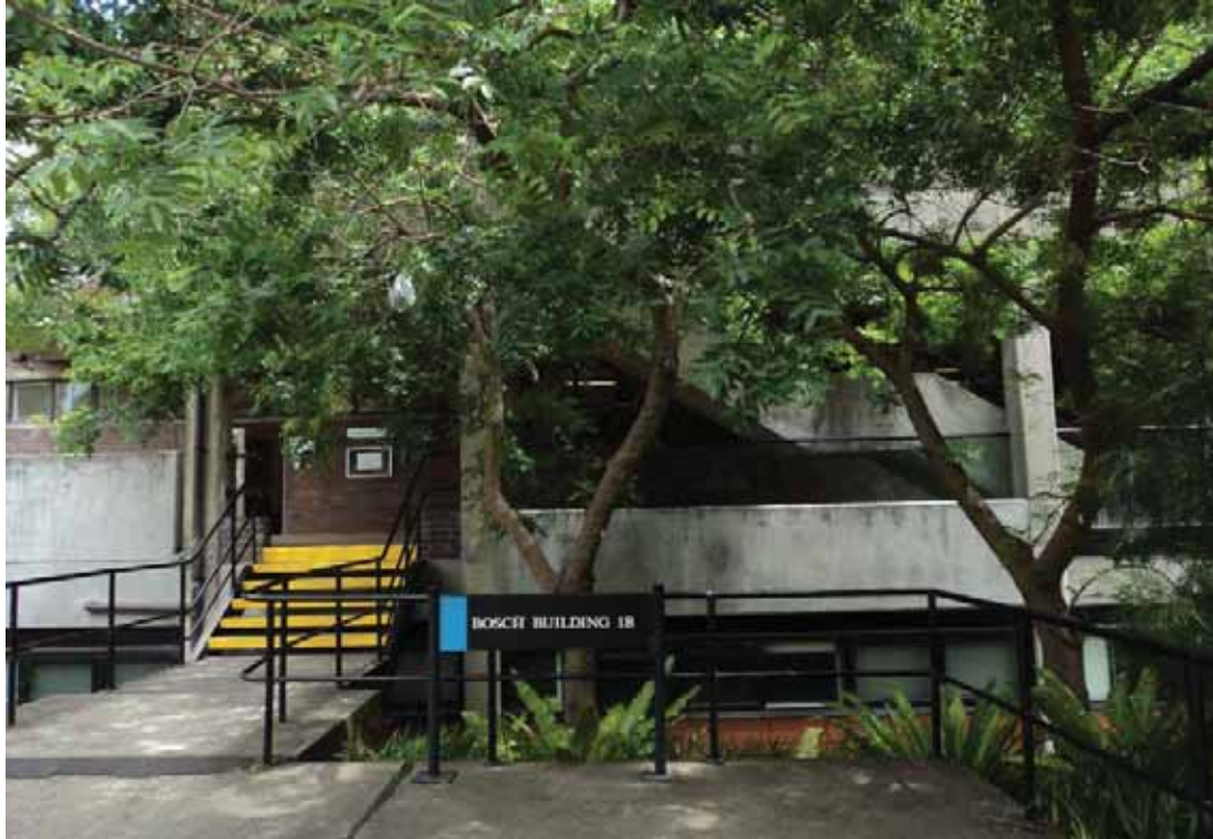
Photo 13 - Back of Bosch Building