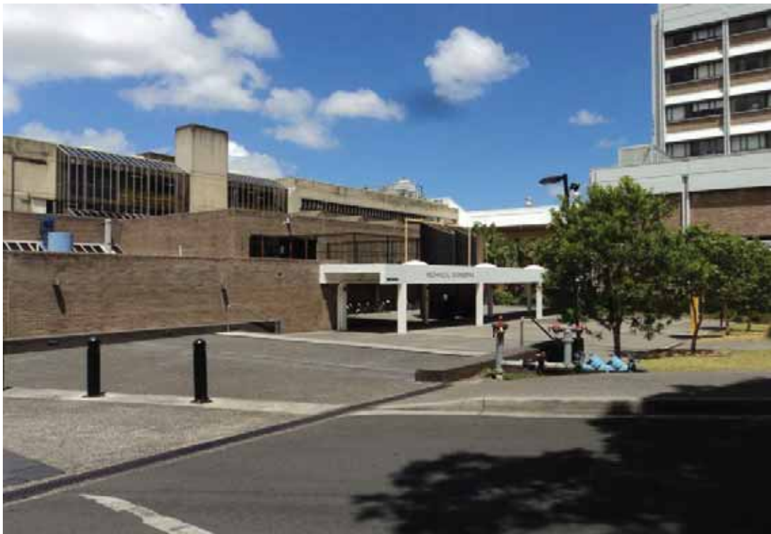
Photo 6 - Mechanical Engineering Building