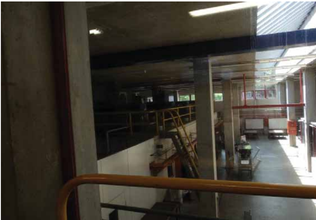
Photo 8 - Engineering Workshop