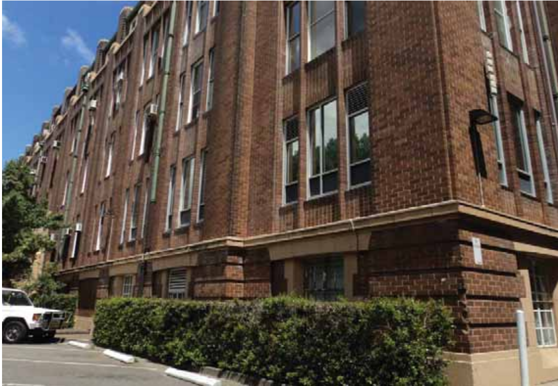
Photo 9 - Exterior of Blackburn Building