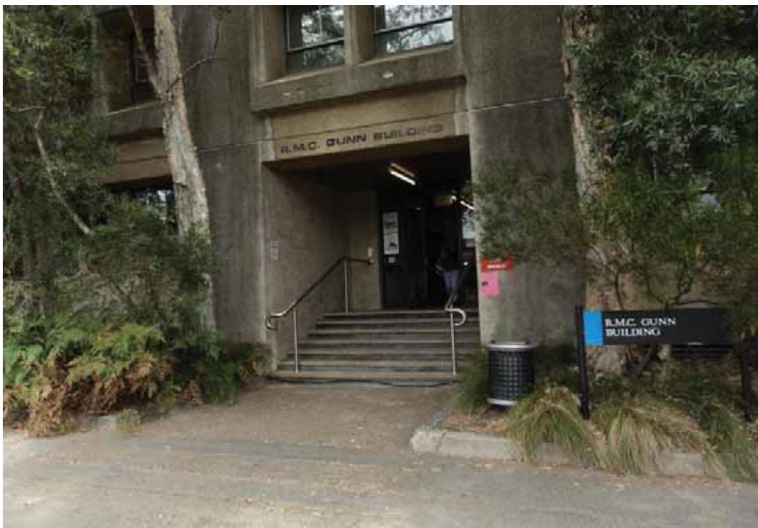
Photo 16 - RMC Gunn Building