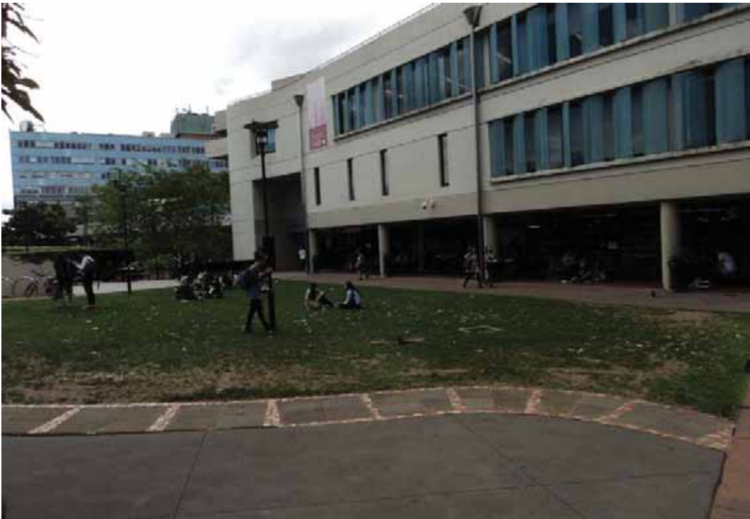
Photo 4 - Wentworth Building