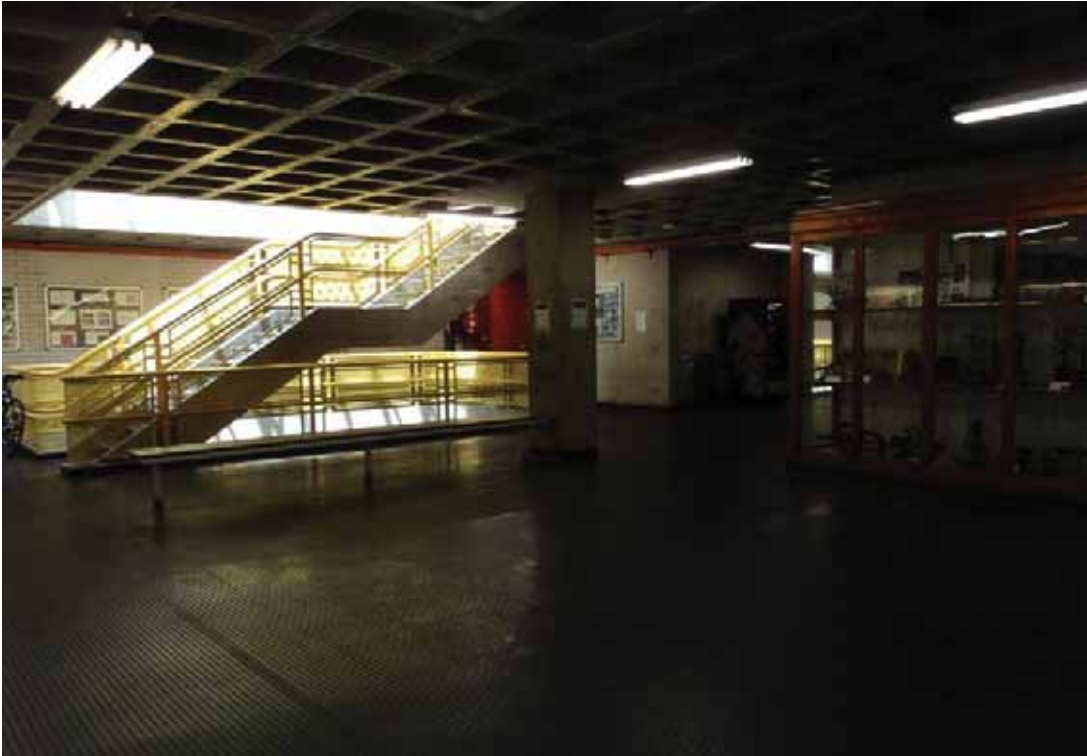
Photo 7 - Inside the Mechanical Engineering Building