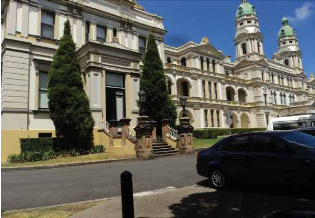
Photo 1 - Institute Building