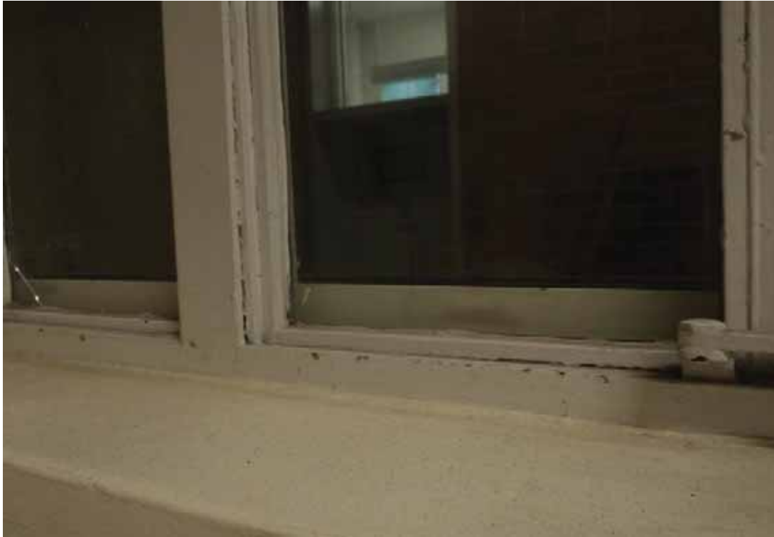
Photo 11 - Internal Window Paint Blackburn Building