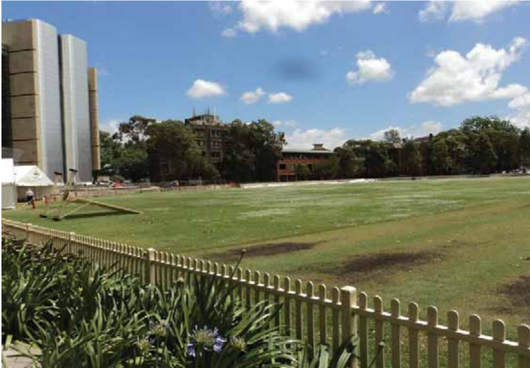
Photo 23 - Oval 2