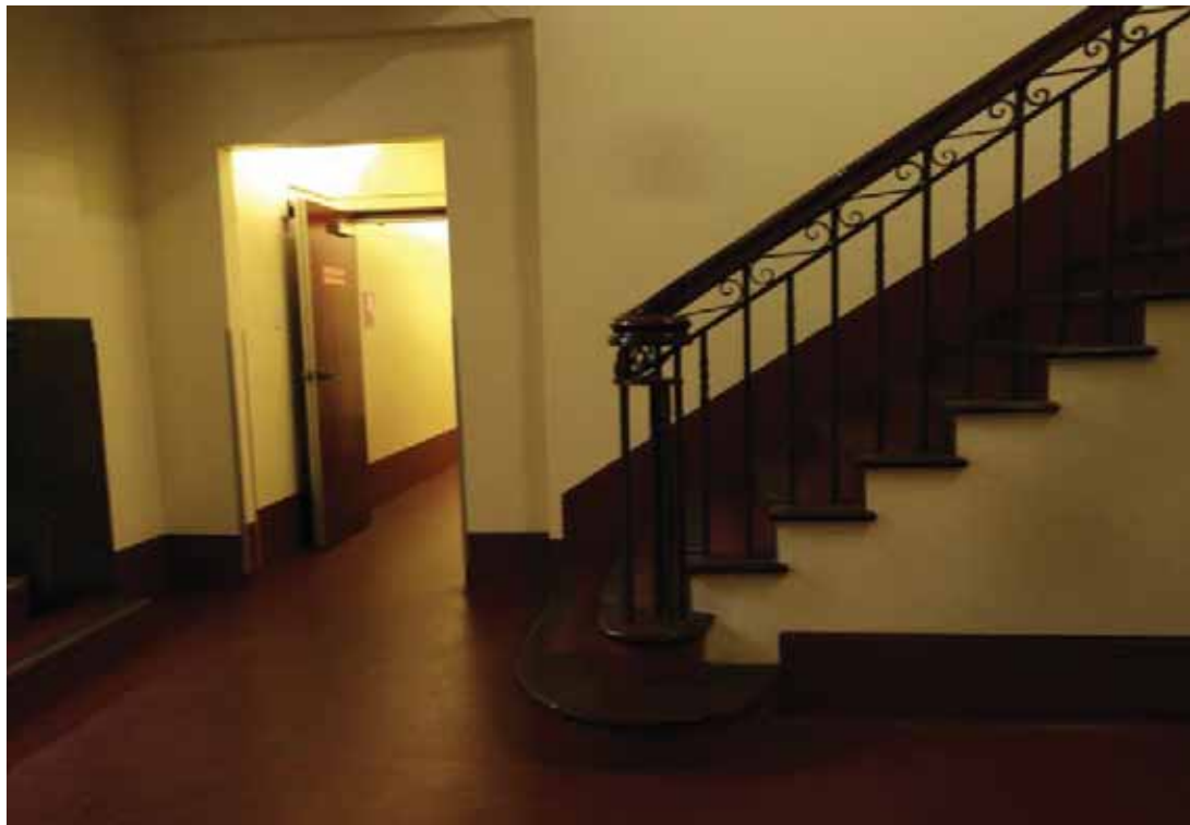
Photo 10 - Interior of Blackburn Building