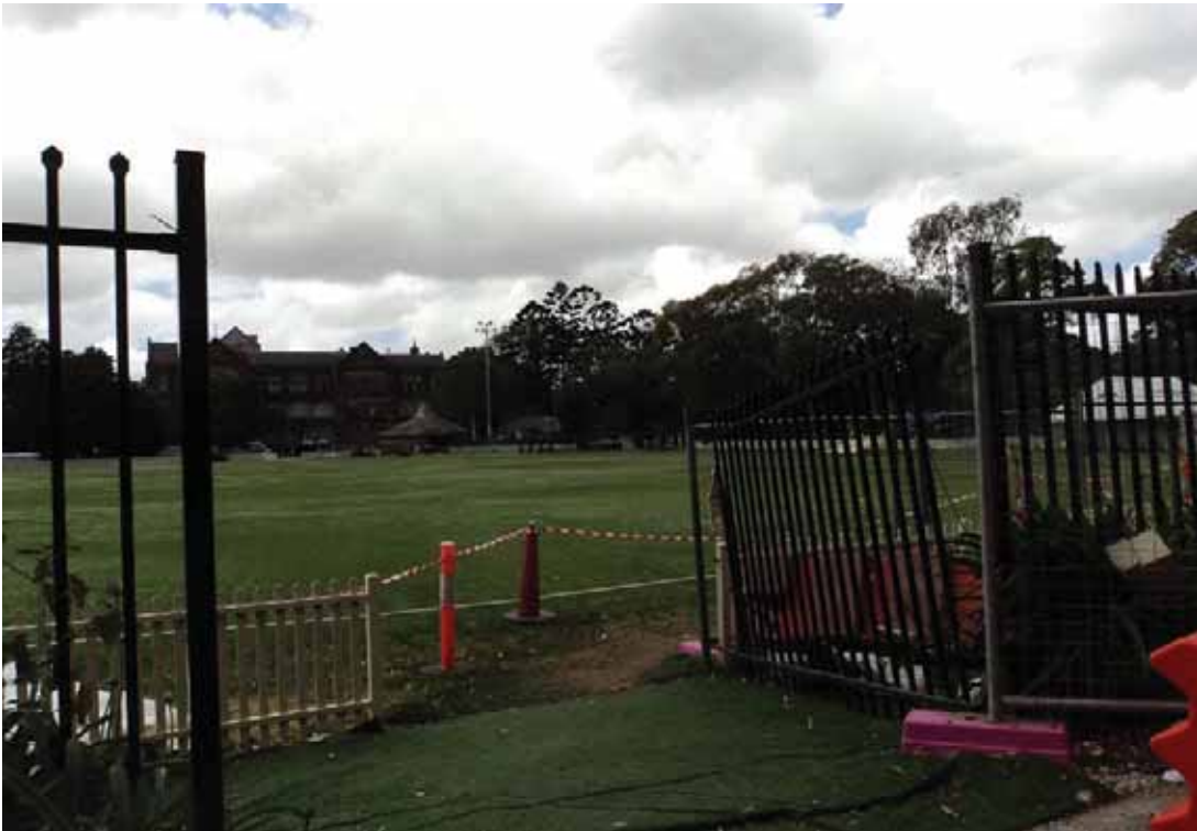
Photo 22 - Approximate area of proposed grandstand