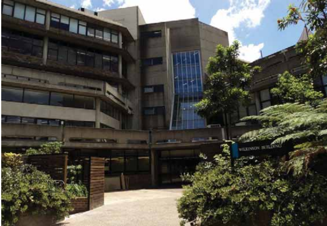
Photo 5 - Wilkinson Building facing west