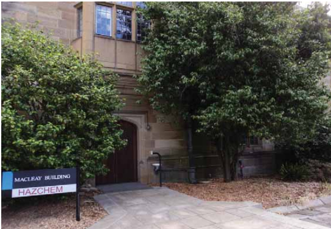
Photo 20 - Macleay Building