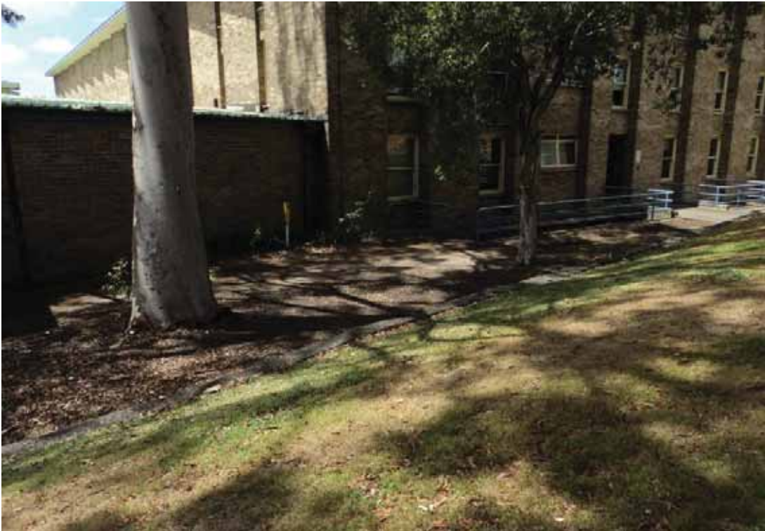
Photo 2 - Ground sloping towards Merewether Building