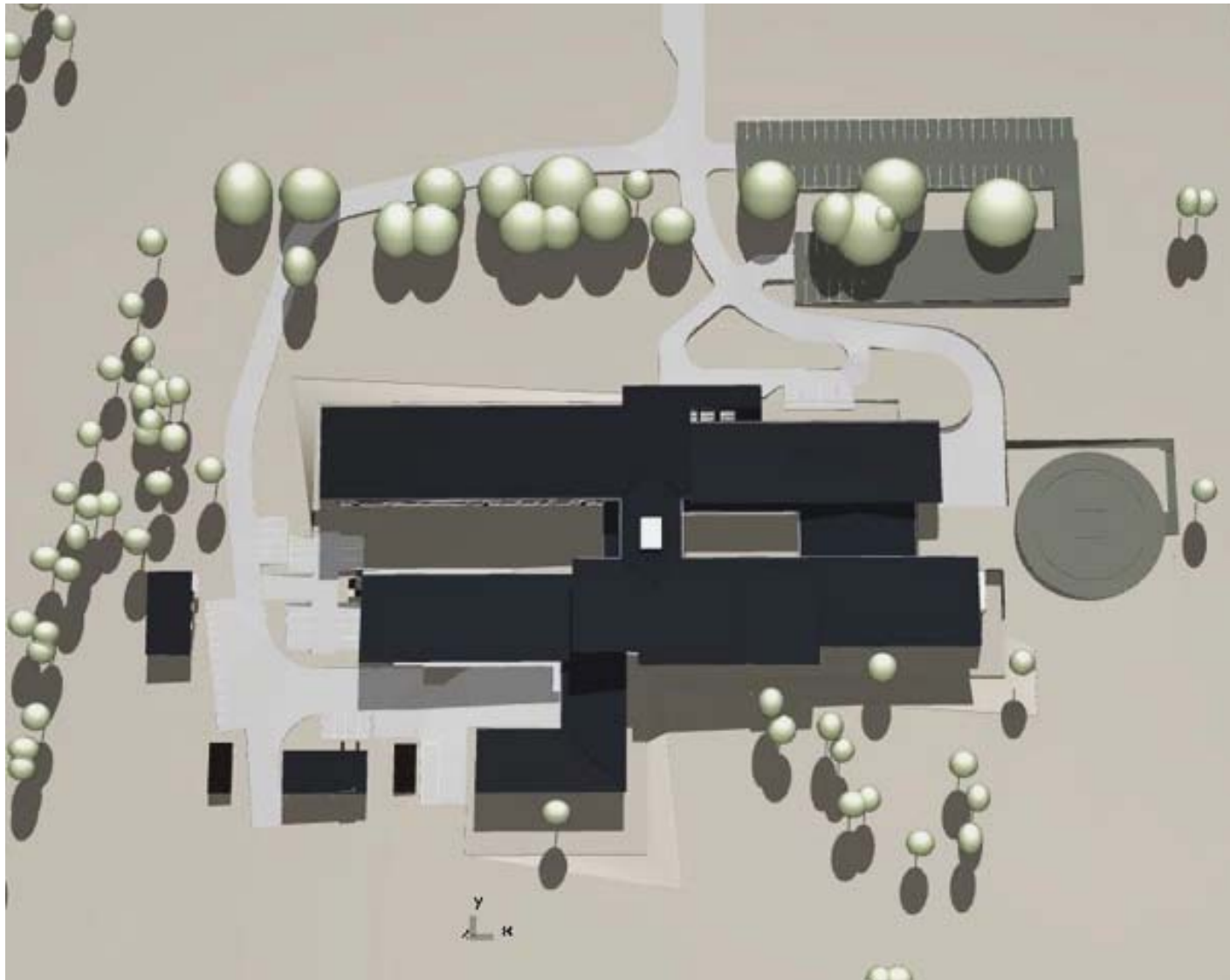
1 SHADOW DIAGRAM 12PM JUNE 21 NTS