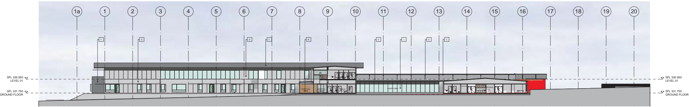
2 SECTION ALONG COURTYARDS LOOKING NORTH 1:250