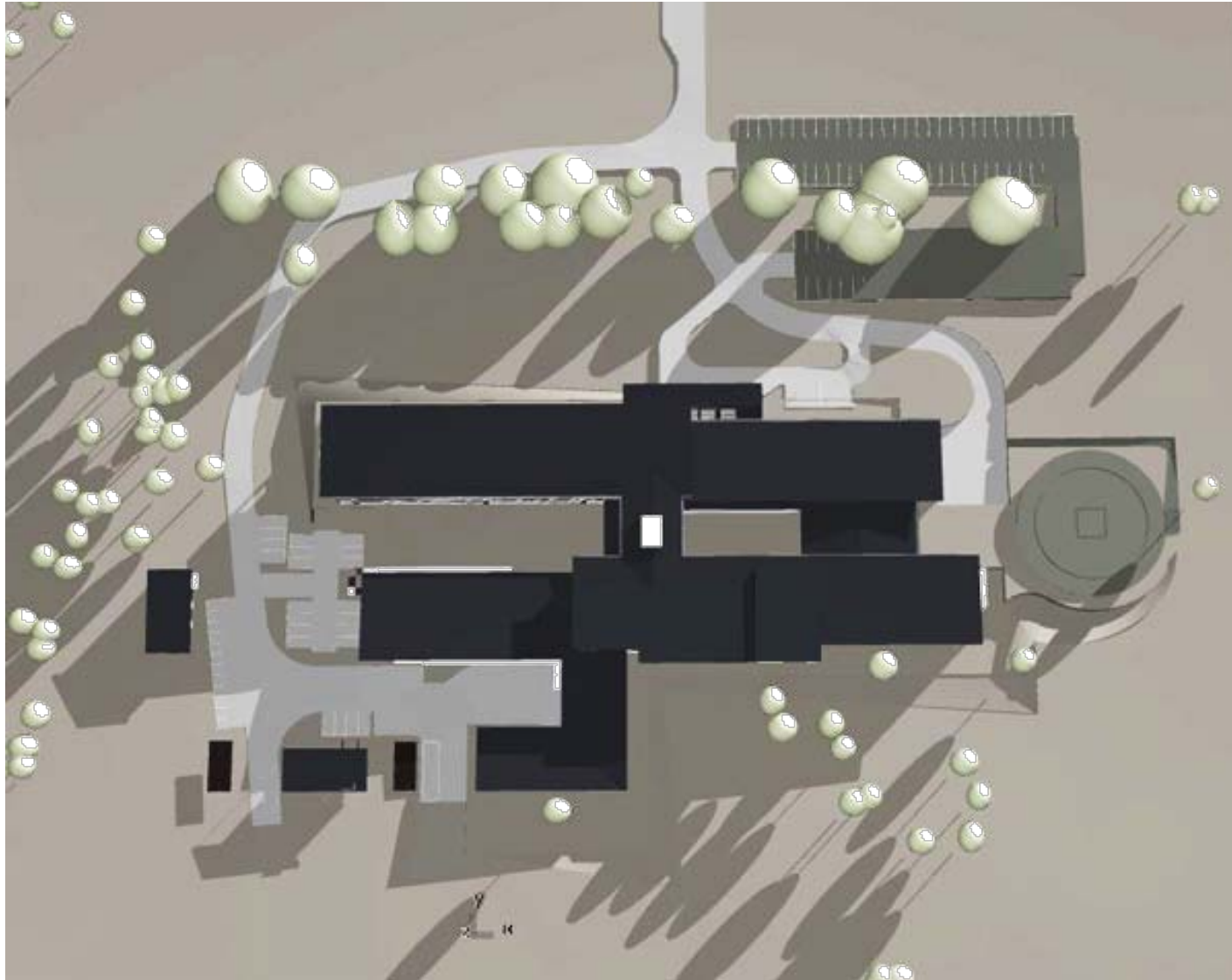
1 SHADOW DIAGRAM 9AM JUNE 21 NTS