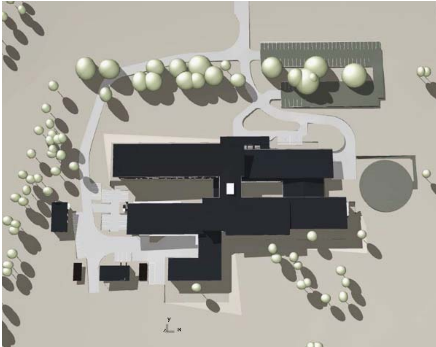
1 SHADOW DIAGRAM 3PM JUNE 21 NTS