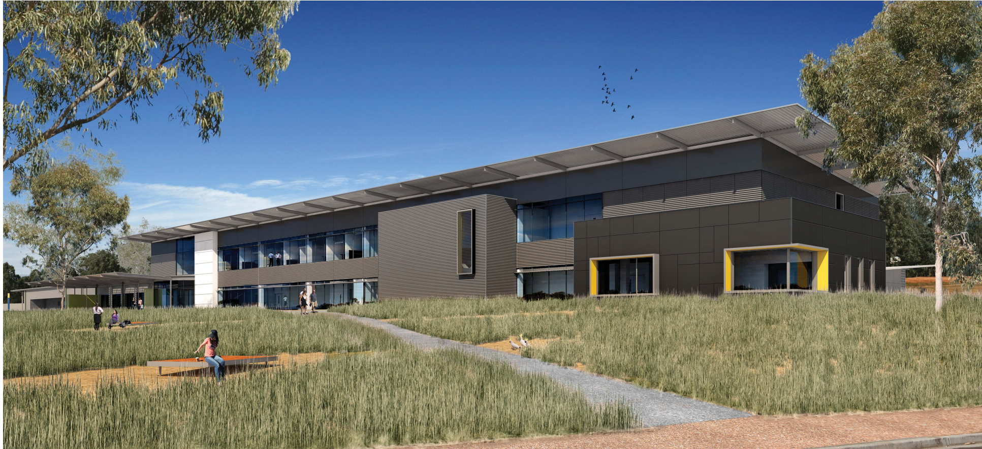
1 PERSPECTIVE NTS