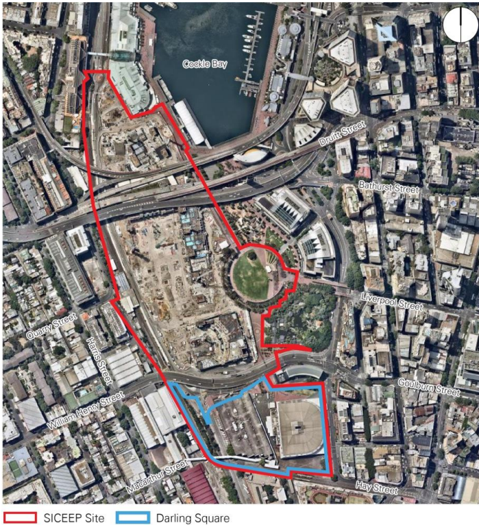
Figure 1 – Aerial Photograph of the SICEEP Site

The Modification Application Site relates to the North West Plot and surrounds as detailed within the architectural and landscape plans submitted in support of Modification Application. Figure 2 illustrates the North West Plot in the approved Concept Proposal.