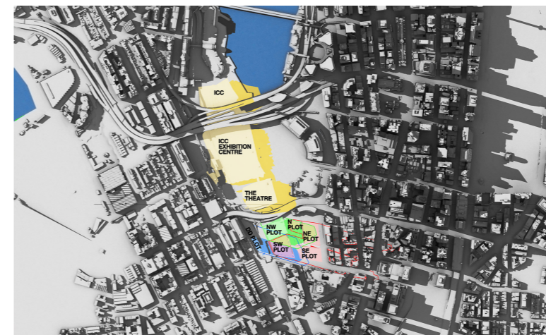
SICEEP - SSDA4 Shadow Study 21st September, 4pm ■ Shadows cast by SSDA4 building ↗ Parameter plan shadow NW Plot ■ Shadows cast by SSDA3 building ↘ Parameter plan shadow for DD plot ↖ Concept proposal parameter plan shadows for N, NE, SE + SW plots ■ Shadows cast by other buildings within the SICEEP site (PPP) ■ Shadows cast by Existing City Buildings