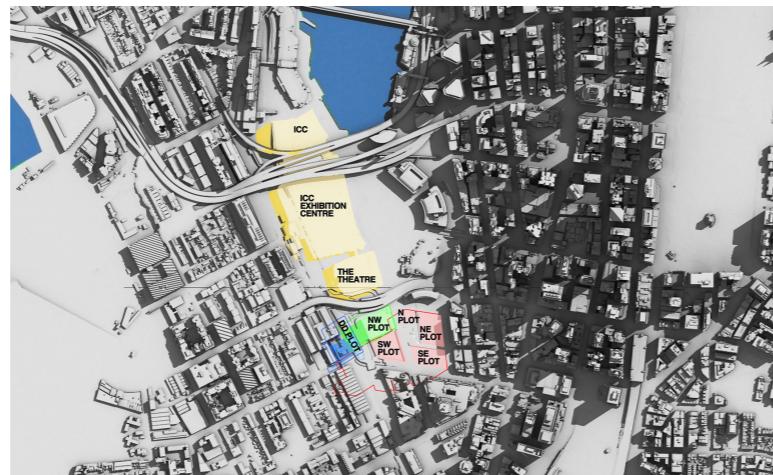
SICEEP - SSDA4 Shadow Study 21st September, 9am ■ Shadows cast by SSDA4 building ↗ Parameter plan shadow NW Plot ■ Shadows cast by SSDA3 building ↘ Parameter plan shadow for DD plot ↖ Concept proposal parameter plan shadows for N, NE, SE + SW plots ■ Shadows cast by other buildings within the SICEEP site (PPP) ■ Shadows cast by Existing City Buildings