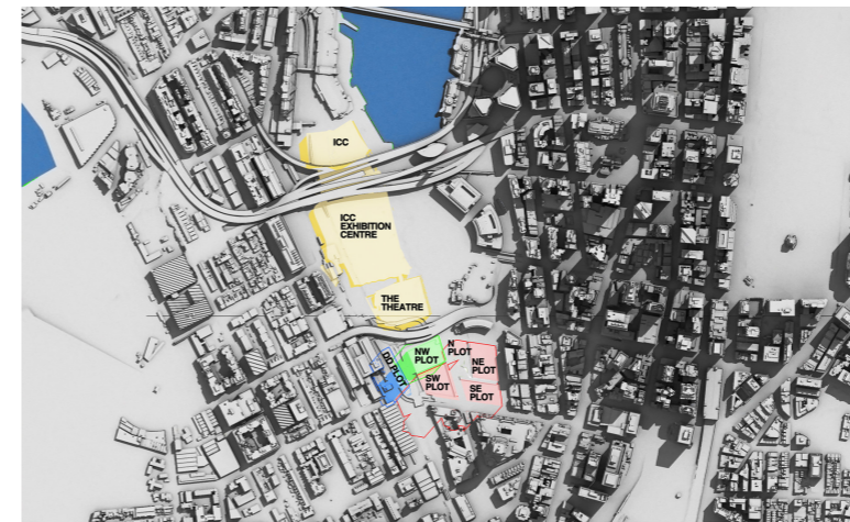
SICEEP - SSDA4 Shadow Study 21st September, 10am ■ Shadows cast by SSDA4 building ↗ Parameter plan shadow NW Plot ■ Shadows cast by SSDA3 building ↘ Parameter plan shadow for DD plot ↖ Concept proposal parameter plan shadows for N, NE, SE + SW plots ■ Shadows cast by other buildings within the SICEEP site (PPP) ■ Shadows cast by Existing City Buildings