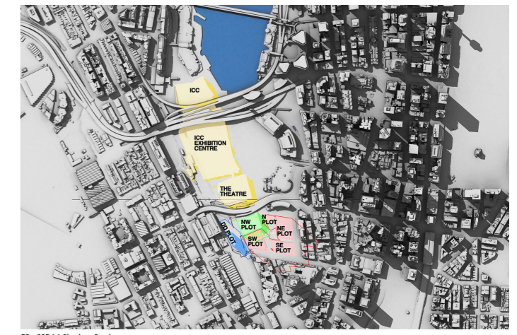
EP - SSDA4 Shadow Study 21st September, 2pm ■ Shadows cast by SSDA4 building ↗ Parameter plan shadow NW Plot ■ Shadows cast by SSDA3 building ↘ Parameter plan shadow for DD plot ↖ Concept proposal parameter plan shadows for N, NE, SE + SW plots ■ Shadows cast by other buildings within the SICEEP site (PPP) ■ Shadows cast by Existing City Buildings