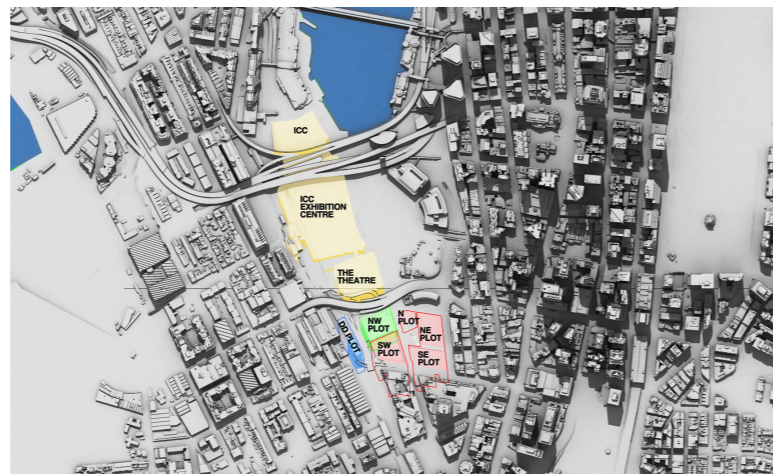
SICEEP - SSDA4 Shadow Study 21st September, 12pm ■ Shadows cast by SSDA4 building ↗ Parameter plan shadow NW Plot ■ Shadows cast by SSDA3 building ↘ Parameter plan shadow for DD plot ↖ Concept proposal parameter plan shadows for N, NE, SE + SW plots ■ Shadows cast by other buildings within the SICEEP site (PPP) ■ Shadows cast by Existing City Buildings