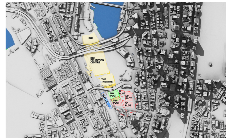
SICEEP - SSDA4 Shadow Study 21st September, 1pm ■ Shadows cast by SSDA4 building ↗ Parameter plan shadow NW Plot ■ Shadows cast by SSDA3 building ↘ Parameter plan shadow for DD plot ↖ Concept proposal parameter plan shadows for N, NE, SE + SW plots ■ Shadows cast by other buildings within the SICEEP site (PPP) ■ Shadows cast by Existing City Buildings