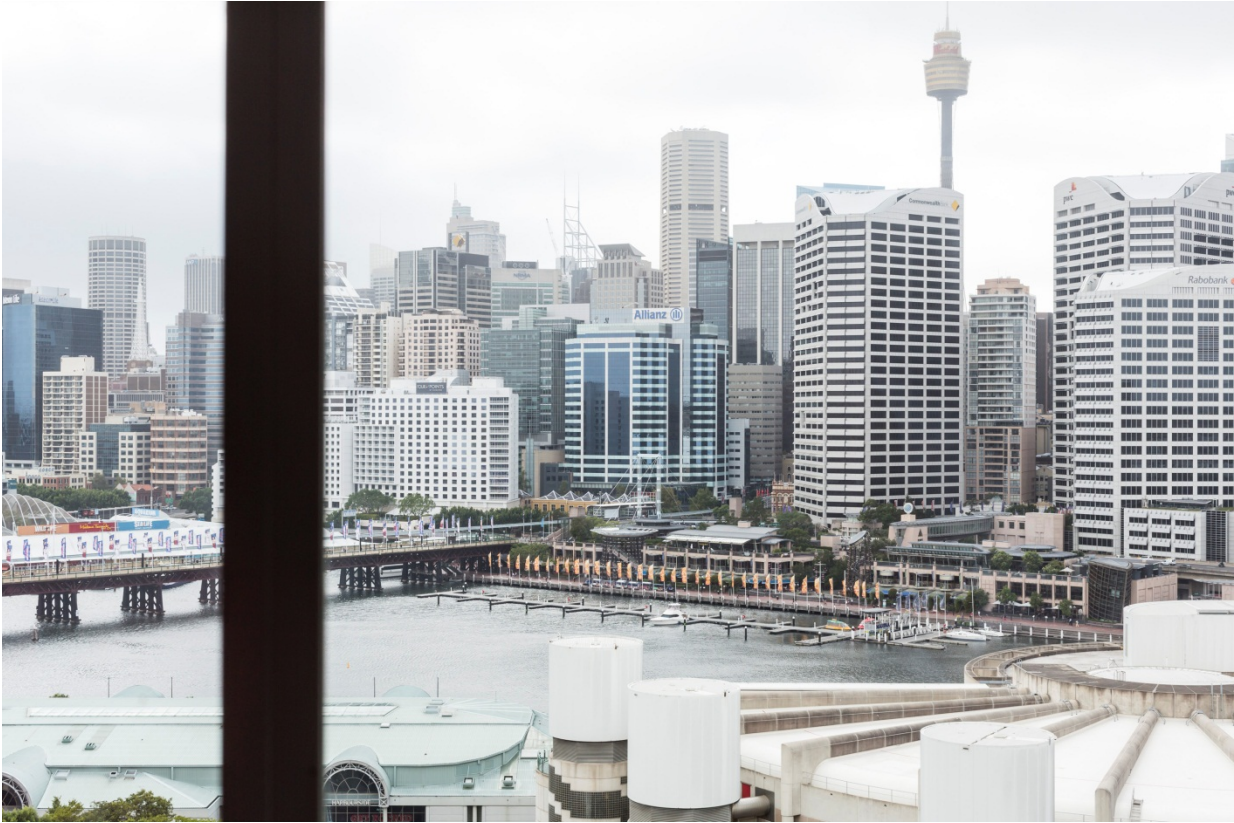
SICEEP-Goldsbrough 1330 E Existing