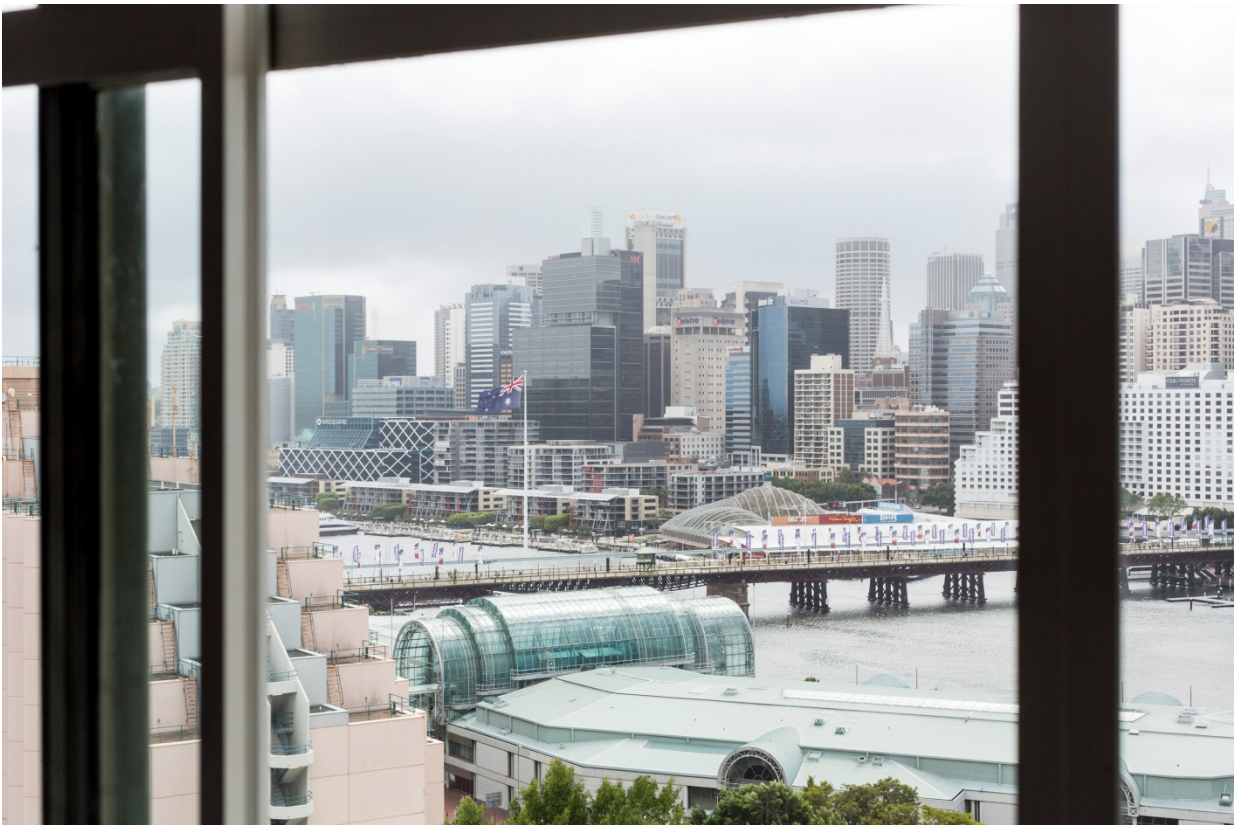
SICEEP-Goldsborough 1330 N