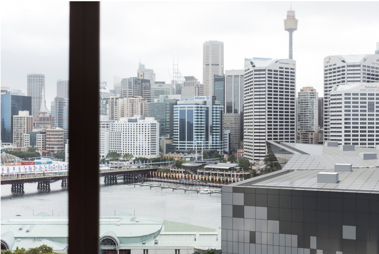
[SICEEP-Goldsbrough 1330 E