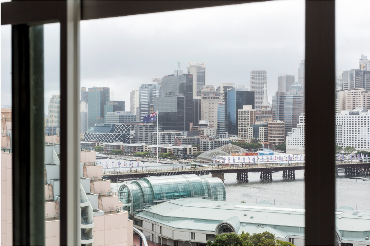
SICEEP-Goldsborough 1330 N EXISTING