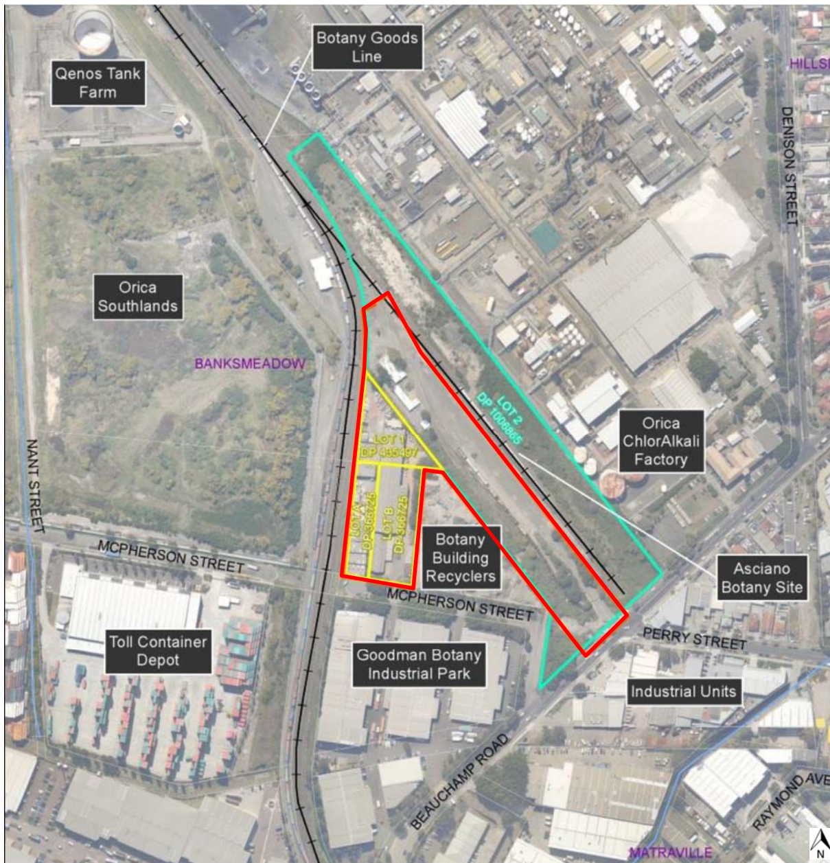
Figure 2: Aerial view of the site (outlined in red) and its immediate surroundings

The Botany Goods Line lies to the west and an existing rail siding lies to the east of the site. The Botany Industrial Park (BIP) is located to the north and comprises a precinct including facilities that manufacture chemicals, surfactants and plastics. The Goodman Industrial Park is located to the south, which is used for freight warehousing (refer to Figure 2 ).