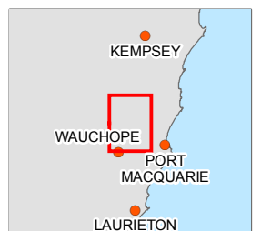
Figure 1-1 Site location