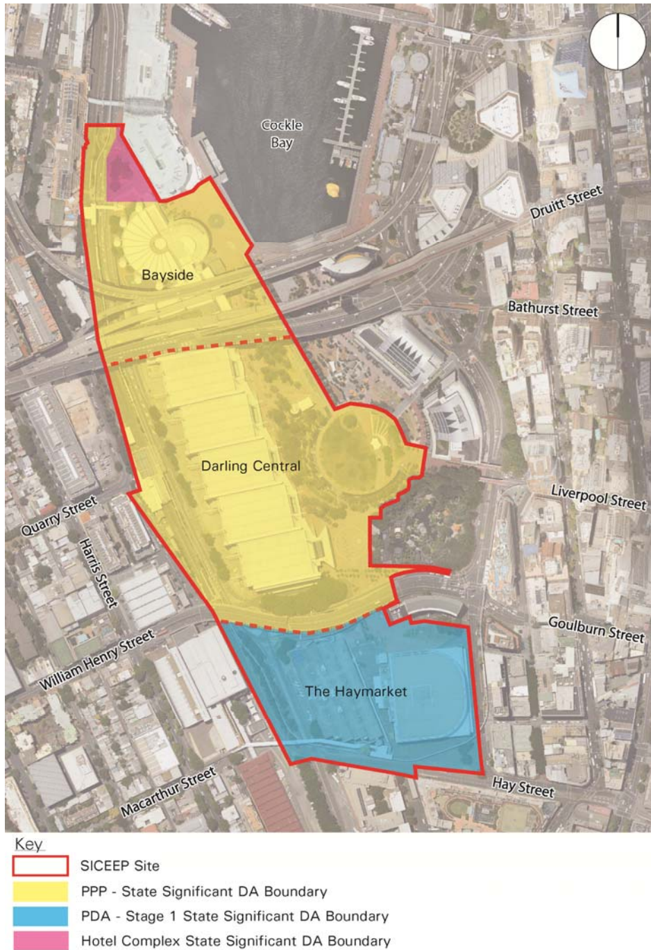
Figure 1 – Site Location Plan