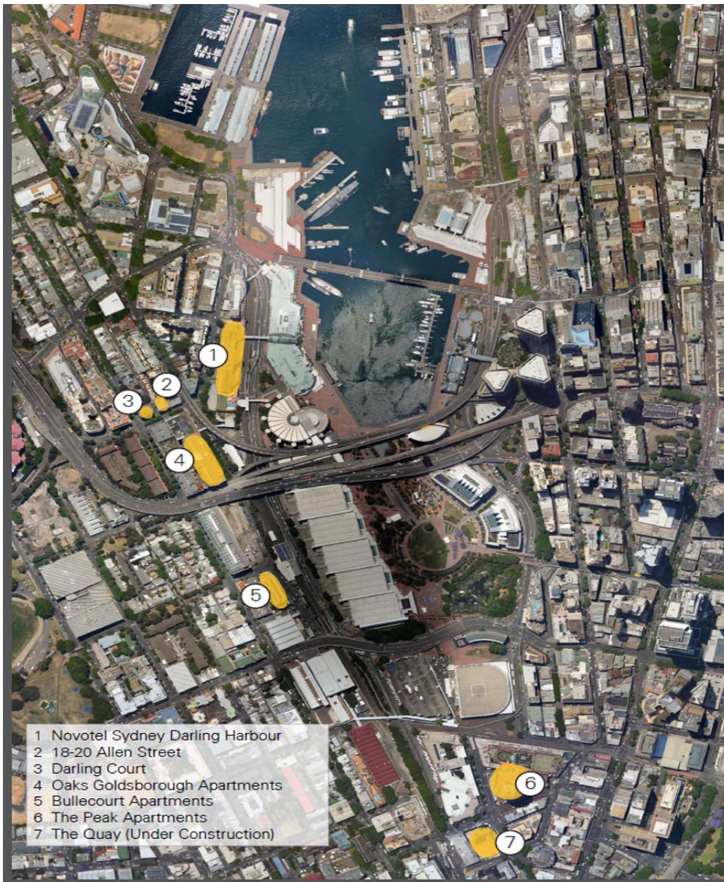
Figure 3 – Key Buildings (Private Views)