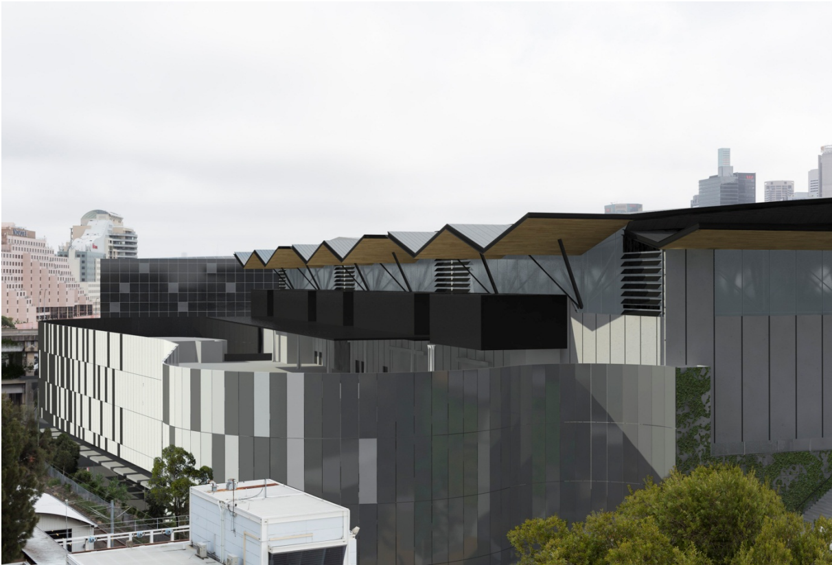
SICEEP-Bullecourt 913 N