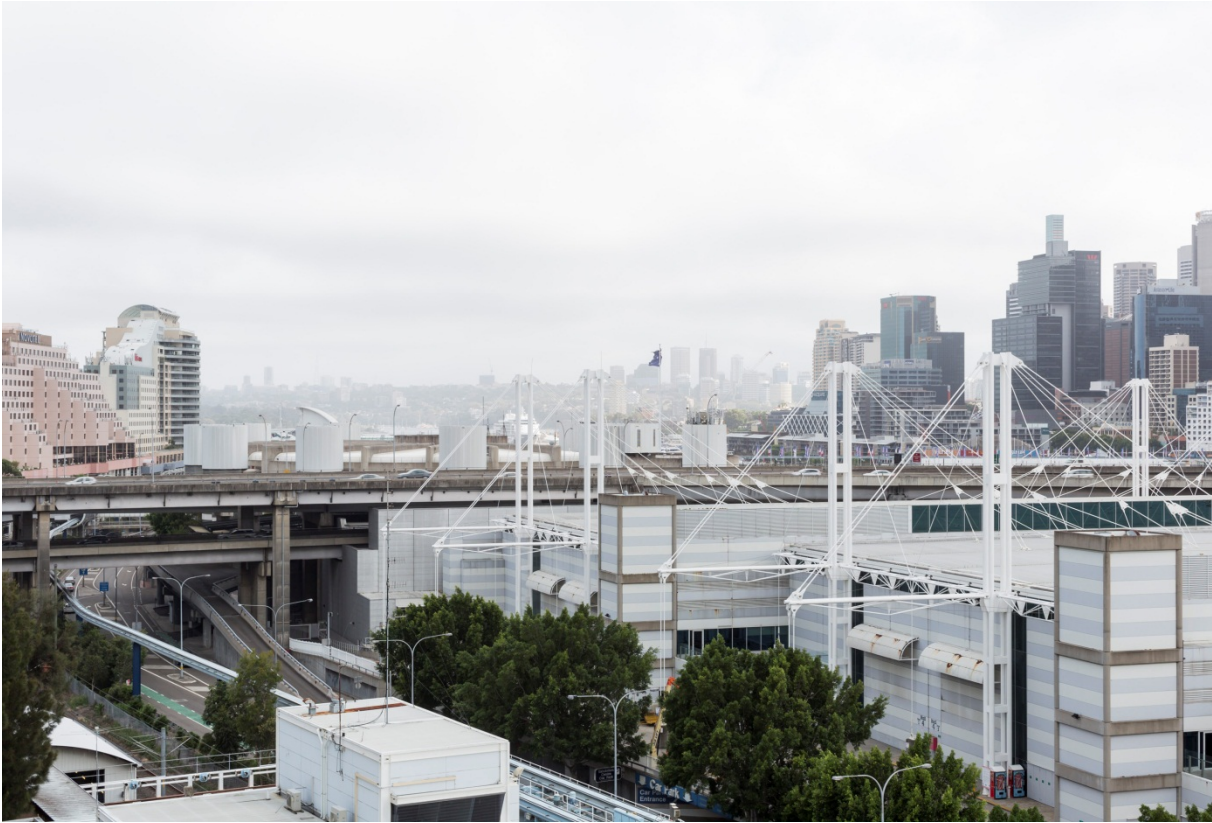
SICEEP-Bullecourt 913 N EXISTING