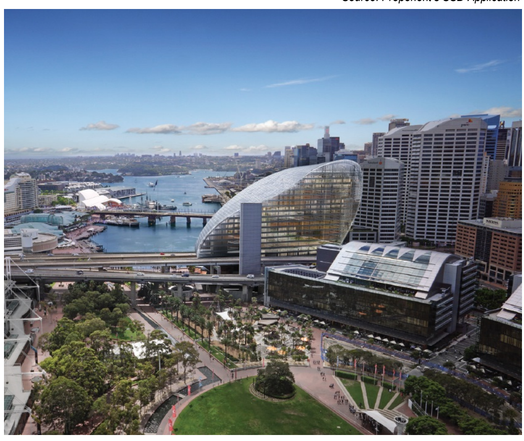
Figure 2. Proposed IMAX building with Tumbalong Park and Darling Quarter foreground