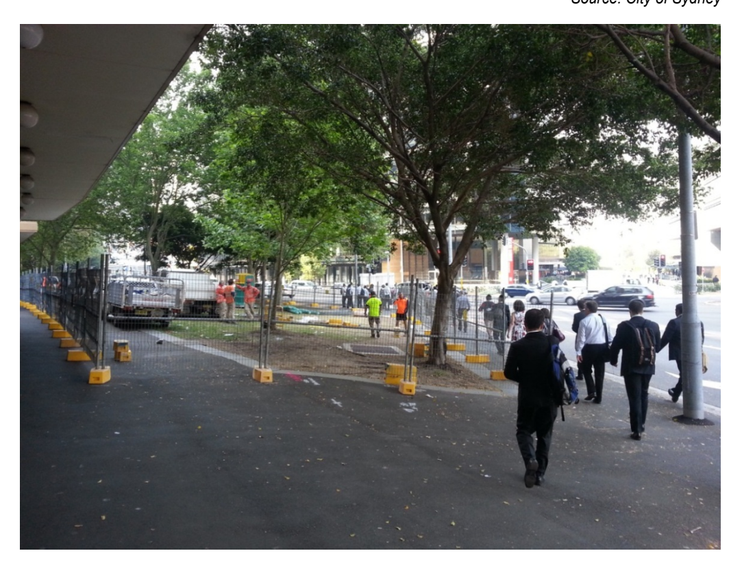
Figure 7. Remedial works to rectify pedestrian inadequacies

An assessment of the adequacy of existing footpaths and intersections along the Bathurst Street and Druitt Street routes should be undertaken to determine pinch points, inadequate footpaths and inadequate circulation/storage around intersections taking into account forecasted pedestrian traffic from the proposal.