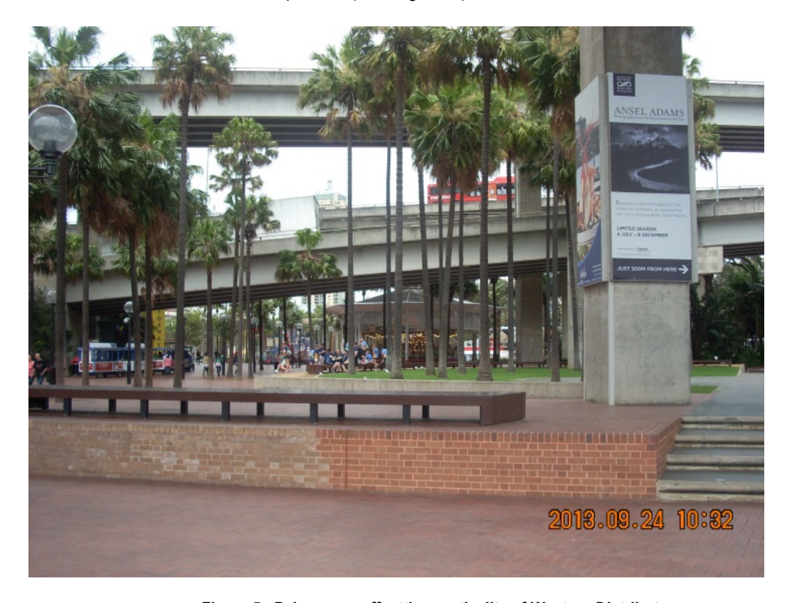
Figure 5. Palm grove offsetting verticality of Western Distributor expressway

The palms currently provide a vertical element within the space and improve the visual aesthetic of the concrete overpasses (see Figure 5)