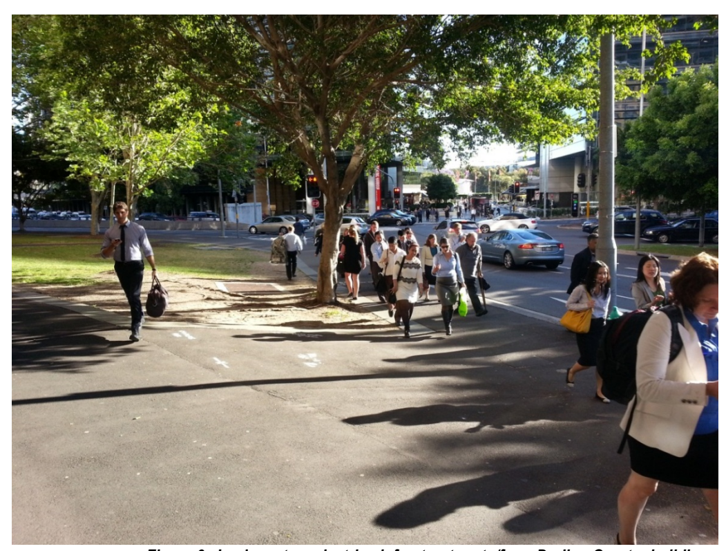
Figure 6. Inadequate pedestrian infrastructure to/from Darling Quarter buildings

The Bathurst Street/Day Street leg to Town Hall Station is often already over capacity from workers to/from the Darling Quarter Towers. The existing footpath infrastructure along Day Street cannot cater for Darling Quarter office traffic, leading pedestrians to veer onto grass landscaping and tree roots. As at mid October 2013, remedial works are in progress to widen and align the footpaths and limit damage to landscaping (Figures 6 and 7).