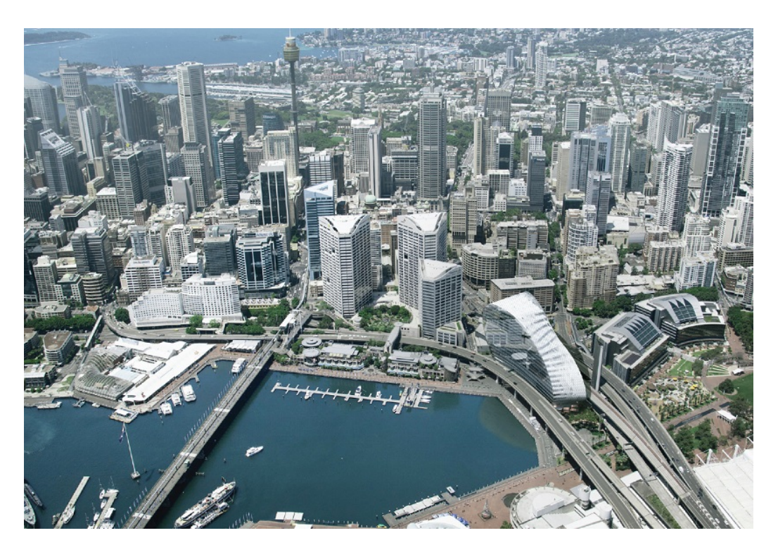
Figure 1. Proposed IMAX building against CBD backdrop