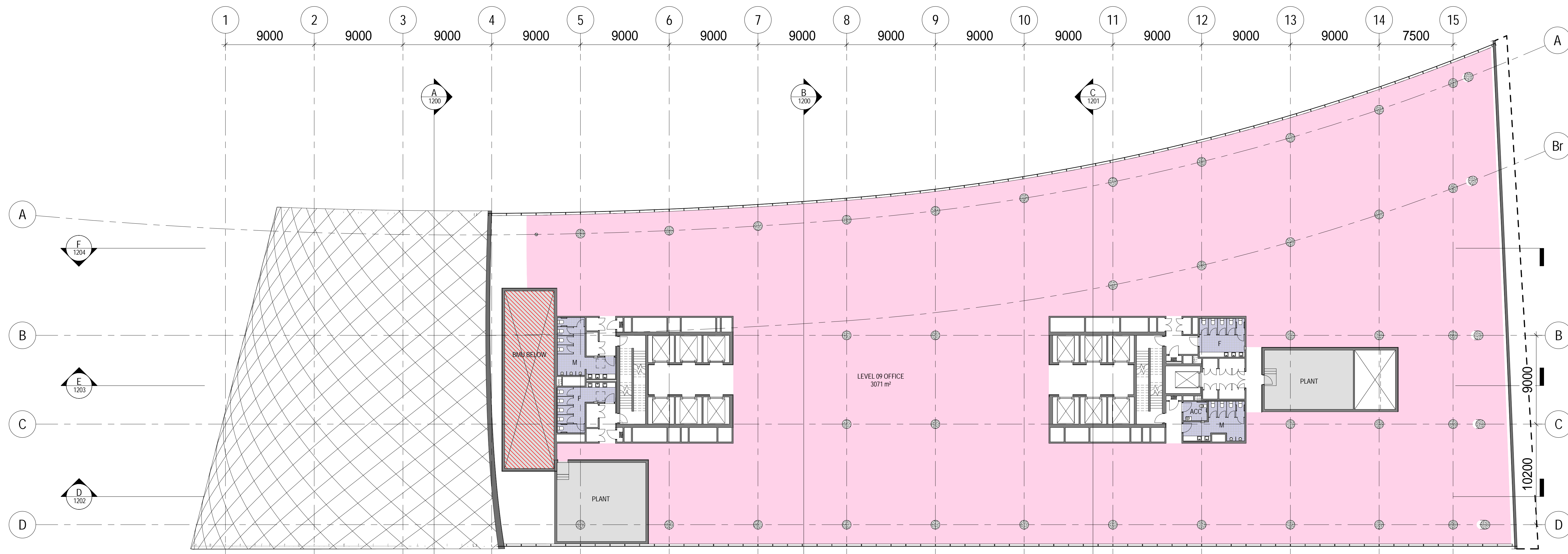
1 OFFICE_L09 1:200