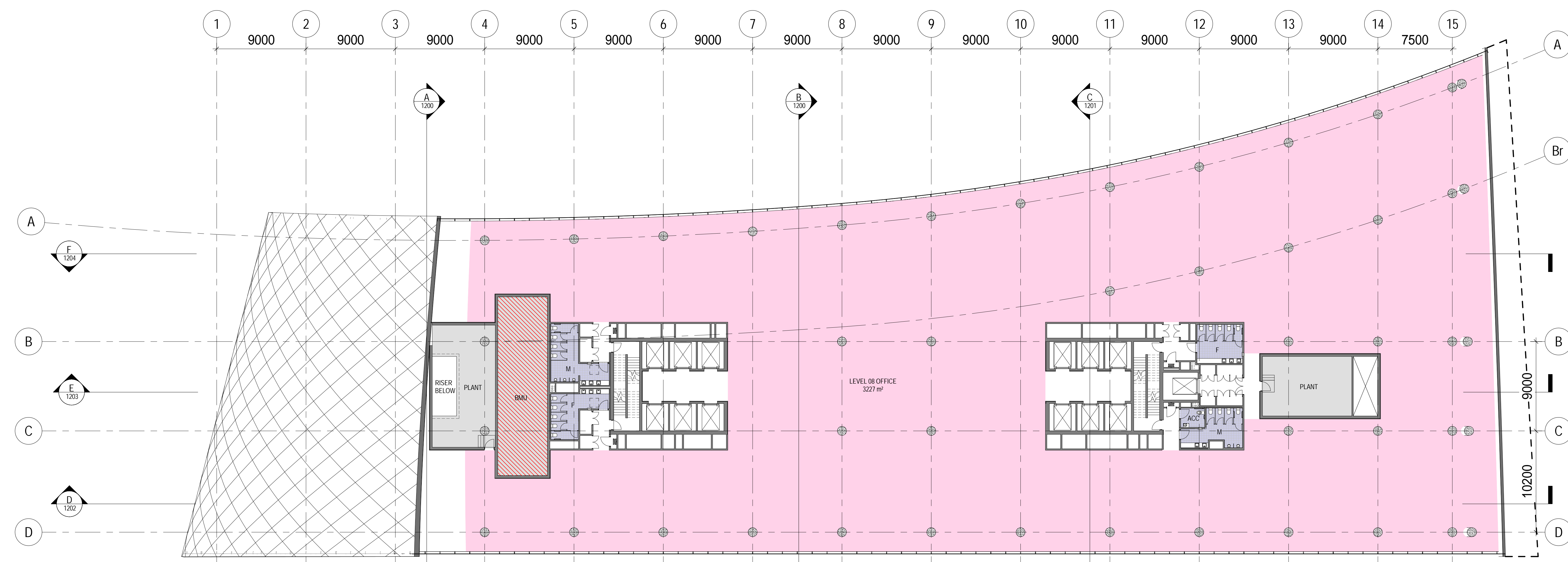
2 OFFICE_L08 1:200